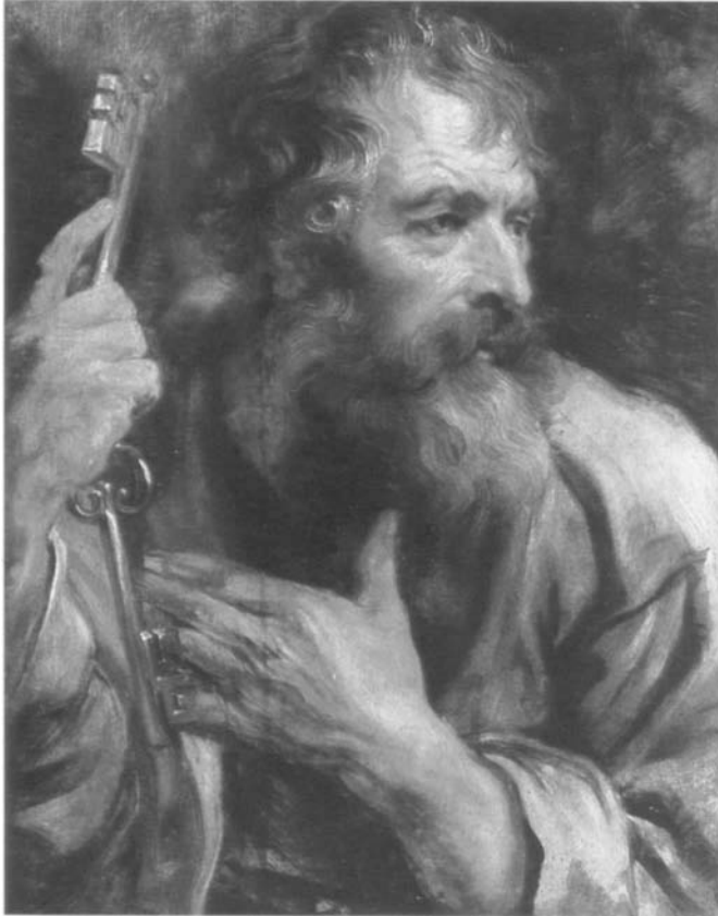
Figure 34 Peter Paul Rubens. Saint Peter , circa 1610. Oil on panel, 108 × 84 cm (42½ × 33⅜ in.). Madrid, Museo del Prado (1646).