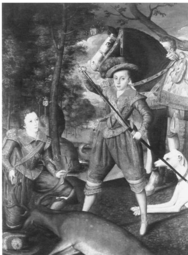
Figure 11 Robert Peake the Elder. Henry, Prince of Wales (1594–1612) with John, 2nd Lord Harington of Exton (1592–1614), 1603. Oil on canvas, 203.3 × 147.4 cm (79 ½ × 58 in.). New York, Metropolitan Museum of Art (44.27).

is hardly surprising that the Earl of Arundel was prominent among the members of the new court. As his son was later to claim, Arundel “was most particularly favored” by Henry, who “was known to value none but extraordinary persons,” 9 an assessment borne out by the names of those surrounding him, men of action as well as the earliest connoisseurs and collectors. Apart from sharing a taste for taking part in masques, tilts, pageants, and other entertainments, and for hunting—they first performed together in the pageant known as “Prince Henry’s Barriers” [FIGURE 12], designed by Inigo Jones to celebrate Henry’s investiture as Prince of Wales in 1610—Arundel was regarded by Henry as a trusted adviser on the merits of works of art. In 1610 Lord Salisbury was informed that if he was unable to pre-