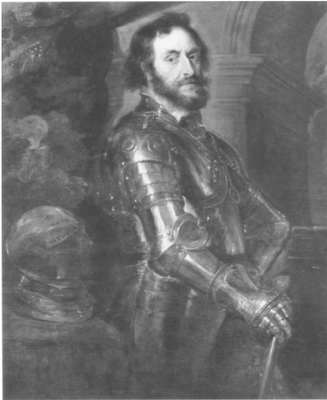
Figure 50 Peter Paul Rubens. Thomas Howard, 2nd Earl of Arundel, 1629/30. Oil on canvas, 127 × 101.6 cm (50 × 40 in.). Boston, Isabella Stewart Gardner Museum.

unjustly held responsible for the marriage and was sent to the Tower, from where he was only released under pressure from the House of Lords. But even then he remained out of favor with the king until a reconciliation was brought about in July 1628. Only a month later Buckingham was assassinated, and shortly afterward Arundel was said to have “grown into great grace with the King.” 84 He once again occupied his apartments at the royal palace at Whitehall, and as a mark of the new relationship, Charles, with the queen, paid a visit to Arundel House to inspect Arundel’s collection.