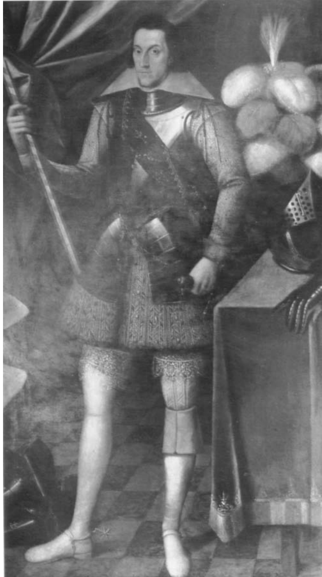
Figure 12 Anonymous (English). Thomas Howard, 2nd Earl of Arundel Attired for the Barriers , circa 1610. Arundel Castle, The Duke of Norfolk.