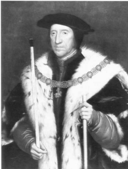
Figure 6 Hans Holbein the Younger. Henry Howard, Earl of Surrey (circa 1517–1547) , circa 1542. Oil on panel, 55.5 × 44 cm (21 7/8 × 1 3/4 in.). São Paulo, Museo de Arte.