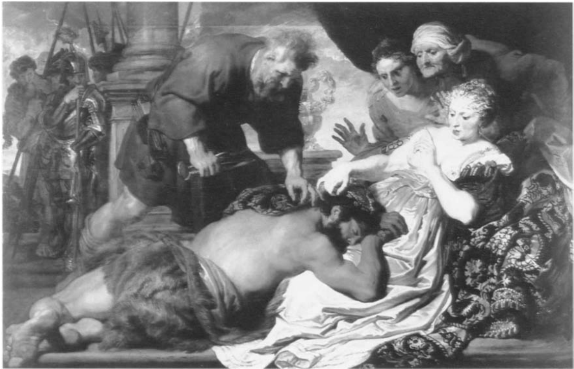
Figure 30 Anthony van Dyck. Samson Asleep in Delilah's Lap , circa 1619/20. Oil on canvas, 149 × 229.5 cm (58½ × 89½ in.). London, Dulwich Picture Gallery (127).

the ideal Counter-Reformation artist, instructing and confirming the viewer in his faith. In contrast, Van Dyck's rendering of similar subjects, for all their brilliance of execution, tended for the most part to seek a different quality from the richly corporeal substance of Rubens's works. This difference is very apparent in the treatment by the two artists of the theme of Samson and Delilah, although separated from one another by about a decade. Rubens's version [FIGURE 29], painted just after his return from Italy, exudes immense strength and solidity, whereas Van Dyck's very personal reworking of the subject [FIGURE 30], possibly executed just before he went to England, shows much less sense of spatial depth and physical presence. It was only after he went to Italy in 1621 and came strongly under the influence of Titian, exchanging the heroic subjects treated by Rubens for more lyrical themes, that Van Dyck realized a new vein which obviated the contest of trying to compete with Rubens on his own terms.