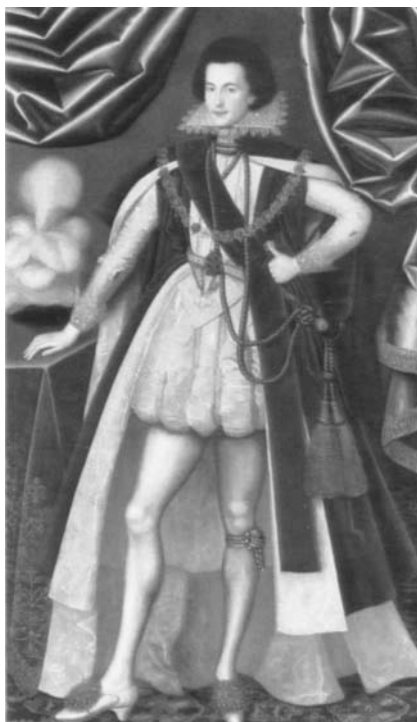
Figure 8 Attributed to William Larkin (English, fl. 1610–1620). George Villiers, 1st Duke of Buckingham (1592–1628) , circa 1616. Oil on canvas, 203.7 × 119.5 cm (81 × 47 in.). London, National Portrait Gallery (3840).

from England before Arundel's appointment as Earl Marshal, the golden staff, the symbol of office, would have been included, as it had been so prominently in Holbein's portrait of his ancestor [FIGURE 5]. But it is likely that to celebrate his latest appointment Arundel commissioned the lavish illustrated book recording the history of the Earls Marshall of England from the time of King Henry I to that of James I. 6