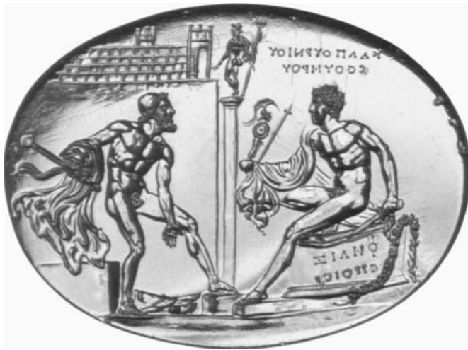
Figure 22 Roman (early first century, A.D.). The Felix Gem . Carnelian, 2.7 × 3.4 cm (1 1/8 × 1 3/8 in.). Oxford, Ashmolean Museum (1966.1808).

identified, such as the famous album of studies by Leonardo da Vinci (Windsor Castle) acquired by 1627, and others recorded in Hollar’s etchings, there were clearly very many more. If the collection belonging to Arundel’s son, William Howard, Lord Stafford, was wholly or largely inherited from his father, we can gain some notion of the sheer quantity from what was sold in 1720, namely two hundred pictures, over two thousand drawings, and over six thousand prints.