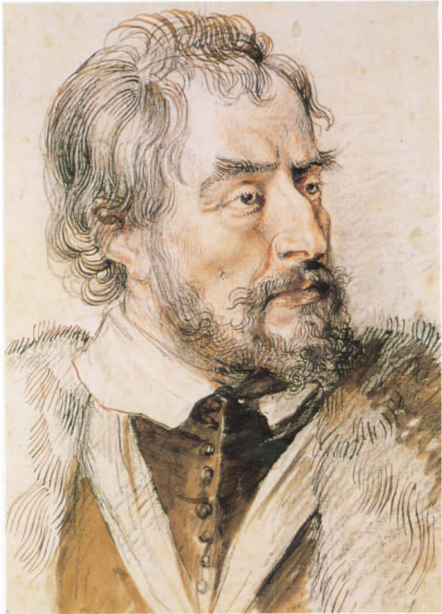
Figure 49 Peter Paul Rubens. Thomas Howard, 2nd Earl of Arundel. 1629/30. Pen and brush in brown ink over black and red chalk, washed with white body- color, 28 × 19 cm (11 × 7½ in.). Oxford, Ashmolean Museum.