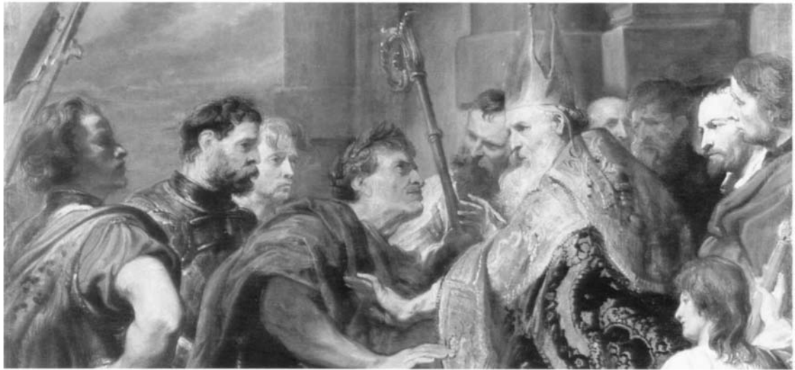
Above: Figure 27 Anthony van Dyck. The Emperor Theodosius Refused Entry into Milan Cathedral (detail).

circa 1619/20. Oil on canvas, 149 × 113.2 cm (58 7/8 × 44 7/8 in.). London, National Gallery (50).