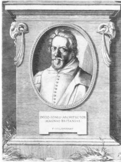
Figure 13 Francesco Villamena (Italian, 1566–1624). Inigo Jones , circa 1614. Engraving, 25.2 × 19.2 cm (10 × 7½ in.). Oxford, Ashmolean Museum, Hope Collection.

From an artistic point of view, the most important person at Prince Henry's court was Inigo Jones [FIGURE 13], who, despite never having designed a building, was appointed as the prince's surveyor in 1610. Jones was already well known to Henry as a designer of masques and festivals, which played such an important part of life at the Stuart court, and it may have been through such work that he met Arundel, an event which must have taken place by 1606, when the earl performed in a masque designed by Jones. But the close association between Arundel and Jones only developed the year after the prince's death, when both men were members of the party sent to accompany Henry's sister, Elizabeth, and her new husband, Frederick V, the Elector Palatine of the Rhine, to Heidelberg. From there the two men went on to Italy for what was to be an entirely educational experience, lasting eighteen months. For both it was their second visit, and Arundel, who was fulfilling the prophecy of Carleton's agent, had discovered in Inigo Jones the ideal learned companion, who was as interested in antiquity and sixteenth-century Italian art as he was in immersing himself in a study of architecture, both ancient and modern, in preparation for his new profession.