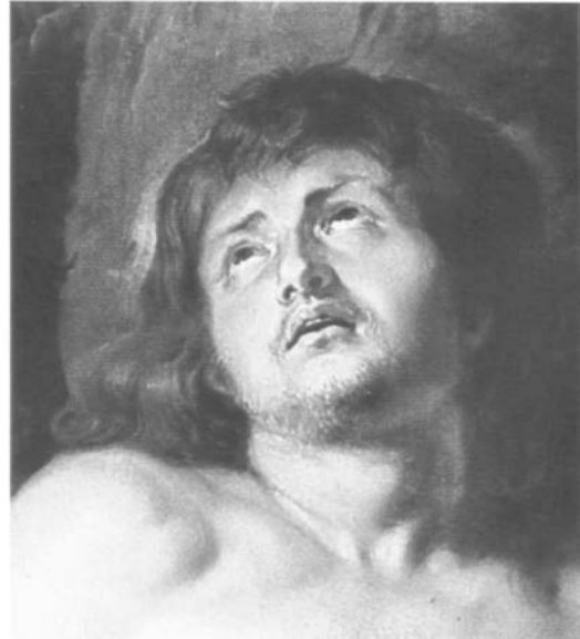
Figure 33 Peter Paul Rubens. The Martyrdom of Saint Sebastian (detail), circa 1615. Oil on canvas, 200 × 128 cm (78 3/4 × 50 3/8 in.). Berlin, Staatliche Museen, Gemäldegalerie (798-H).

both the northern and southern Netherlands, and which Van Dyck himself returned to about the same time in the painting Venus and Adonis [FIGURE 47].