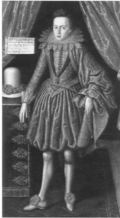
Figure 7 Robert Peake the Elder (English, fl. 1576–died 1626?). Charles I as Prince of Wales (1600–1649), circa 1612/3. Oil on canvas. 158.7 × 87.7 cm (62 ½ × 34 ½ in.). Cambridge, The Univer- sity of Cambridge.

In 1611 Arundel made a further advance, when in company with the king's younger son, Charles [FIGURE 7], then Duke of York, he was created a Knight of the Garter. (The Order, an English rival to the Burgundian Golden Fleece, had been upgraded by Elizabeth, who saw it as a means of creating loyal support for the monarch among the highest in rank, and under the Stuarts it continued to be regarded as the prime order of chivalry.) And ten years later, in July 1621, the king, as a token of his continuing favor, permanently confirmed Arundel as Earl Marshal of England. This office, both ceremonial and powerful, had been held by his ancestors from the time of the second duke; from 1616, however, he had been made to share it in commission with five others. This honor entitled Arundel to carry the gold-topped staff engraved with the king's arms as well as his own. Given the prominence of the Garter in Van Dyck's portrait of the earl, we may guess that, had the painting not been finished and the artist departed