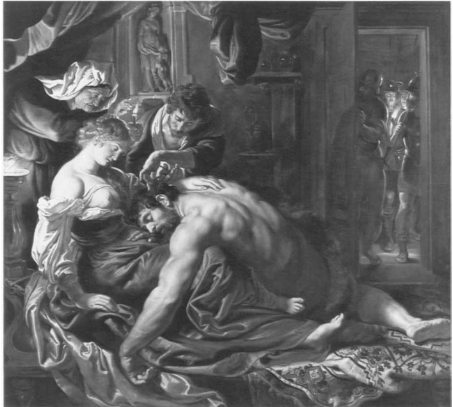
Figure 29 Peter Paul Rubens. Samson Asleep in Delilah's Lap , circa 1609. Oil on panel, 185 × 205 cm (72 7/8 × 81 in.). London, National Gallery (6461).

older master in his own subjects. Here he takes a contemporary painting of the subject (Gemäldegalerie, Dresden) as his starting point, which he then develops in a variety of styles, adopting a roughly painted naturalism. When he chose to, Van Dyck was a very skillful imitator of Rubens, as can be seen in his reduced version [FIGURE 27] of Rubens's painting Emperor Theodosius Refused Entry into Milan Cathedral [FIGURE 28], in which he significantly changes the appearance of two of the heads and introduces a clearly recognizable portrait of Rubens's patron Nicholas Rockox. 49