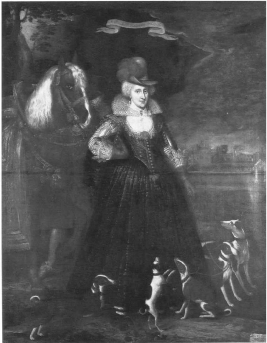
Figure 9 Paul van Somer (Flemish, circa 1576–circa 1621/2), Queen Anne of Denmark (1574–1619) , 1617. Oil on canvas, 233.7 × 147.6 cm (92 × 58 ½ in.). Windsor Castle, H.M. The Queen.