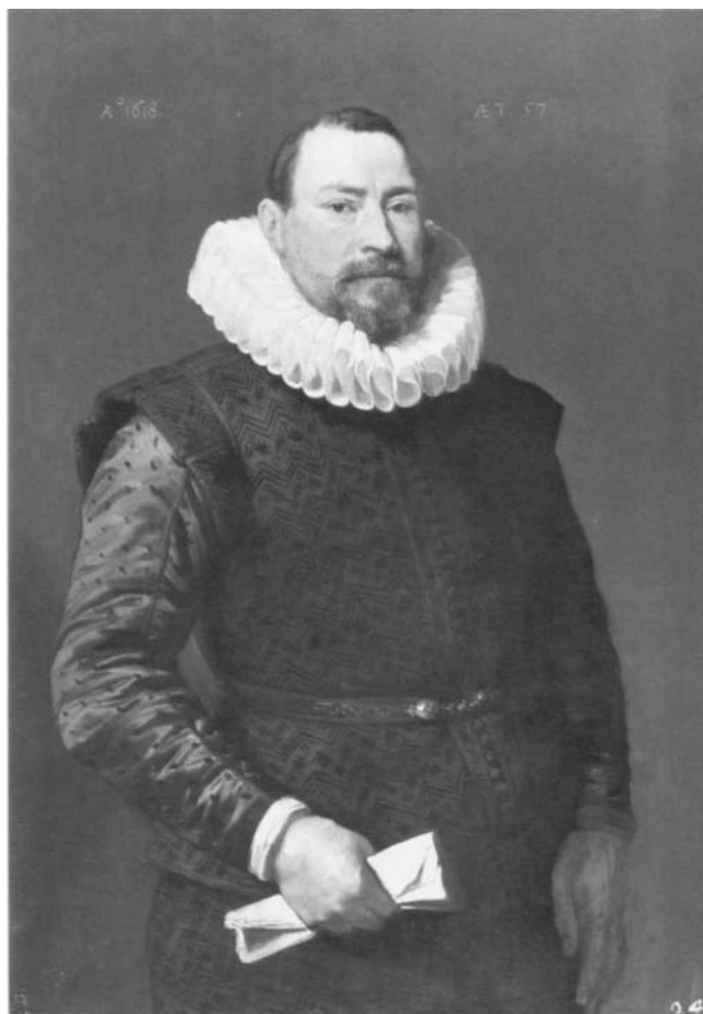
Figure 38 Anthony van Dyck. A Fifty-Seven-Year-Old Man , 1618. Oil on panel, 105.8 × 73.5 cm (41 ¼ × 28 ¾ in.). Vaduz, The Prince of Liechtenstein (70).

of the Guild of Saint Luke and was allowed to practice independently. On two large panels prominently dated 1618, he imposingly portrayed a man and his wife, both aged fifty-seven, three-quarter-length [FIGURE 38]. 56 Seen against a plain background, the static, soberly dressed figures follow a convention going back to the sixteenth century, introduced notably by Anthonis Mor both in the southern Netherlands and in Spain, which was continued contemporaneously by such artists as Frans Pourbus the younger. (Were more known about the early works of Frans Hals, who supposedly visited Antwerp in 1616, it might have been possible to attribute some of the directness of Van Dyck's treatment of his sitters to his