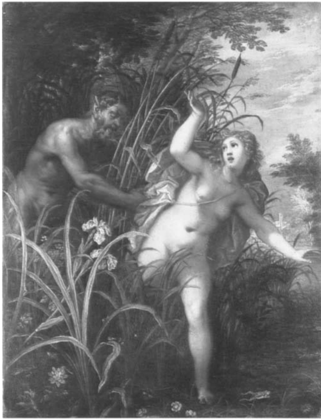
Figure 24 Hendrick van Balen the Elder (Flemish, 1575?–1632) and a follower of Jan Brueghel the Elder (Flemish, 1568–1625). Pan Pursuing Syrinx , circa 1615. Oil on copper, 25 × 19.4 cm (9 7/8 × 7 7/8 in.). London, National Gallery (659).

1577, had gone to Italy in 1600 where, besides completing his artistic education by studying the art of the past and the present, he had begun to establish a successful practice as a painter of altarpieces. His mother's death in 1608, however, brought him home sooner than he intended, and after an agonized debate whether to return to Italy, he finally decided to remain in Antwerp and establish his studio in the very year that Van Dyck was apprenticed to Van Balen. Rubens quickly established his supreme unrivaled position among his contemporaries, and although there was a considerable amount of work for other artists, some of it, as we shall see, was in areas which did not interest Rubens. He was soon attracting the major commissions in the city and was in the happy position of choosing what he wanted and on his terms.