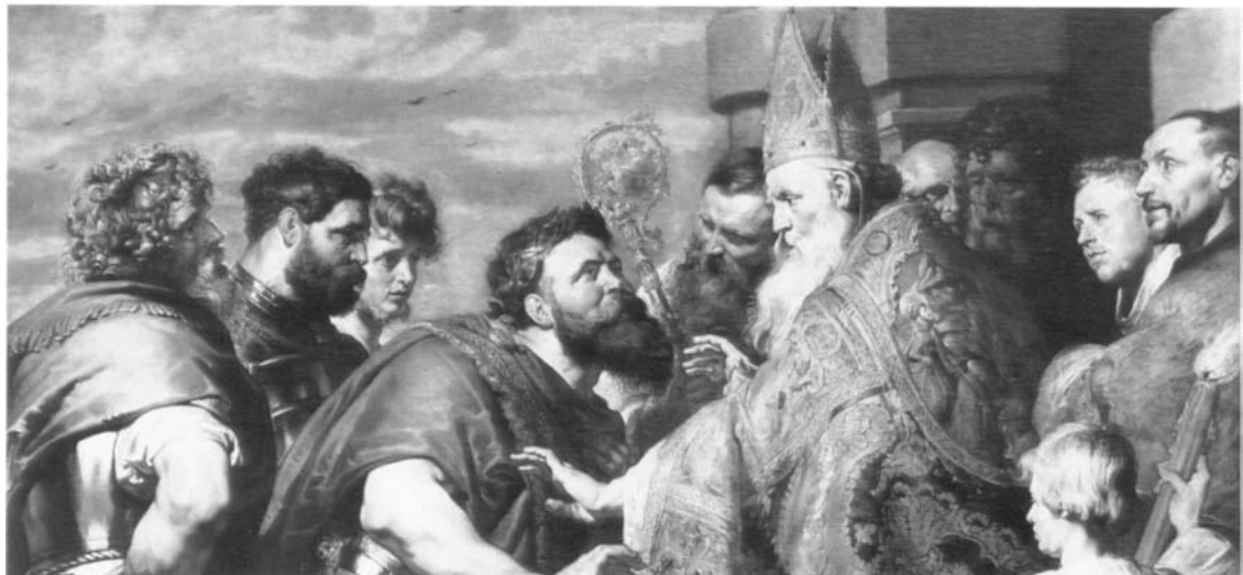
Figure 28 Peter Paul Rubens. The Emperor Theodosius Refused Entry into Milan Cathedral (detail),

circa 1619/20. Oil on canvas, 149 × 113.2 cm (58 7/8 × 44 7/8 in.). London, National Gallery (50).