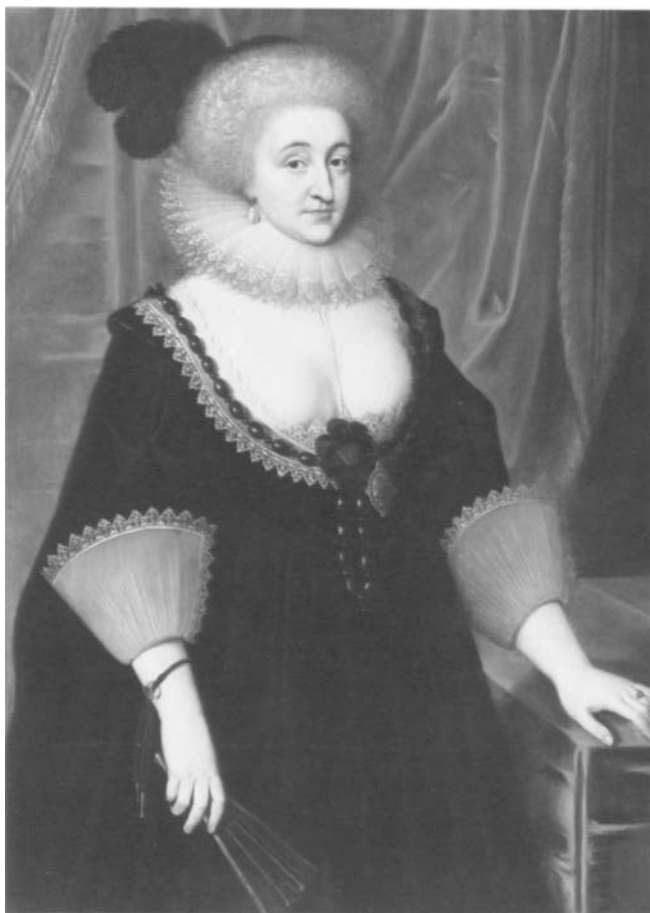
Figure 48 Paul van Somer. Elizabeth Talbot, Countess of Kent (1581–1651) , circa 1618/20. Oil on panel, 114.3 × 82.6 cm (45 × 32½ in.). London, Tate Gallery (T.G.T. 00398).

the queen [FIGURE 9], dated 1617, represents her in a landscape rather than in the usual plain interior, dressed for the chase, accompanied by a black groom, horse and Italian greyhounds with a ribbon bearing the Italian legend, La mia grandezza dal eccelso ; the distance contains a view of the royal palace of Oatlands in Surrey, for which Inigo Jones had just completed a classical gateway. By alluding to Anne's taste for hunting and patronage of architecture as well as asserting the divine guidance with which she felt herself inspired, the portrait, which was more vigorously and assuredly painted than any previous work executed in England, gives a much more rounded image of the sitter. Less ambitious is the