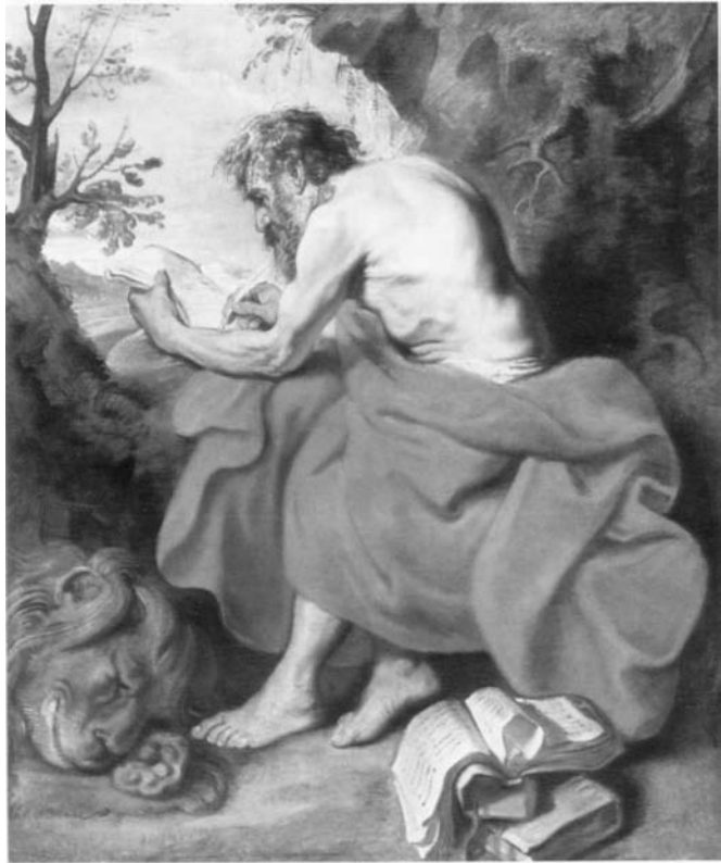
Figure 26 Anthony van Dyck, Saint Jerome , circa 1615. Oil on canvas, 157.5 × 131 cm (62 \frac{1}{2} × 52 in.). Vaduz, The Prince of Liechtenstein (56).

in an ample gray cloak with white lace collar loosely wrapped around the shoulders, was probably painted in the middle of the second decade, when the sitter was fifteen or sixteen. 48 And given that Rubens was only disposed to paint those close to him, its existence argues for more than casual acquaintance.