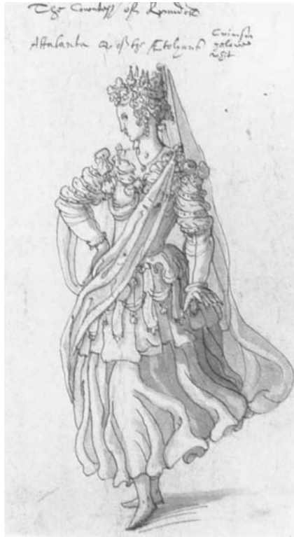
Figure 10 Inigo Jones (English, 1573–1652). Atalanta (Lady Arundel's costume for The Masque of Queens ), 1609. Pen and brown ink with gray wash, 27.7 × 15.4 cm (10 7/8 × 6 in.). Chatsworth, Devonshire Collection.

tures—religious, mythological, still-life, and topographical—which decorated her London residence, Somerset House, situated next door to Arundel House in the Strand, as well as her palaces at Greenwich and Oatlands. She was reported by Lord Salisbury, a member of the queen's circle, who was courted and advised in artistic matters by the young Arundel, to have preferred pictures to people, and according to George Abbot, the Archbishop of Canterbury, on the day before she died she visited her gallery to look at her pictures. She regarded Arundel with favor and as a token of her esteem she offered to become godmother to the Arundel's son and heir. 8