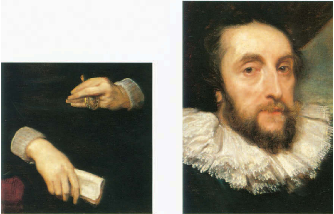
Figures 2 and 3 Anthony van Dyck. Thomas Howard, The Earl of Arundel (details of Figure 1).

jestical and grave, his Visage long, his Eyes large, black and piercing; he had a hooked Nose, and some Warts or Moles on his Cheeks: his Countenance was brown, his Hair thin both on his Head and Beard; he was of stately Presence and Gate, so that any Man that saw him, though in ever so ordinary Habit, could not but conclude him to be a great Person, his Garb and Fashion drawing more Observation than did the rich Apparel of others; so that it was a common Saying of the late Earl of Carlisle, Here comes the Earl of Arundel in his plain Stuff and trunk Hose, and his Beard in his Teeth, that looks more a Noble man than any of us.” 2