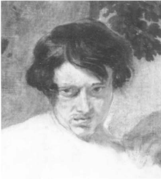
Figure 32 Anthony van Dyck. The Martyrdom of Saint Sebastian (detail), circa 1615. Oil on canvas, 144 × 117 cm (56 7/8 × 46 in.). Paris, Musée du Louvre (M.I.918).