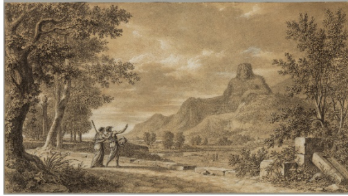
Mount Athos Carved as a Monument to Alexander the Great , 1799-1800 Pierre-Henri de Valenciennes (French, 1750-1819) Black and white chalk on beige paper 27 × 48 cm (10 5/8 × 18 7/8 in.) Getty Museum 2021.23