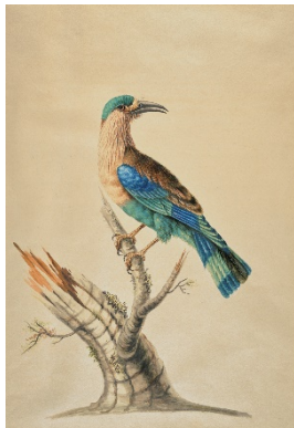
Indian Roller (Coracias benghalensis) , 1788