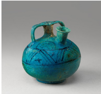
Miniature Stirrup Jar , Egyptian, 1550-1295 B.C.