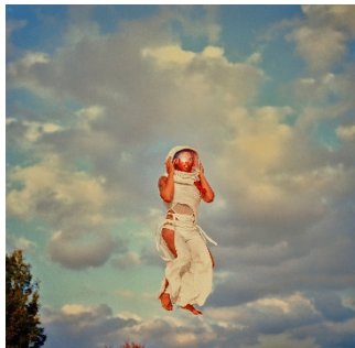
Summer Azure , 2020