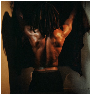
Enduring , 2019 John Edmonds (American, born 1989) Pigment print 77.5 × 77.5 cm (30 1/2 × 30 1/2 in.) Getty Museum, In memory of George Floyd with our commitment to continue the fight for justice and racial equality, May 25, 2020, a gift from members of the Photographs Council. © John Edmonds 2020.91