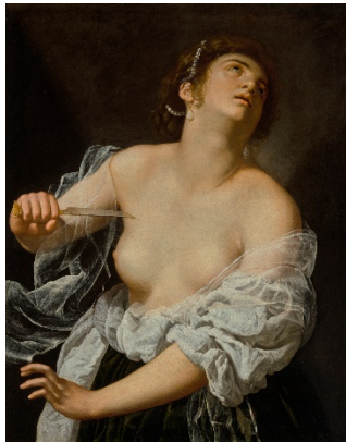
Lucretia , about 1627 Artemisia Gentileschi (Italian, 1593 - after 1654) Oil on canvas 92.9 × 72.7 cm (36 9/16 × 28 5/8 in.) Getty Museum 2021.14