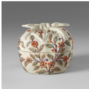
Box , 1730-1740

Saint-Cloud Porcelain Manufactory (French, about 1693-1766)