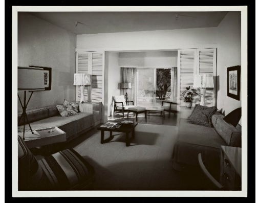
22. El Mirador Hotel, Palm Springs, Paul. R. Williams architect, Built 1952-53