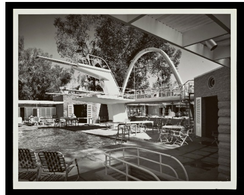
20. El Mirador Hotel, Palm Springs, Paul. R. Williams architect, Built 1952-53, 1953, Gelatin Silver Print, Getty Research Institute, Los Angeles (2004.R.10)