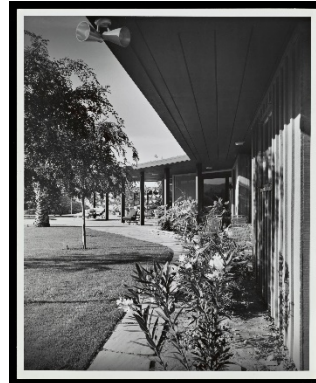
16. Lucille Ball and Desi Arnaz House, Palm Springs, Paul R. Williams architect, Built 1954-55, Gelatin Silver Print