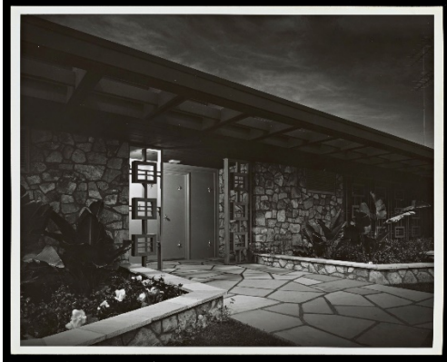
13. Lucille Ball and Desi Arnaz House, Palm Springs, Paul R. Williams architect, Built 1954-55