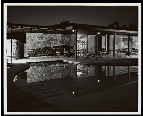
15. Lucille Ball and Desi Arnaz House, Palm Springs, Paul R. Williams architect, Built 1954-55