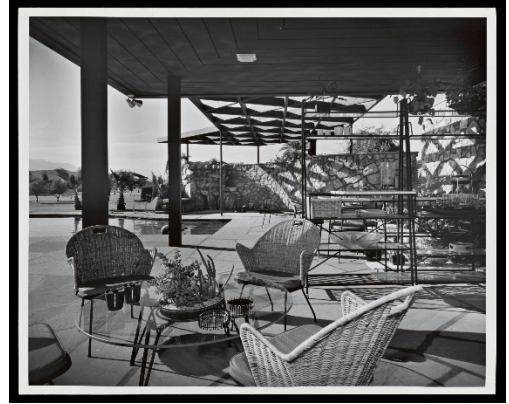
14. Lucille Ball and Desi Arnaz House, Palm Springs, Paul R. Williams architect, Built 1954-55