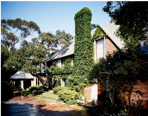
11. Nellie Hirsch House, 10800 Ambazac Way, Bel Air, Paul R. Williams architect, Built 1933-34, 1982, Chromogenic print