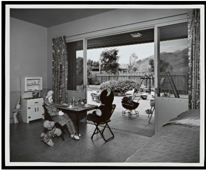
17. Lucille Ball and Desi Arnaz House, Palm Springs, Paul R. Williams architect, Built 1954-55, Gelatin Silver Print