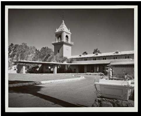
19. El Mirador Hotel, Palm Springs, Paul. R. Williams architect, Built 1952-53, Gelatin Silver Print