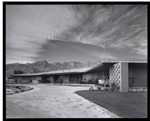
12. Lucille Ball and Desi Arnaz House, Palm Springs, Paul R. Williams architect, Built 1954-55, Gelatin Silver Print