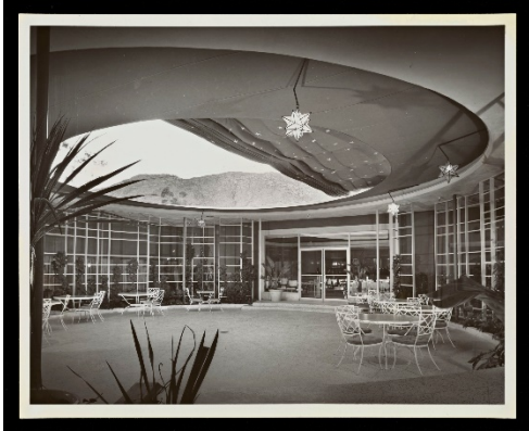
21. El Mirador Hotel, Palm Springs, Paul. R. Williams architect, Built 1952-53, Gelatin Silver Print