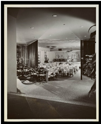
23. El Mirador Hotel, Palm Springs, Paul. R. Williams architect, Built 1952-53