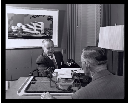
1. Portrait of Paul R. Williams, 1952, Gelatin Silver Print