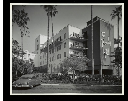
18. Beverly Hills Hotel Addition, Beverly Hills, Paul R. Williams architect, Built 1949-50, Gelatin Silver Print