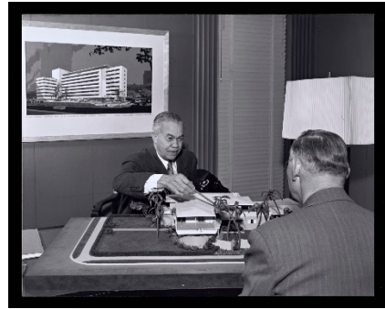
2. Portrait of Paul R. Williams