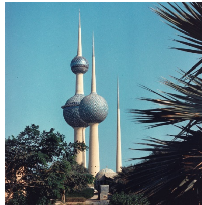
4. Abraj Al-Kuwait (Kuwait Towers).