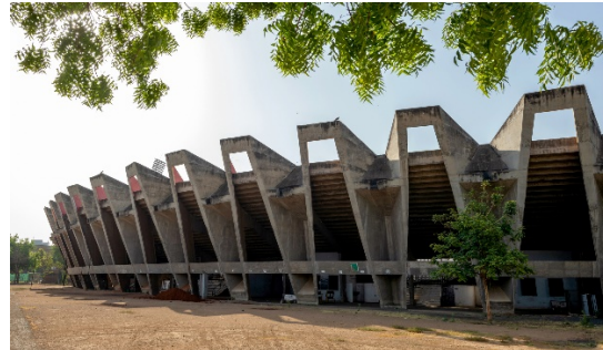
8. Sardar Vallabhbhai Patel Stadium.