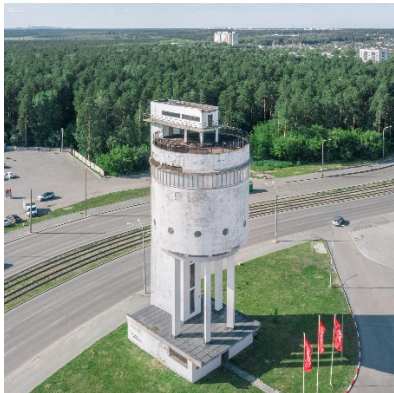
7. The White Tower.