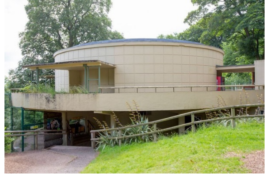
10. View of the Tropical Bird House located at Dudley Zoo and Castle.