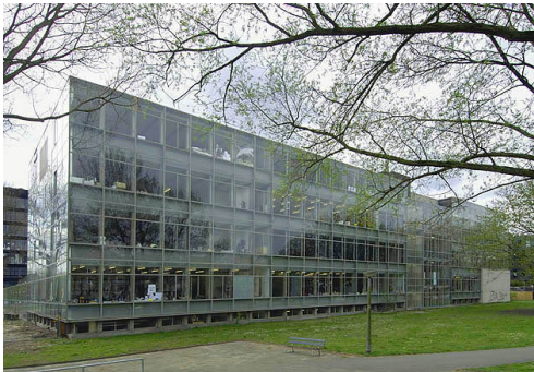
1. Rietveld Academie © Amsterdam Municipal Department for the Preservation and Restoration of Historic Buildings and Sites (bMA)