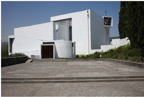
5. Benedictine Monastery Chapel.