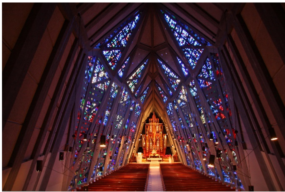
11. First Presbyterian Church of Stamford.