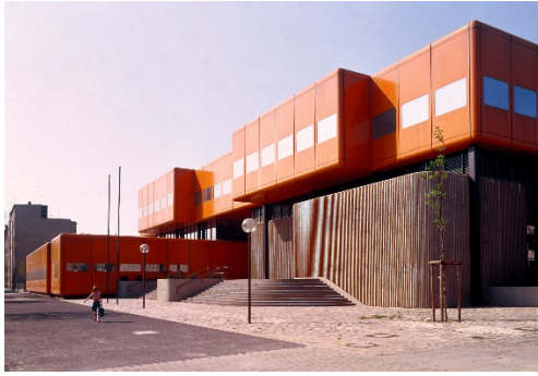
9. Oberstufen-Schulzentrum Wedding, Berlin. © Sammlung für Architektur und Ingenieurbau der TU Braunschweig, Pysall, Stahrenberg und Partner PSP