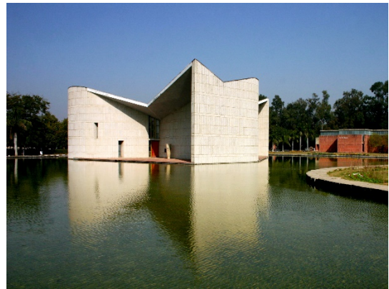
12. Gandhi Bhawan with Museum of Fine Arts in the background.