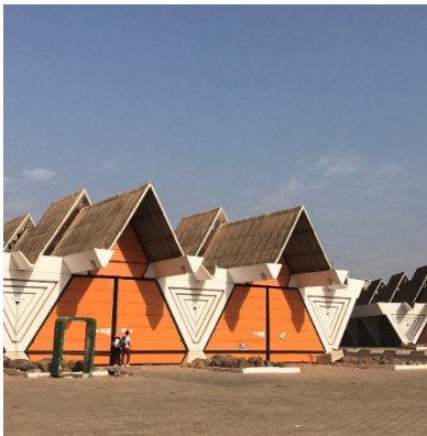
3. Orange exhibition hall at Centre International du Commerce Extérieur de Dakar.