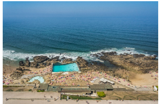
2. Swimming Pools in Leça.