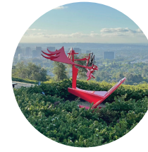
15 Lower Terrace Sculpture Garden