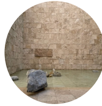
8 Museum Courtyard, Fountain C