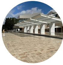
1 Tram and Arrival Plaza

Discover 25 photogenic locations at the Getty Center and make your own memories!