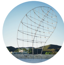
2 Martin Puryear Sculpture