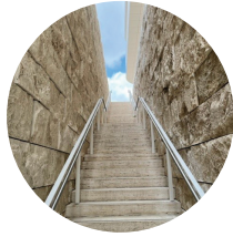
16 Central Garden, Upper Fountain and Stairwell