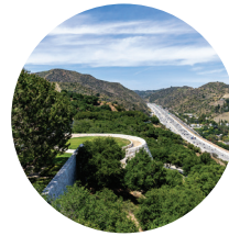
23 North Overlook