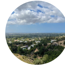
10 Terrace outside West Pavilion