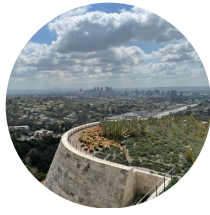
11 Cactus Garden