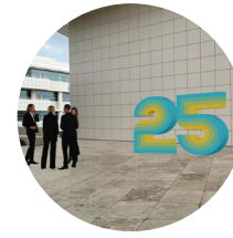
4 Front of Museum, Large Enamel Grid