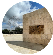
21 Travertine Title Stone