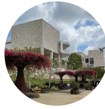
13 Central Garden