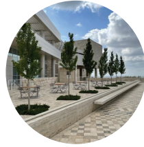
17 Ginkgo Trees