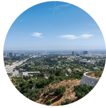
9 South Terrace