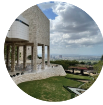
12 Museum Garden Terrace Cafe