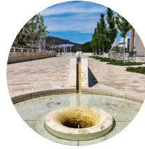
18 Runnel Fountain