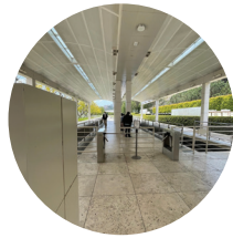
24 Lower Tram Station