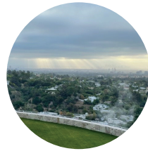
22 Plaza Level, overlooking Los Angeles