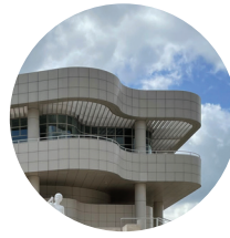
3 "Piano Curve"