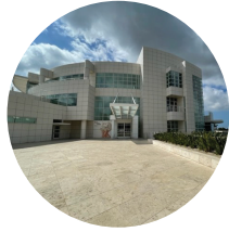
19 Getty Research Institute