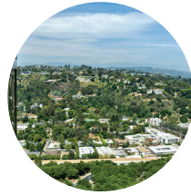
7 Museum 2nd Floor, between North and East Pavilions