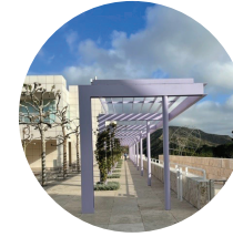
20 Lavender Trellis