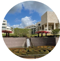
14 Central Garden, Lower Bowl