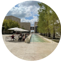
6 Museum Courtyard