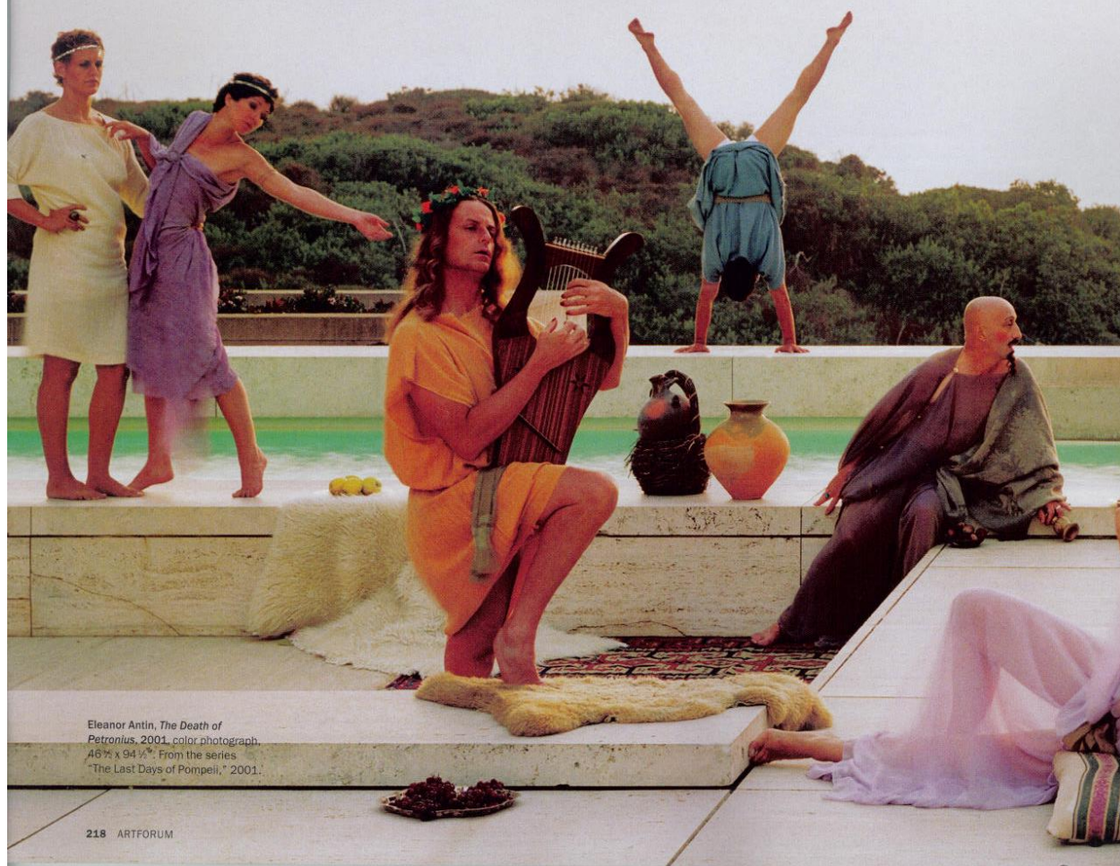
Eleanor Antin, The Death of Petronius , 2001, color photograph, 46 1/2 x 94 1/2". From the series "The Last Days of Pompeii," 2001.