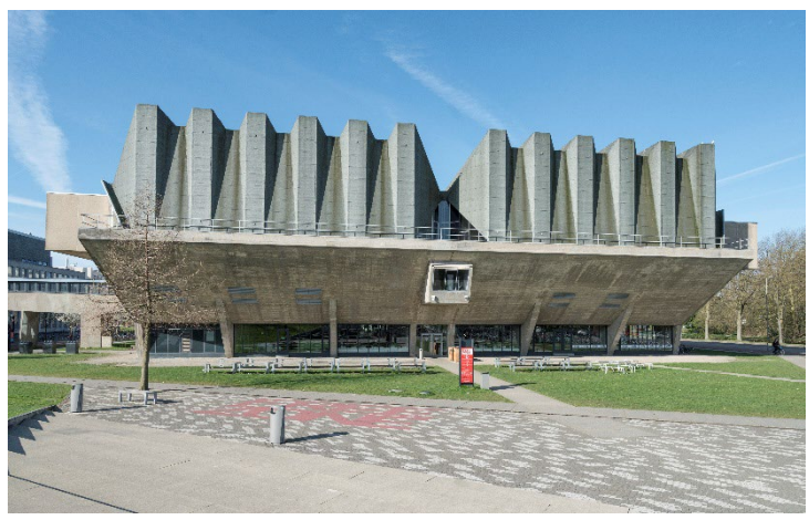
TU Delft Aula.

A paragon of Dutch modernism, the Auditorium of the Delft University of Technology (TU Delft) hovers like a buoyant spaceship. Prompting instant acclaim upon opening in 1966, the 1,300-seat lecture hall features gravity-defying pre-stressed concrete ribs and a soaring cantilevered roof that protrudes nearly 100 feet from the main entrance. Johannes van den Broek and Jaap Bakema, both alumni of TU Delft, designed the bold brutalist structure as an homage to the modern movement—architecture