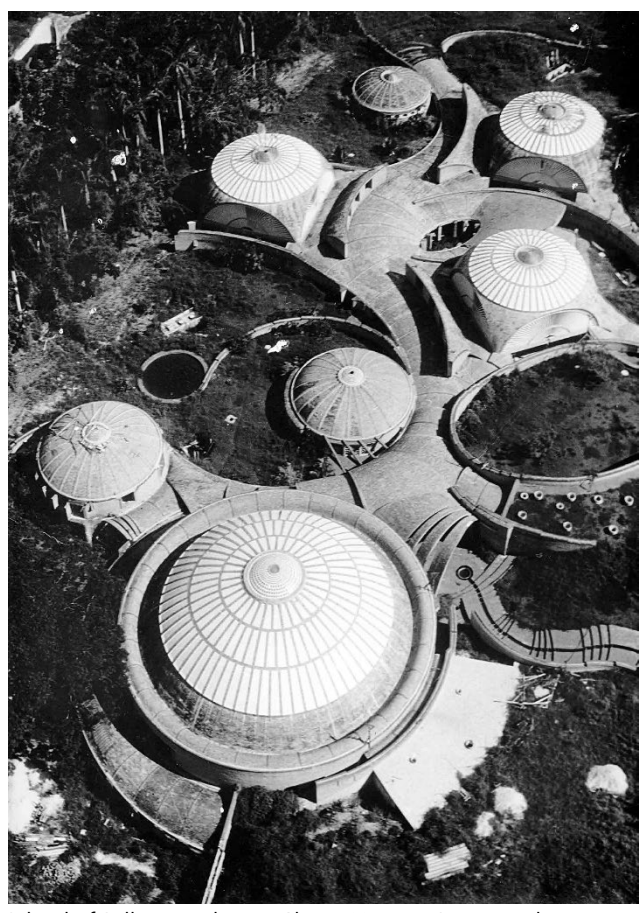
School of Ballet, aerial view.

Before the complex could be fully completed, however, the project fell out of political favor and was shut down. Although the National Schools were later placed on the World Monuments Watch List and designated a National Monument in Cuba, numerous organizations and government agencies—both local and international—attempted to resuscitate the project with only mixed results. With Getty support, experts at the Politecnico di Milano, one of the world's top technical universities for engineering, architecture, and design, will