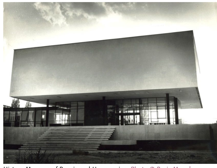
History Museum of Bosnia and Herzegovina.

When the Museum of the Revolution (now the History Museum of Bosnia and Herzegovina) opened in Sarajevo in 1963, it symbolized optimism in the future and the belief that Yugoslavia could chart a unique path between Soviet and Western domains of influence. Blending characteristics of the International Style with the experimental ethos of Russian Constructivism, the museum was immediately celebrated for its innovative architecture: slender steel columns are all that support an enormous, yet seemingly weightless, reinforced-concrete cube as it floats above a glass-