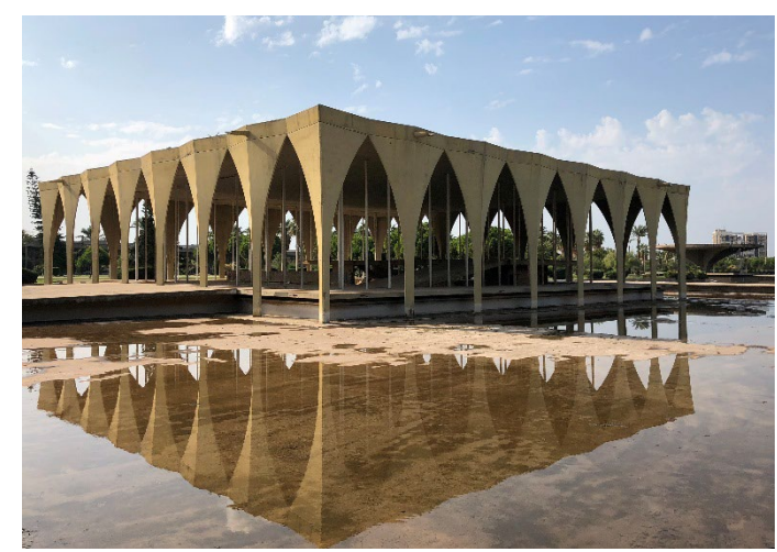
Oscar Niemeyer's Museum of Lebanon, Rashid Karami International Fair, Tripoli.

Lebanon in the 1960s was a hub of tourism and finance, moving into prominence on the world stage. In 1962, to mark the country's international status and rapid economic growth, the Lebanese government commissioned Oscar Niemeyer, one of the world's premier modernist architects, to design a permanent fairground and exhibition complex for the city of Tripoli. Unfortunately, the boldly modernist compound of exhibition pavilions, theaters, museums, and residences was only partially completed when