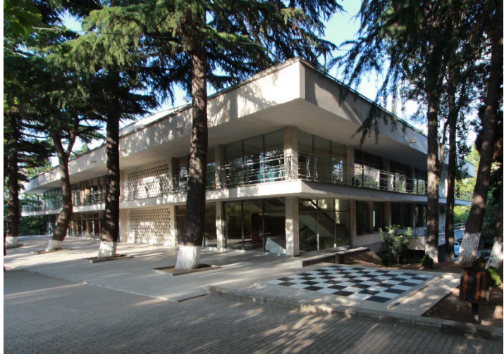
Tbilisi Chess Palace and Alpine Club, Façade, View from South-West.

Since its opening in 1973, the Tbilisi Chess Palace and Alpine Club has acted as a community hub in the heart of Georgia's capital city. Architects Vladimir Aleksi-Meskhishvili and Germane Gudushauri designed the building to exist in harmony with its park setting and to serve as an inviting center for chess and mountaineering, two of Georgia's most popular leisure activities. The site is a unique example of late Soviet Modernism, and its event halls host several chess-related events annually, including national and international tournaments.