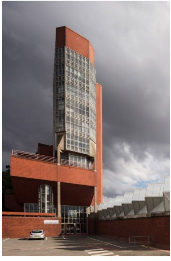
External view of the Engineering Building tower and workshops.

While Stirling and Gowan were forward-thinking in their designs, they could not have anticipated how the passage of time would affect their building's function and infrastructure. Today, engineering students require more technically sophisticated environments for research, and energy standards demand performance that the building's original materials cannot match. Research and planning