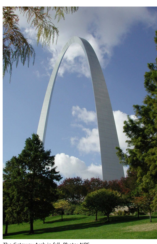
The Gateway Arch in fall.

Though Gateway Arch has welcomed well over 130 million visitors since opening, its stainless steel cladding has proven prone to soiling and wear over time. An interdisciplinary team of conservation specialists will partner with the National Park Service to research effective