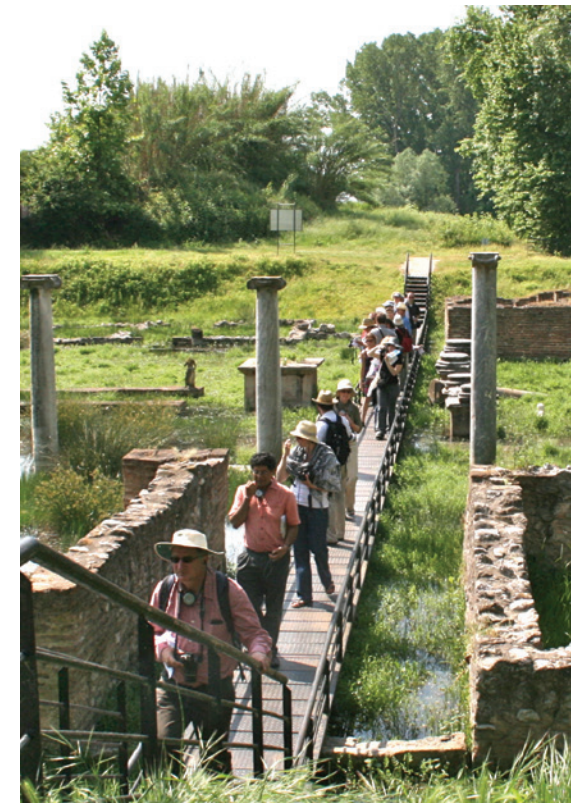
Left: The Arts of Rome's Provinces team crosses a marshy area at the site of Dion in northern Greece as part of an on-site tour.

The first Connecting Art Histories project to address the ancient world was a grant to Brown University for the research seminars The Arts of