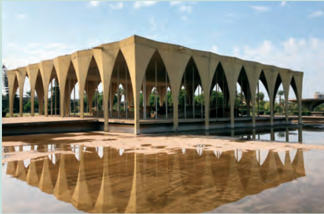
Rashid Karami International Fairground Oscar Niemeyer Tripoli, Lebanon 1975