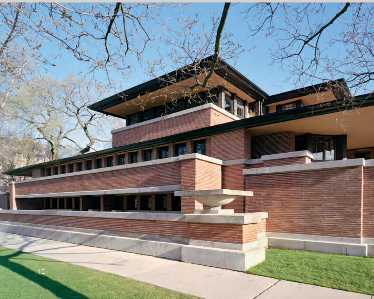
Frederick C. Robie House Frank Lloyd Wright Chicago, Illinois 1910

The Foundation expects to offer Keeping It Modern architectural conservation grants through 2020. Although Keeping It Modern is a fully global initiative, the Foundation particularly encourages applications from Latin America, Eastern Europe, and the Far East.