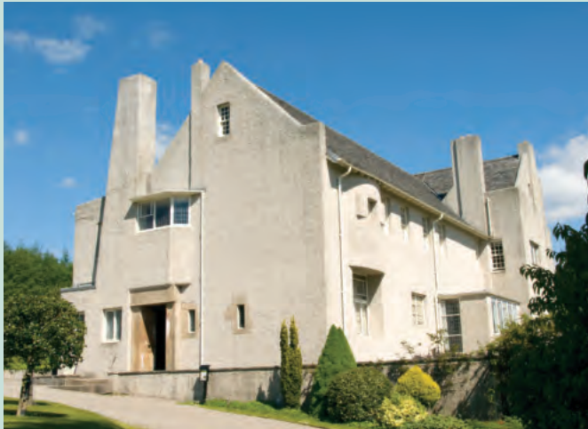
Hill House Charles Rennie Mackintosh Helensburgh, Scotland 1904