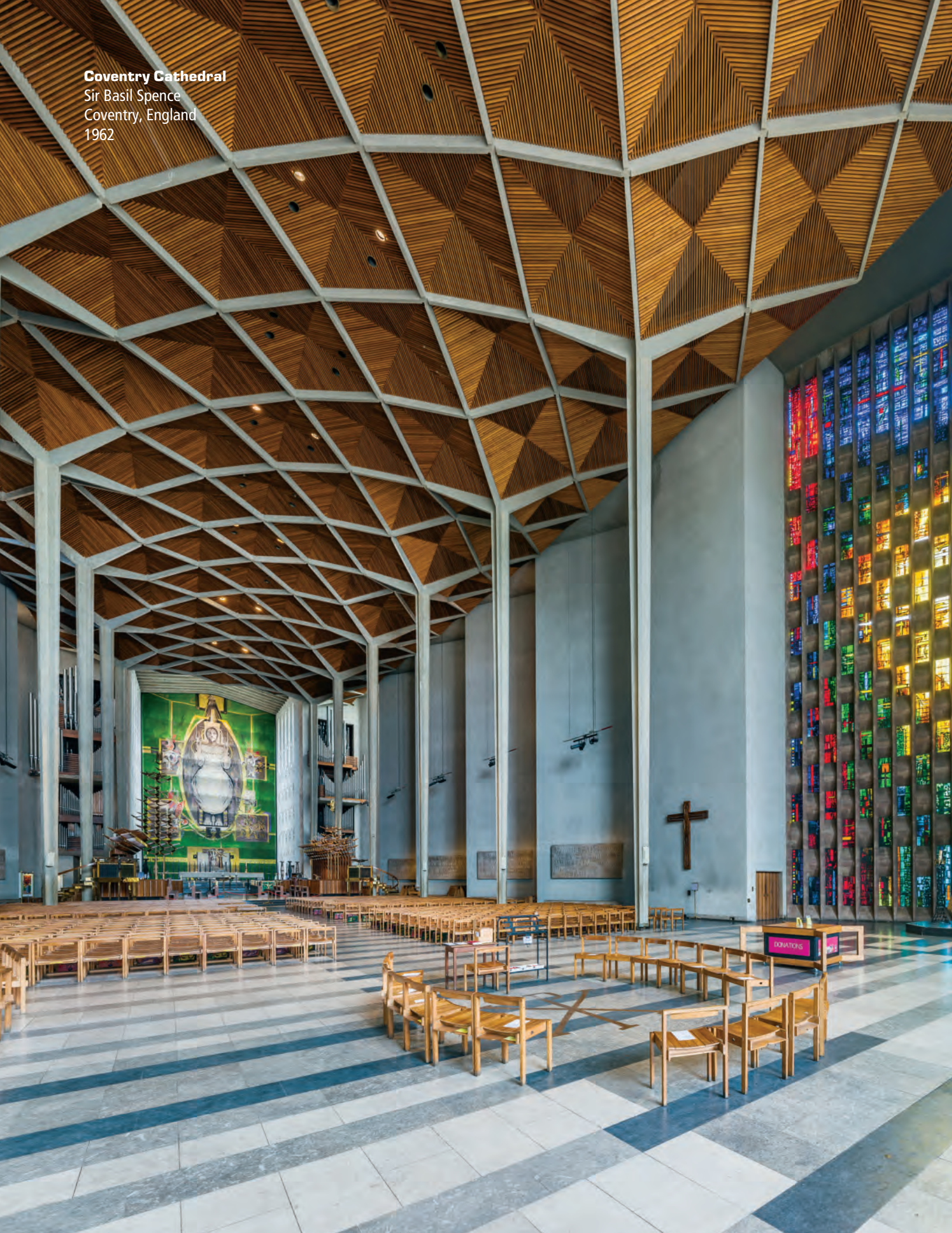
Coventry Cathedral Sir Basil Spence Coventry, England 1962