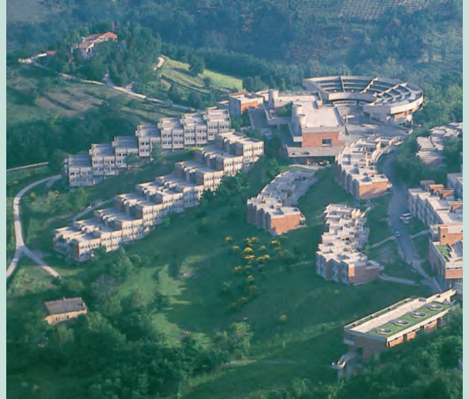
Università degli Studi di Urbino Carlo Bo, "Collegi" Buildings Giancarlo de Carlo Urbino, Italy 1982