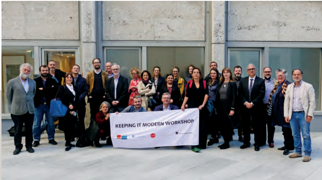
Attendees of the 2018 Keeping It Modern Workshop hosted by the Twentieth Century Society.