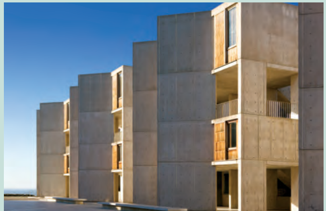
Salk Institute for Biological Studies Louis Kahn La Jolla, California 1965