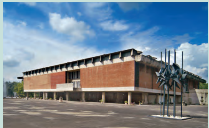
Government Museum and Art Gallery Le Corbusier Chandigarh, India 1968