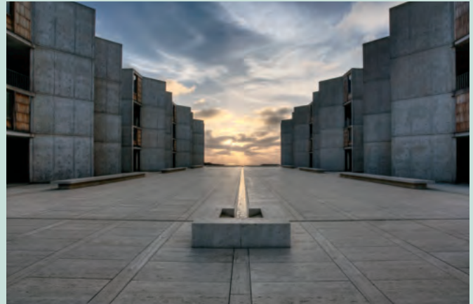
Salk Institute for Biological Studies