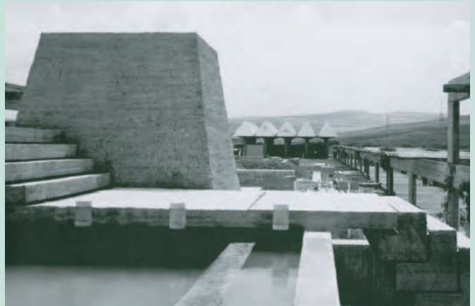
Sidi Harazem Thermal Bath Complex Jean-François Zevaco Sidi Harazem, Morocco 1958