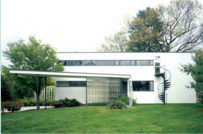
Gropius House Walter Gropius Lincoln, Massachusetts 1938