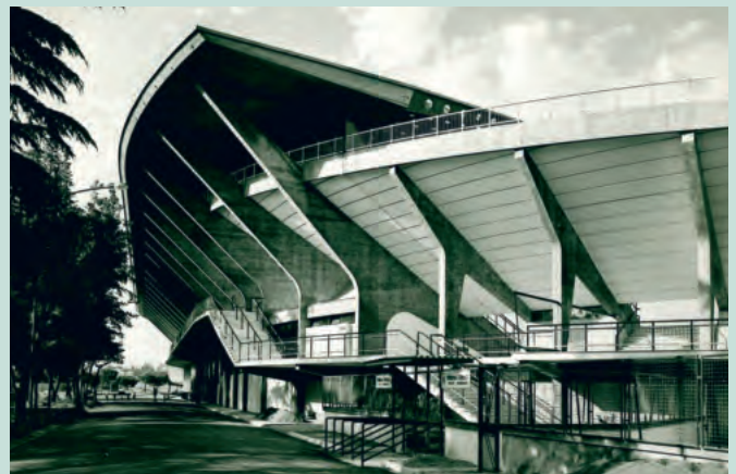
Stadio Flaminio Università degli Studi di Roma "La Sapienza" Pier Luigi Nervi Rome, Italy 1960