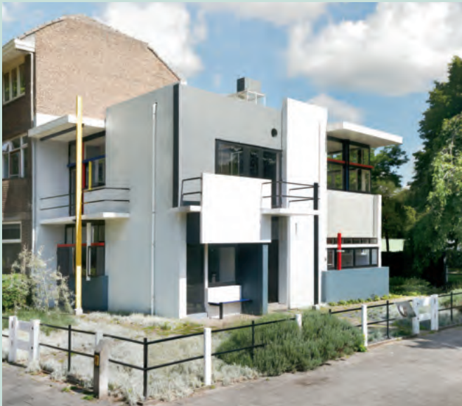
Rietveld Schröder House Gerrit Rietveld Utrecht, The Netherlands 1924