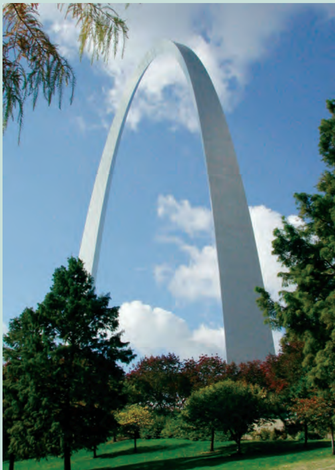
Gateway Arch Eero Saarinen St. Louis, Missouri 1965