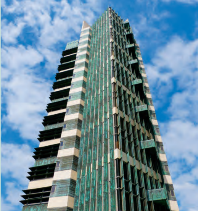
Price Tower Frank Lloyd Wright Bartlesville, Oklahoma 1956