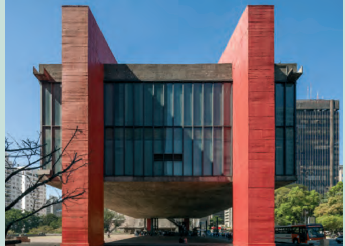
Museu de Arte de São Paulo Assis Chateaubriand Lina Bo Bardi São Paulo, Brazil 1968