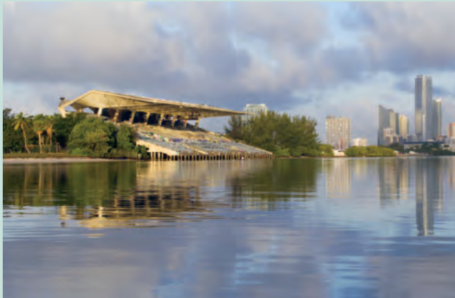
Miami Marine Stadium