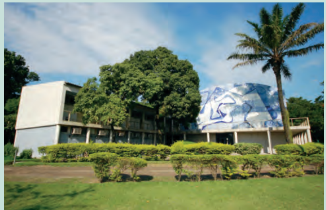
Arthur Neiva Pavilion Oswaldo Cruz Foundation Rio de Janeiro, Brazil 1951