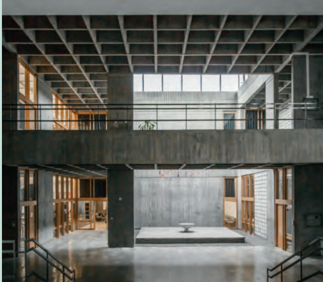
Faculty of Architecture Building Middle East Technical University Altuğ and Behruz Çinici Ankara, Turkey 1963