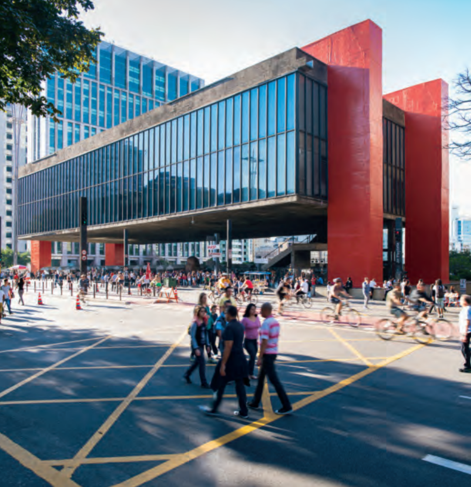
Museu de Arte de São Paulo Assis Chateaubriand Lina Bo Bardi São Paulo, Brazil 1968