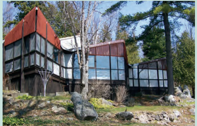
Strutt House James Strutt National Capital Area, Canada 1956