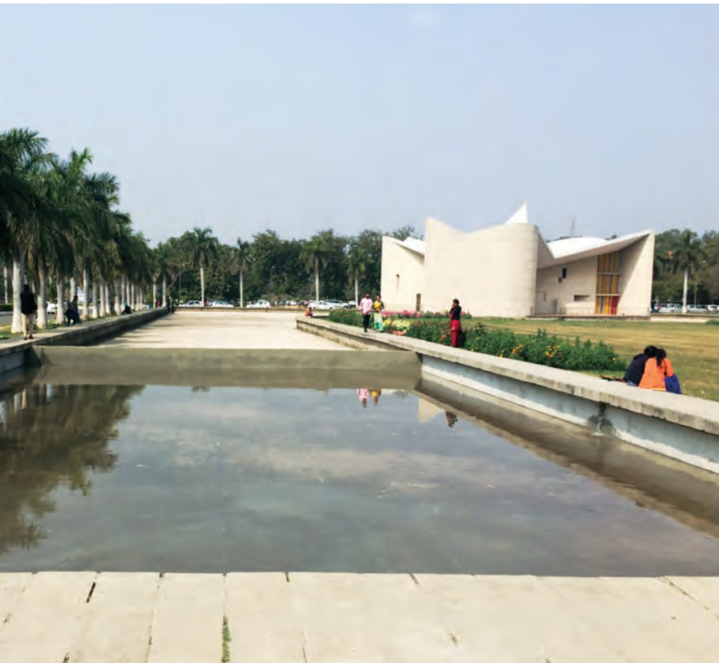
Gandhi Bhawan Panjab University Pierre Jeanneret Chandigarh, India 1961

I was also fortunate to take the helm on the development of a conservation management plan for the Government Museum and Art Gallery, Chandigarh, which received a Keeping It Modern grant in 2017. We're currently studying and analyzing the structure's context and climate to derive a planning model that encourages conservation of the building materials, internal environment, and exterior landscape, including aspects of passive control and preventive conservation. An interesting aspect of this plan is that the Getty Conservation Institute is undertaking a parallel, supporting study of Le Corbusier's three Museums of Unlimited Growth, of which Chandigarh is one, the other two being in Ahmedabad, India and Tokyo, Japan. The study involves environmental monitoring with the aim of developing a sustainable indoor museum climate control system.