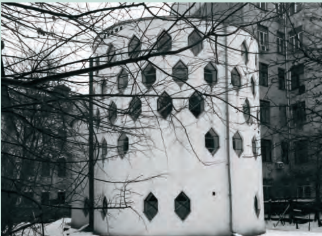
Melnikov House Konstantin Melnikov Moscow, Russia 1929