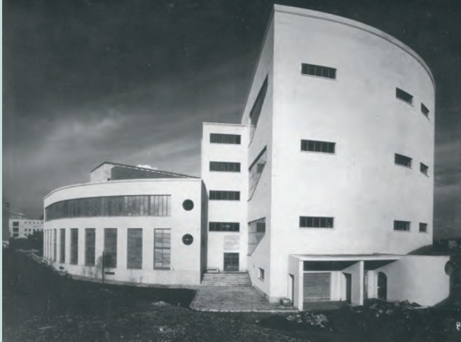
School of Mathematics Università degli Studi di Roma "La Sapienza" Gio Ponti Rome, Italy 1935