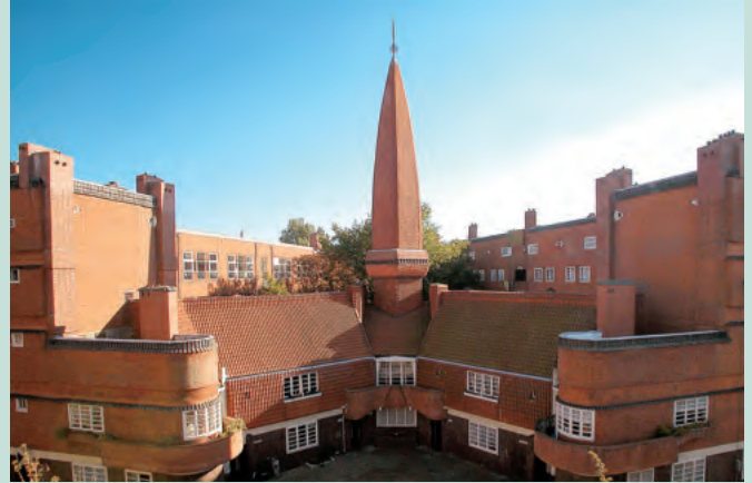
Het Schip Michel de Klerk Amsterdam, The Netherlands 1920