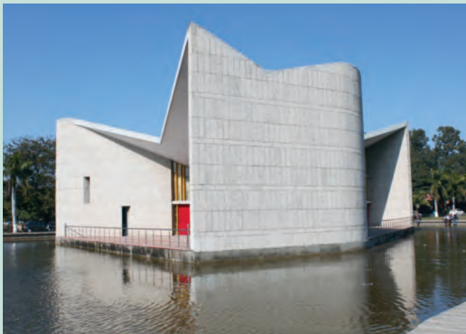
Gandhi Bhawan Panjab University Pierre Jeanneret Chandigarh, India 1961