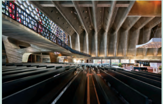
Saint John's Abbey and University Church College of Saint Benedict and Saint John's University Marcel Breuer Collegeville, Minnesota 1961