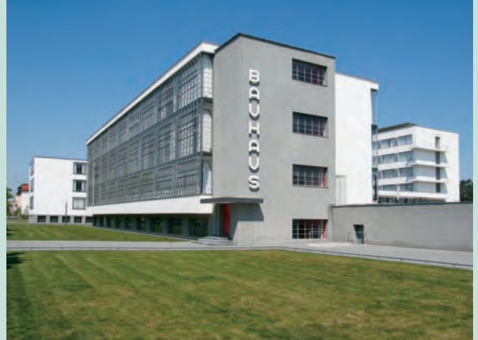
Bauhaus Building Walter Gropius Dessau, Germany 1925