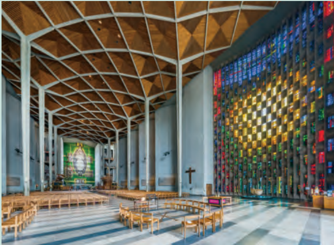
Coventry Cathedral Sir Basil Spence Coventry, England 1962