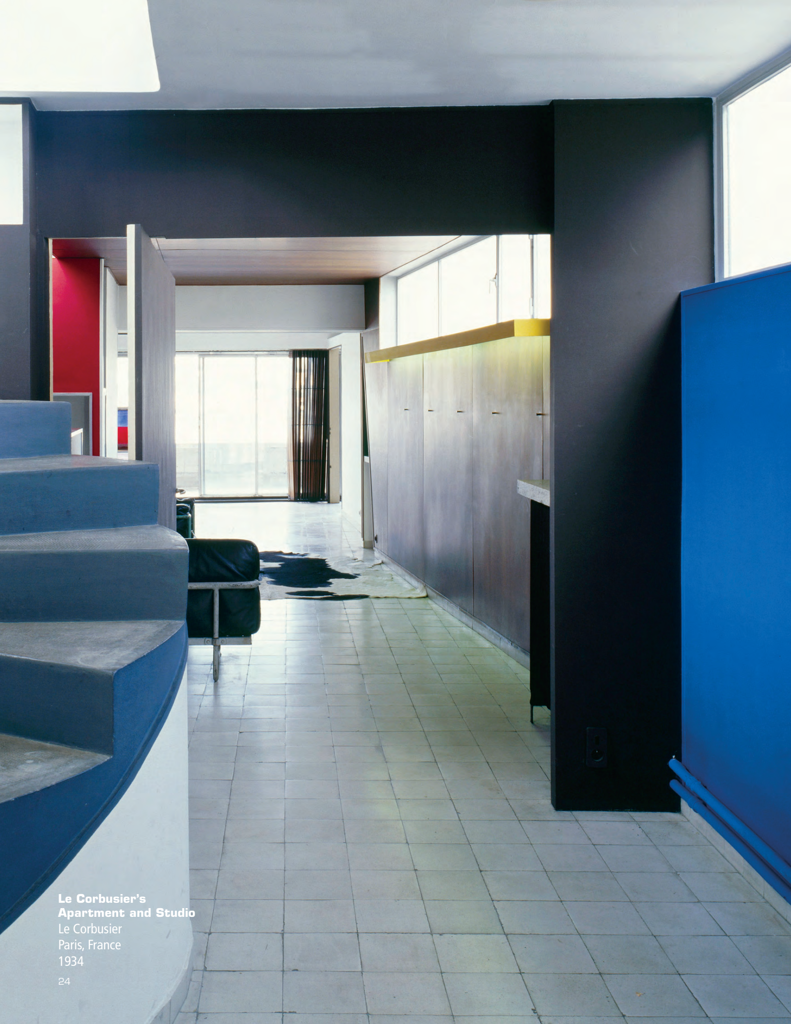
Le Corbusier's Apartment and Studio Le Corbusier Paris, France 1934