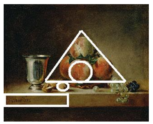
Still Life with Peaches, a Silver Goblet, Grapes, and Walnuts, Jean-Siméon Chardin, about 1760

3. Display the reproduction of Still Life with Peaches, a Silver Goblet, Grapes, and Walnuts. Inform students that they are looking at a still life painting by the French artist Jean-Siméon Chardin. Tell students that a still life is a work of art that has a grouping of natural objects (e.g., flowers, vegetables, or fruits) and man-made objects (e.g., a table or cup). Guide students to point out the shapes that are present in the painting. (See the diagram below. The Chardin painting has circles [peaches and grapes], ovals [walnuts], rectangles [the ledge], and a triangle [the stacked peaches].)