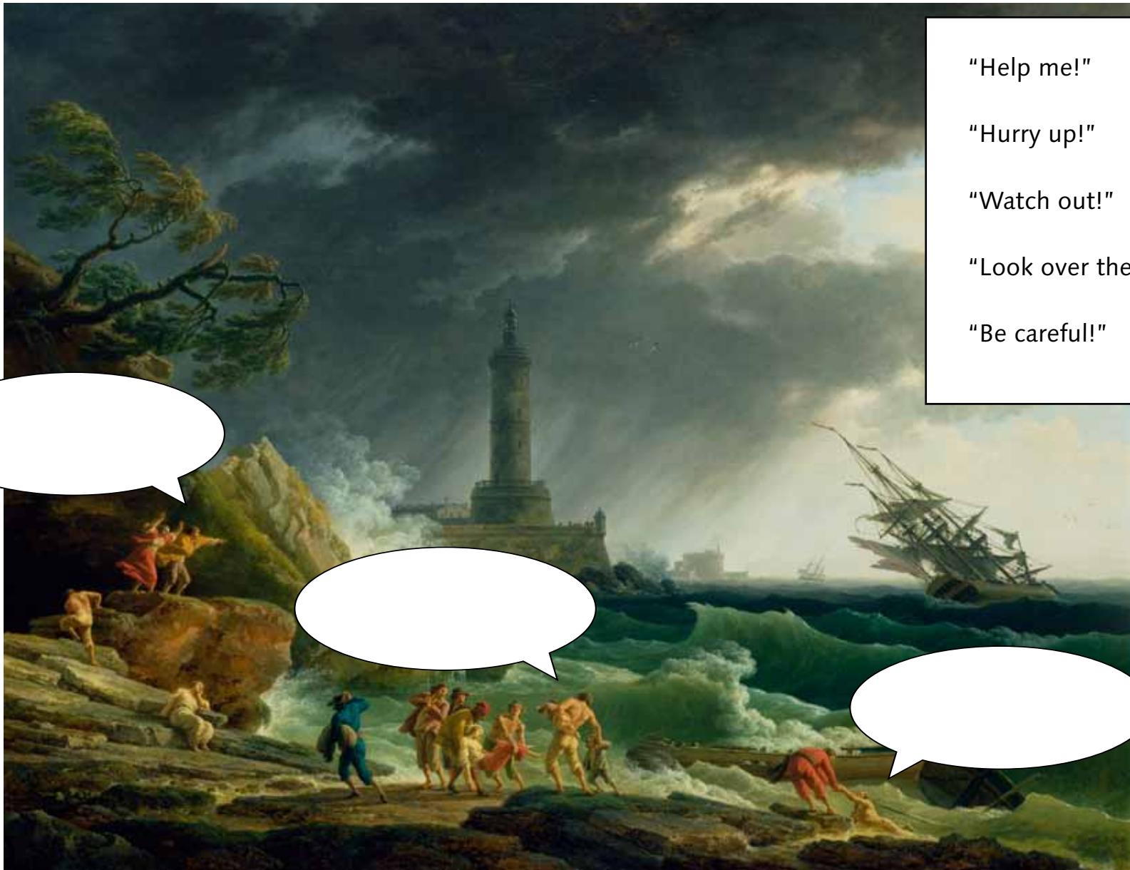
A Storm on a Mediterranean Coast by Claude-Joseph Vernet