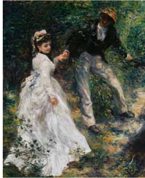
La Promenade by Pierre-Auguste Renoir

Looking closely at each work of art, complete the sentences about what each person is wearing.