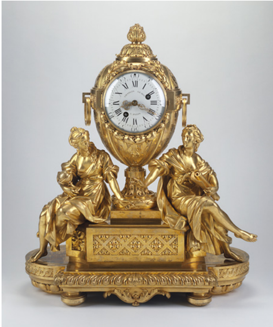
Clock movement by Étienne-Augustin Le Roy (French, 1737–1792, master 1758), and case by Etienne Martincourt (French, died after 1791, master 1762) Mantel Clock, about 1772 The J. Paul Getty Museum, Los Angeles

Learning about the principles of design? Begin by noticing balance in works of art. Balance is about the position of objects, colors, texture, and space. When elements on one side are similar to those on the other, the artwork is balanced and symmetrical. When both sides are different from one another, the artwork is balanced and asymmetrical. Look at the mantel clock below. Outline the elements that are balanced.