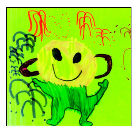
Pre-Visit: Green Monster drawn by a 6-year-old visitor