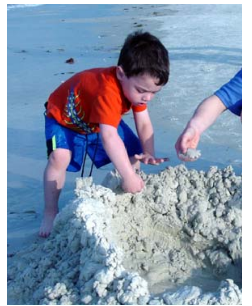
Boy playing with sand

What follows are some approaches that we have found to be central to the process of creating rich social experiences within art museums. These dimensions are important to cultivate active family engagement, repeat visitation, and the habit of lifelong learning.