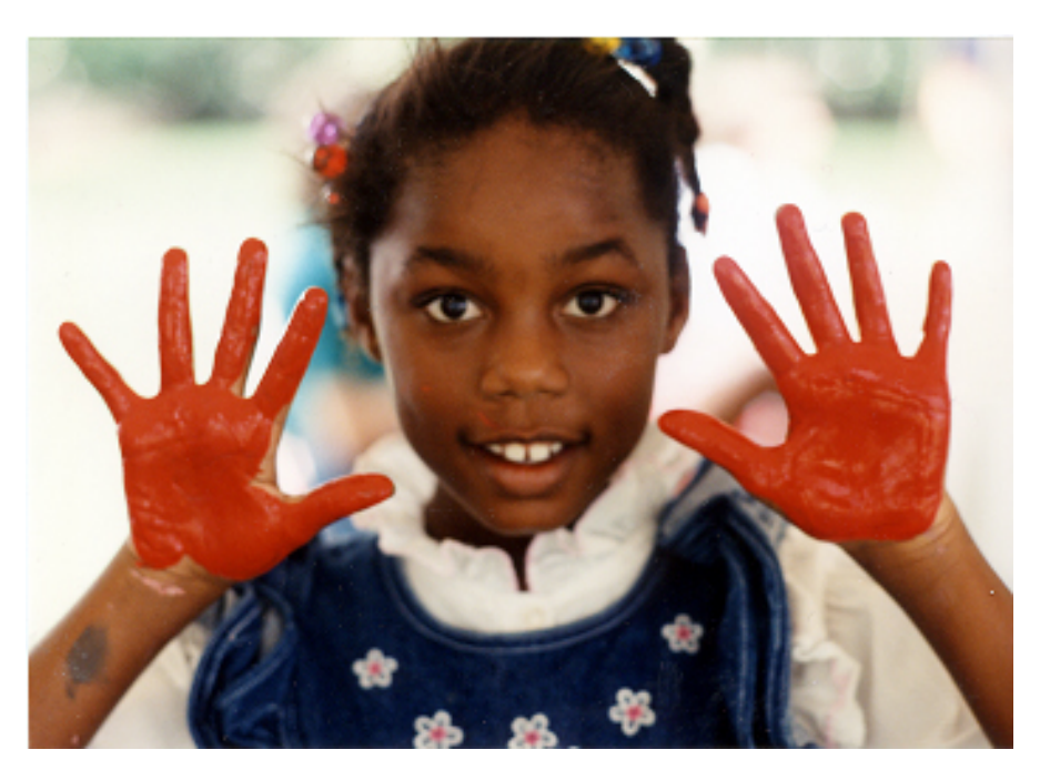
Girl with red paint

Cynthia Moreno , Curator of Education, Speed Art Museum Beverly Dywan , Exhibit designer, Design in Three Dimensions