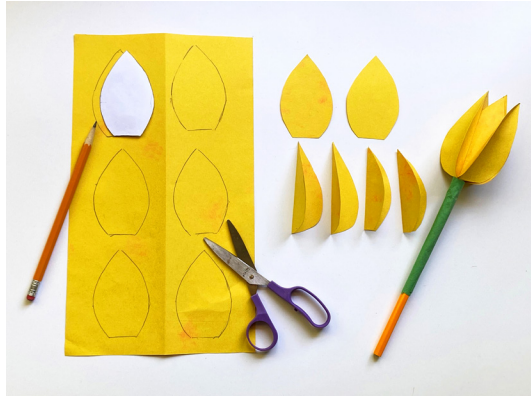
Draw, cut, and fold tulip petals