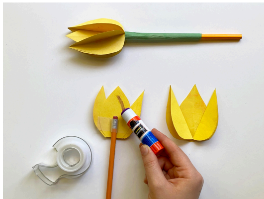
Glue front and back sides together