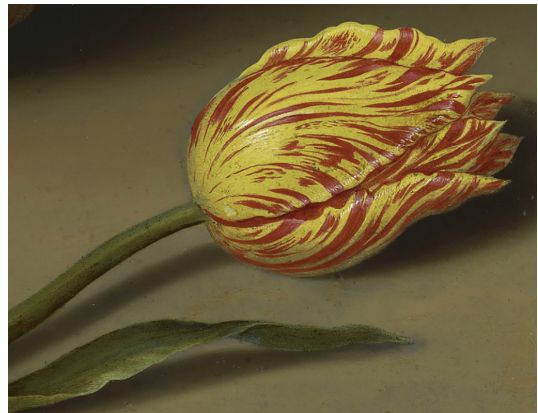
Flower Still Life (detail) , Ambrosius Bosschaert the Elder, 1614.