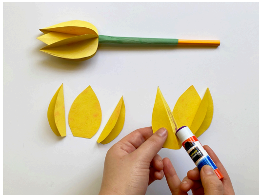
Glue folded petals onto flat petals