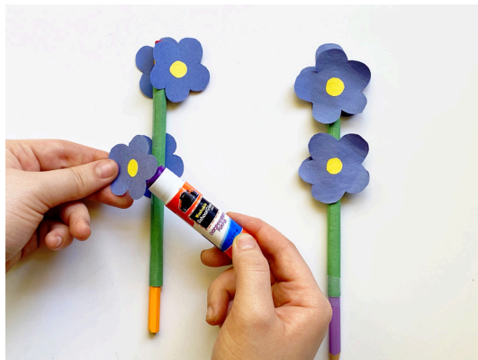
Glue flowers to upper half of pencil

Forget-me-nots are typically blue and have five petals.