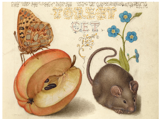
Queen of Spain Fritillary, Apple, Mouse, and Creeping Forget-Me-Not (detail), Joris Hoefnagel and Georg Bocskay. 1561–1562; illumination added 1591–1596.

Enjoy your completed Forget-Me-Not flower!