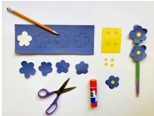
Draw, cut, and glue Forget-Me-Not flower shapes