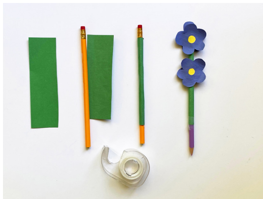
Cut, wrap, and tape stem to pencil