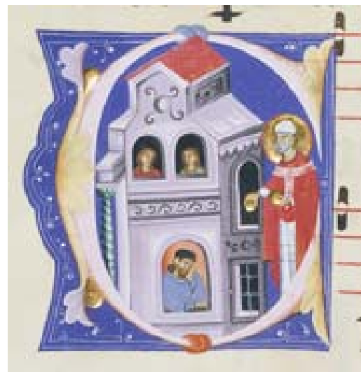
This image is from a page in a book and depicts Saint Nicholas inside of an initial C. It was painted in the late 1200s by an Italian artist known as the Master of Gerona.