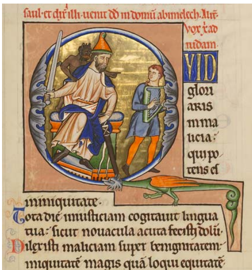
This image is from a page in a book and depicts David Before Saul inside of an initial Q. It was painted after 1205 by a French artist known as the Master of the Ingeborg Psalter.

Check out these examples of some other letters.