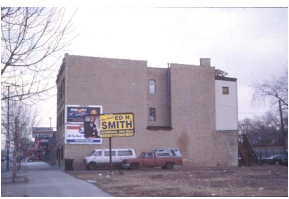
Figure 4 The same wall seen in Figure 3, in 2003.