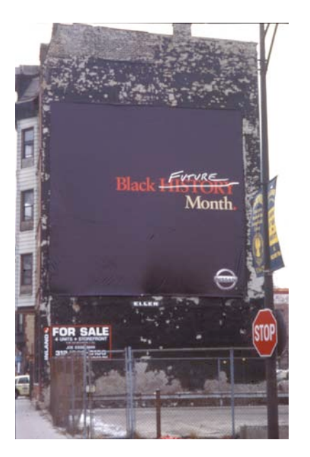
Figure 2 The same wall seen in Figure 1, in 2003; mural destroyed, replaced by advertisement.