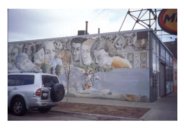
Figure 5 John Pitman Weber, Together Protect the Community , 1976; shown in degraded condition in spring 2003. Approx. 16 x 100 ft. Fullerton and Washtenaw avenues, Chicago. Reproduced courtesy of the artist. Photo : John Pitman Weber.

All of the community murals, like any other public art, whether abstract or figurative, assert moral claims to public space, claims concerning the history, identity, and possible future of the surrounding area. Developers may prefer a blank slate, without the cultural or thematic specificities of the existing art. Thus, art may become an important symbolic element in struggles over public space, a point of contention and a rallying point. My 1976 mural Together Protect the Community (known as Tilt ) was a locus of contention for several years between residents, the Chicago Park District, and a town house developer (Figures 5–7).