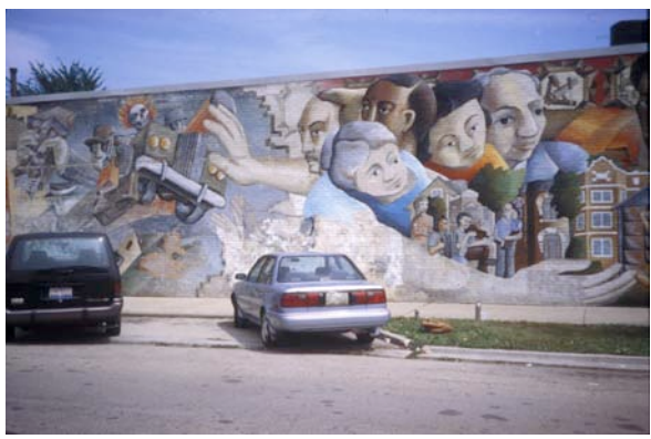
Figure 6 Together Protect the Community in restoration, August 2003.