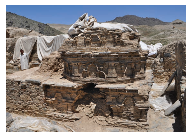
Mes Aynak in Logar Province, Afghanistan, once an important Buddhist Silk Road settlement. Large-scale copper mining planned for the area now threatens the site. Whether the archaeology, potentially a major tourist attraction if and when the region stabilizes, can be protected and managed while allowing mining to take place is a matter of current debate.

archaeological site or landscape will be multiple and often in tension. Recognition of the need to sustain values and not simply fabric has serious implications for conservation, raising issues about the universality of conservation principles and the need to manage change. The impact of a values-based approach is reflected in a number of influential publications regarding archaeological site management.