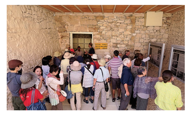
Tourists gathering at the entrance to the tomb.

interventions on the paintings, such as dusting. The installation of a filtered air supply and exhaust ventilation system in 2015 and the implementation of recommendations to limit visitor numbers will help control humidity and carbon dioxide levels, as well as mitigate dust intrusion. These measures will lessen the need for dusting, thus helping reduce risk of damage to the paintings.