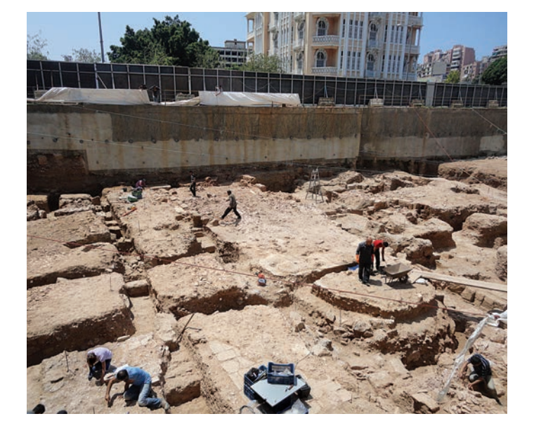
Beirut, Lebanon. Archaeological rescue excavations have taken place in Beirut as part of the massive reconstruction after the civil war. The quality and scale of the archaeology has been extensive. Excavations by a team led by Fady Beayno are documenting this material before it is lost, but urban pressures mean that little is preserved in situ, and the display of what remains has been largely limited.

and unmanned aerial vehicles are radically changing our ability to rapidly and accurately document archaeological site condition and site setting. These data provide a platform for conservation decision-making, monitoring, and interpretative strategies. The cost of equipment and software has dropped dramatically within the last decade, making photographic point-cloud data generation in particular a lowcost and easily implemented strategy for many archaeological sites and landscapes. High dynamic range and infrared imagery are also offering new methods for documentation and site detection. Rendered models and, increasingly, augmented and virtual reality have the poten-