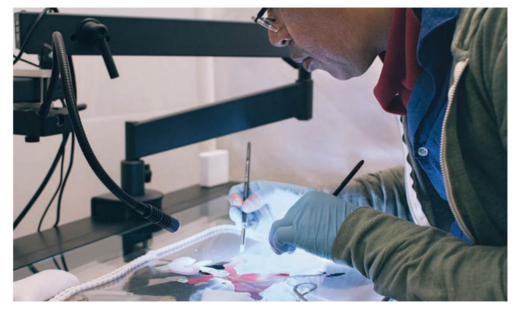
A conservator relaying paint from an animation cel during the workshop at the Disney Animation Research Library in December 2017.

In February 2018 staff from the Getty Conservation Institute (GCI) and representatives from three Le Corbusier-designed museums the Government Museum and Art Gallery in Chandigarh, India, the National Museum of Western Art in Tokyo, and the Sanskar Kendra museum in Ahmedabad, India—met in Ahmedabad for a five-day workshop.