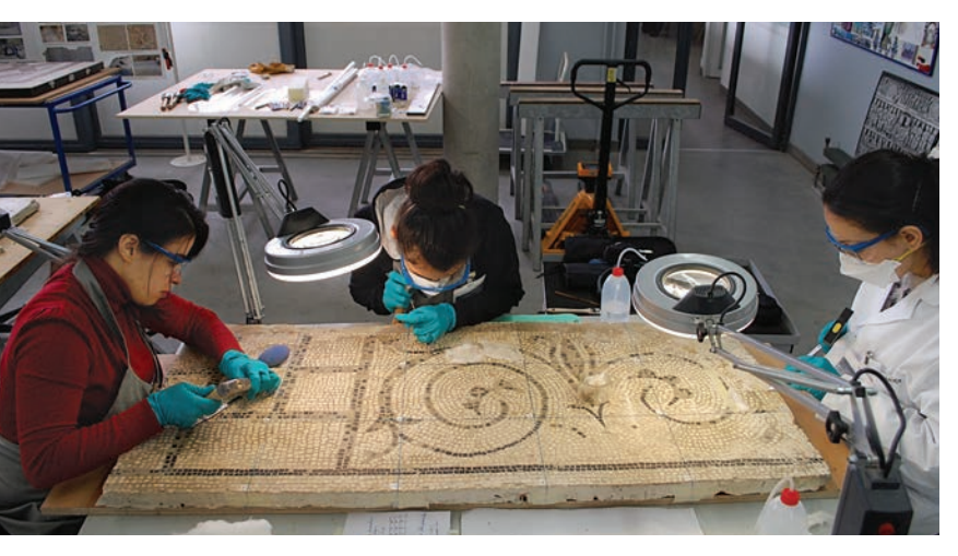
Students removing modern cement joints between tesserae as part of the MOSAIKON course, Training of Technicians in Preventive Conservation and Conservation Restoration, held at the Musée départemental Arles antique in France.

mosaics. It is hoped that some of the more promising methods to emerge from the research will be tested in the field.