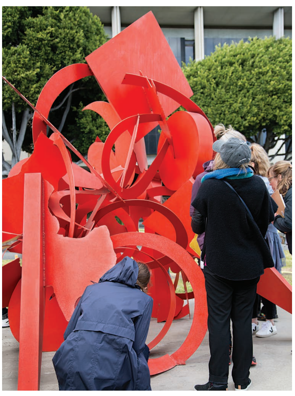
Outdoor Painted Sculpture workshop participants on a field trip to look at sculptures in the collection of the City of Beverly Hills. Artwork: Sisyphus by Alexander Liberman, © Liberman Art Partners, 2018.

Conservators, even those specializing in sculpture, modern and contemporary art, or both, often lack knowledge of the paint industry and therefore have to learn on the job about the durability of paint systems, their application properties, and the surface preparation required. This deficiency can sometimes lead to costly mistakes. The workshop aimed to address this knowledge gap and to provide conservators with a palette of conceptual and