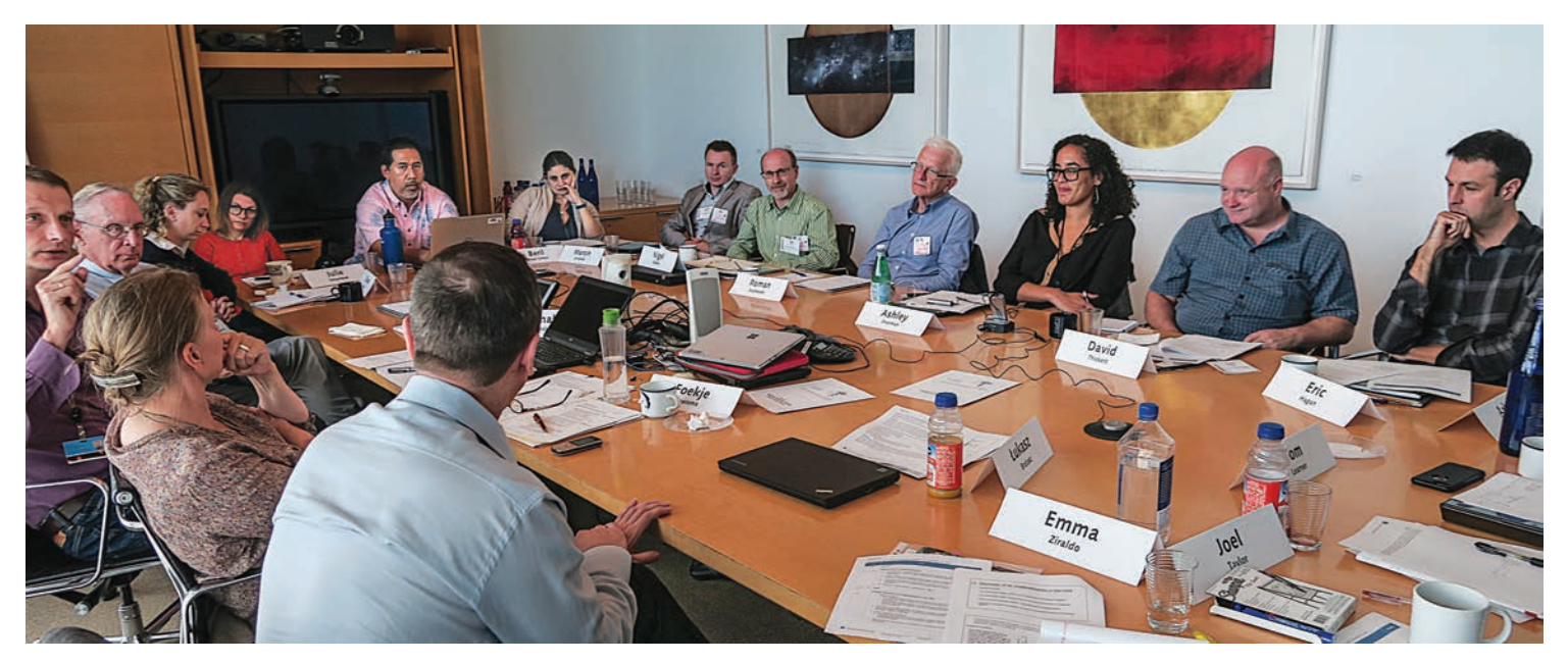
At the November 2017 GCI-organized meeting, experts in acoustic emission and end users discuss implementation of the technique.

a location that is perceived to be vulnerable (e.g., crack tip); and the sensitivity of AE to brittle cracking but not to deformation, which can also be considered damage.