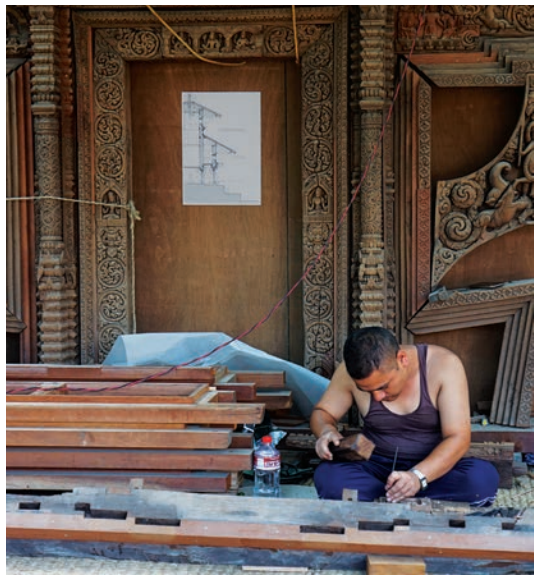
Left: Post–earthquake reconstruction in Bhaktapur, Nepal. Good documentation provides a platform for reconstruction, ensuring that the sense of place, and its economic and social value for the local community, can be recovered. Above: A positive outcome of the Nepalese earthquake has been the revitalization of traditional crafts. In Patan, craftspeople are being trained in traditional wood carving to replace thousands of damaged pieces.

Action Program at the Doha Institute—formulated nine critical lessons for a holistic approach to postwar reconstruction, high-lighting the need for a clear vision of future recovery scenarios as seen by local groups, as much as by external players.<sup>7</sup> If Aleppo, for example, is once again to become a destination for international visitors and resurrect this vital part of its economy, it must place sustainable heritage conservation at the heart of a strategic vision.