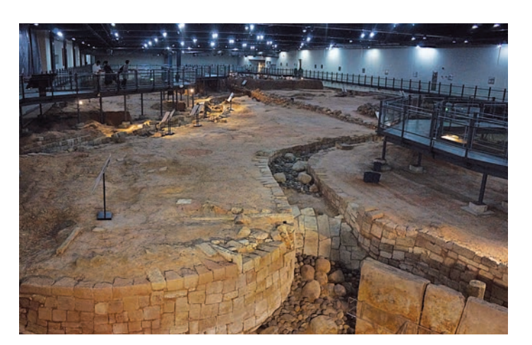
The well-preserved remains of the palatial gardens of the Nanyue Kingdom Palace gardens in Guangzhou, China. Here an extensive shelter provides a context for displaying and interpreting the formal gardens.

The global economic crisis of 2008 exposed the fragility of resourcing for sites, museums, and heritage protection. Such economic considerations are often a veil for political ideologies advocating the disengagement of