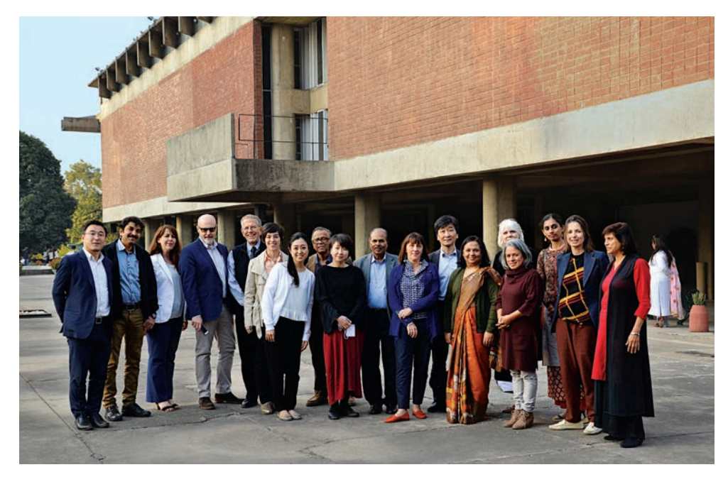
Participants in the Three Museums by Le Corbusier workshop gather outside the Chandigarh Museum.

The Disney Animation Research Library is the world's largest archive of animation art, housing approximately sixty-five million pieces of animation art created over more than eighty years by the Walt Disney Animation Studios. The research on Disney animation cels is part of the GCI's Preservation of Plastics project, which studies a wide range of plastics to understand how to prevent or slow degradation, estimate risks, establish suitable approaches to preservation, and design appropriate conservation treatments.