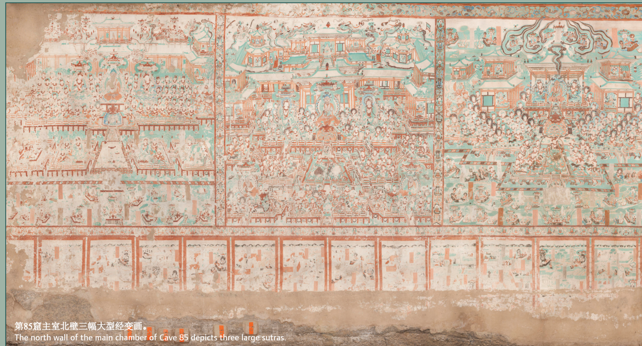
第85窟主室北壁三幅大型经变画。 The north wall of the main chamber of Cave 85 depicts three large sutras.

Cave 85 is decorated with 350 square meters of wall painting. The main scheme of painting dates from the construction of the cave during the Late Tang dynasty (848-907 CE). There are two later periods of localized redecoration from the Five Dynasties (907-979) and the Yuan dynasty (1279-1368). A sculpture group on a large altar platform also dates from the Late Tang but was extensively restored in the early 20th century.