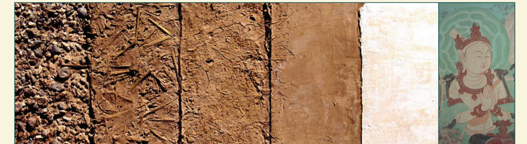
莫高窟壁画层位。 The layers of the Mogao wall painting.