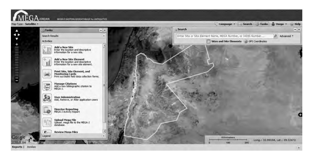
Figure 4. The MEGA-Jordan Web user interface.

ownership parcels in selected areas of Jordan. Compliance with the OGC standards ensures that the system is compatible with, for instance, other desktop GIS applications, common Web browsers, and Google<sup>™</sup> imagery. It may also utilize other types of basemap data, including georeferenced satellite imagery, aerial photography, topographic maps, or vector map data, if they become available. The MEGA software code is also thoroughly documented so that the DoA, the SBAH, and others who adopt the system in the future may readily maintain, upgrade, and adapt it.