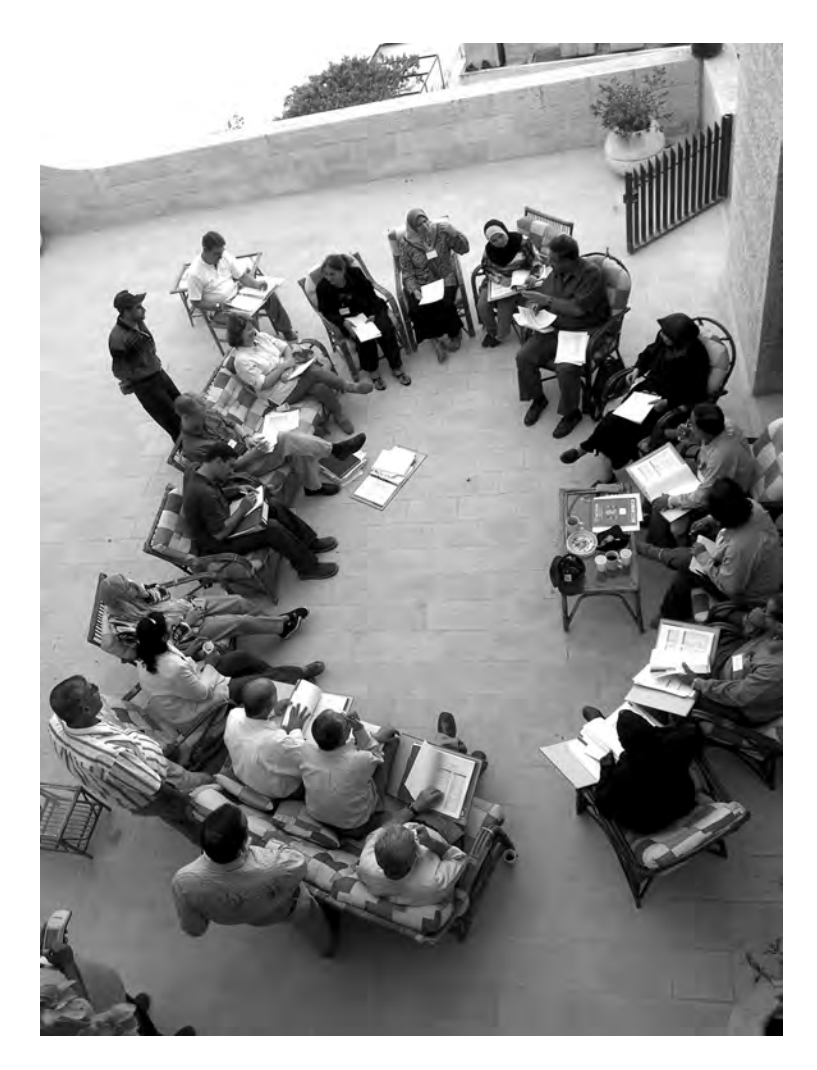
Figure 10. Gathering requirements for inventorying historic buildings with Iraq SBAH personnel in 2005.

such as historic buildings and structures, architectural ensembles, and cultural landscapes and routes. Groundwork for this task was also laid during initial work on an Iraq GIS.