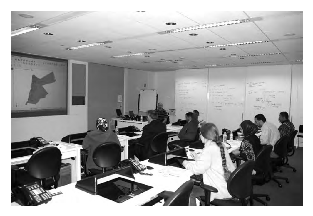
Figure 9. Department of Antiquities trainers being trained in the use of QuantumGIS for advanced use of MEGA-Jordan.

Jordan site and monitoring cards. Follow-up training was provided in Jordan to the same group of DoA trainers in July 2010.