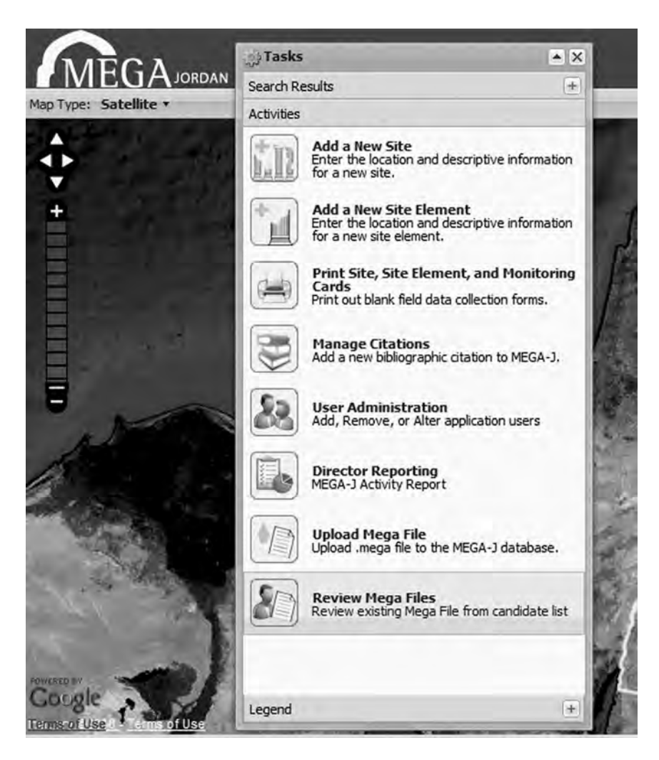
Figure 5. The user interface task bar, which allows for adding sites and site elements, printing monitoring cards, managing bibliographic citations, user administration, producing activity reports, and uploading and reviewing MEGA files.

which is in turn essential to establishing priorities for decision making for heritage planning, conservation, and management.