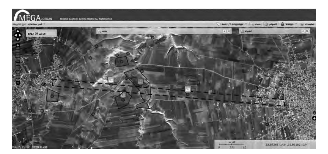
Figure 7. This screenshot depicts a user-defined polygon search (represented by the dashed rectangle) for sites in the area of a simulated construction project. Sites falling within the search polygon, and that would thus be impacted, are highlighted with icons. (2010 Google, Map Data © 2010 Digital Globe)

Figure 6. The MEGA-Jordan Web user interface showing system data for a particular monitoring event, as well as a site's recorded boundary, buffer zone, and recorded site elements. ( Data shown are fictitious and for illustration only. ) (2010 Google, Map Data © 2010 Digital Globe)