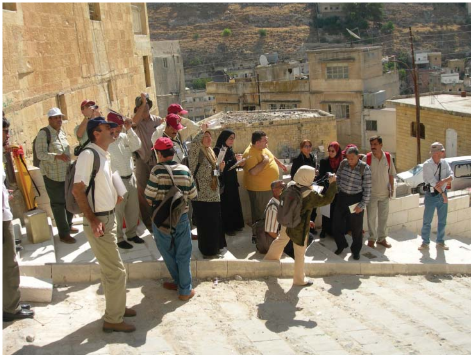
FIGURE 4 Recording historic architecture in Salt, Jordan.

The SBAH is committing significant human resources to this programme, which improves the chance of its long-term impact. Twenty-seven staff from the SBAH have participated in training courses, with most attending multiple activities as the Initiative's focus is on in-depth training. The staff represents all professional categories at SBAH: surveyors, architects, engineers, archaeologists, including those employed in functions ranging from data entry and archiving to surveying and mapping. It also has included directors of provincial offices and participants from all regions of the country, including Kurdistan. It is difficult to predict whether this is enough to ensure the sustainability of our training activities. In the present situation, one might think that this training was premature. We believe, however, there was an immediate need