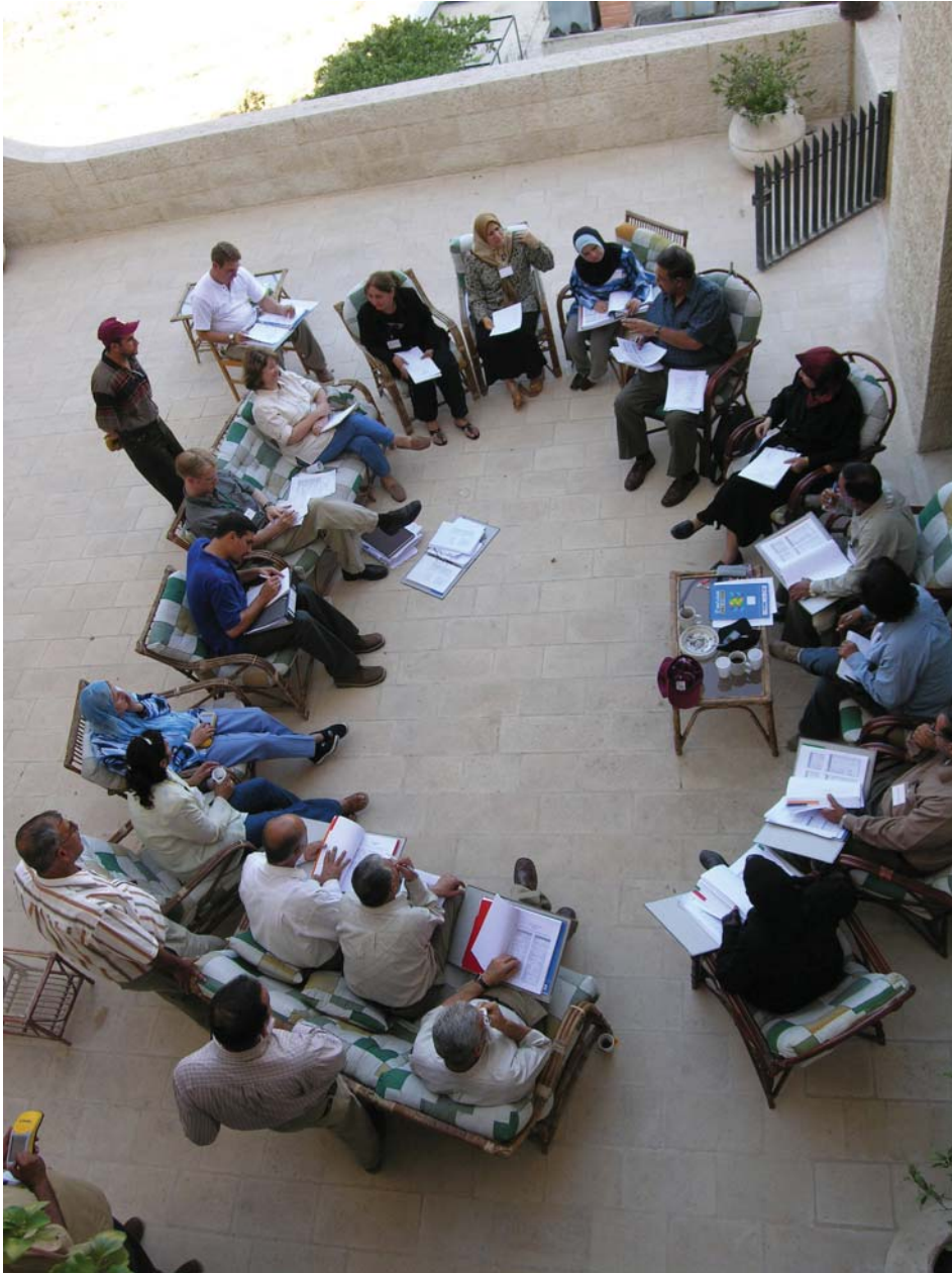
FIGURE 1 One of the meetings to develop site recording forms (photograph by Rand Eppich). © J. Paul Getty Trust / World Monuments Fund