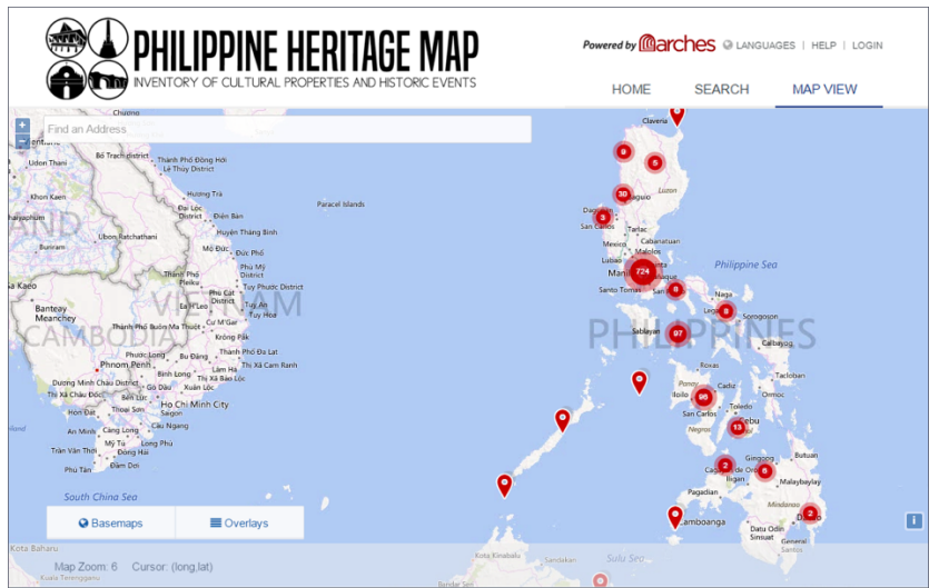
Figure 2: Screenshot of the Philippine Heritage Map (Microsoft Bing API data reprinted with permission).