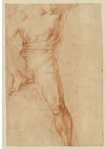
9. Pontormo (Jacopo Carucci) Italian (Florentine), 1494 - 1557 Seated Figure , 1520 Red chalk 29.4 × 20 cm (11 9/16 × 7 7/8 in.) The J. Paul Getty Museum, Los Angeles 90.GB.34