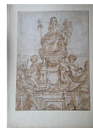
28. Unknown maker, Roman School An Allegory of Industry , Late 1500s Pen and brown ink and wash over black chalk, squared in black chalk Unframed: 38.5 × 28.5 cm (15 3/16 × 11 1/4 in.) Private collection, Los Angeles L.2018.12