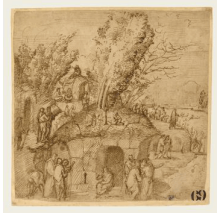
5. Lorenzo Costa Italian, about 1460 - 1535 Monks and Hermits in a Landscape , About 1505 Pen and brown ink 20.3 × 20.6 cm (8 × 8 1/8 in.) The J. Paul Getty Museum, Los Angeles 87.GA.11