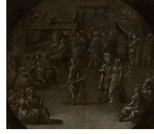
6. Nicolò dell'Abate Italian, 1509/1512 - 1571 Marriage of a Patrician Couple , About 1540-45 Oil on paper, some foreground figures pricked for transfer 40.6 × 47.8 cm (16 × 18 13/16 in.) The J. Paul Getty Museum, Los Angeles 87.GG.41