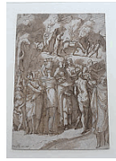
24. Attributed to Maturino da Firenze Italian, born 1489 Exodus , About 1540 Pen and brown ink and wash, with corrections in white heightening over black chalk Unframed: 24.5 × 16.9 cm (9 5/8 × 6 5/8 in.) Private collection, Los Angeles L.2018.8