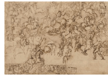
10. Girolamo Genga Italian, 1467 - 1551 Battle Scene , About 1525 Pen and brown ink 14 × 20.2 cm (5 1/2 × 7 15/16 in.) The J. Paul Getty Museum, Los Angeles 90.GA.131