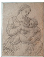
27. Northern follower of Andrea del Sarto Madonna and Child , About 1535 Black chalk, outlines pricked for transfer Unframed: 44.8 × 34.4 cm (17 5/8 × 13 9/16 in.) Private collection, Los Angeles L.2018.11