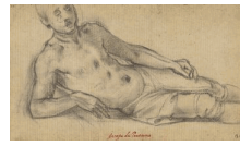
8. Pontormo (Jacopo Carucci) Italian (Florentine), 1494 - 1557 Reclining Youth , About 1525 Black chalk 15.7 × 27.5 cm (6 3/16 × 10 13/16 in.) The J. Paul Getty Museum, Los Angeles 90.GA.22