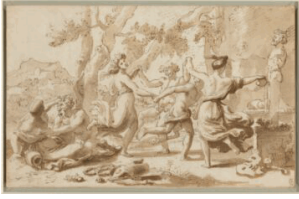
17. Nicolas Poussin French, 1594 - 1665 Dance before a Herm of Pan, About 1628-30 Pen and brown ink and brush and brown wash over traces of graphite on paper Unframed: 20.6 × 32.7 cm (8 1/8 × 12 7/8 in.) Lent by Her Majesty Queen Elizabeth II EX.2021.2.23