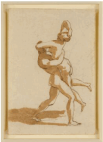
19. Nicolas Poussin French, 1594 - 1665 Study for The Abduction of the Sabine Women, About 1633 Pen and brown ink and brush and brown wash over traces of black chalk on paper Unframed: 11.6 × 8.1 cm (4 9/16 × 3 3/16 in.) Lent by Her Majesty Queen Elizabeth II EX.2021.2.27