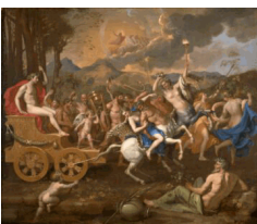
21. Nicolas Poussin French, 1594 - 1665 The Triumph of Bacchus, 1635-36 Oil on canvas Unframed: 128 × 151.8 cm (50 3/8 × 59 3/4 in.) The Nelson-Atkins Museum of Art, Kansas City, Missouri (Purchase: William Rockhill Nelson Trust) 31-94 EX.2021.2.29