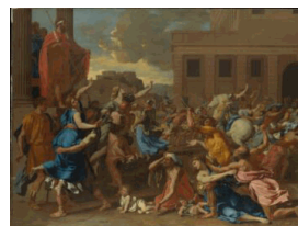
22. Nicolas Poussin French, 1594 - 1665 The Abduction of the Sabine Women, Probably 1633-34 Oil on canvas Unframed: 154.6 × 209.9 cm (60 7/8 × 82 5/8 in.) Lent by The Metropolitan Museum of Art, Harris Brisbane Dick Fund, 1946 (46.160) EX.2021.2.31