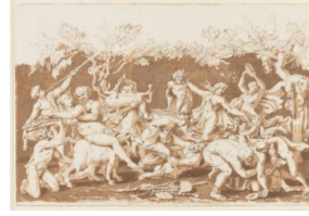
18. Nicolas Poussin French, 1594 - 1665 The Triumph of Pan, About 1635-36 Pen and brown ink and brush and brown wash over traces of black chalk and stylus on paper Unframed: 22.8 × 33.8 cm (9 × 13 5/16 in.) Lent by Her Majesty Queen Elizabeth II EX.2021.2.25