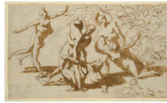
20. Nicolas Poussin French, 1594 - 1665 Study for The Abduction of the Sabine Women, About 1633 Pen and brown ink and brush and brown wash over traces of black chalk on paper Unframed: 11.3 × 19.4 cm (4 7/16 × 7 5/8 in.) Lent by Her Majesty Queen Elizabeth II EX.2021.2.28