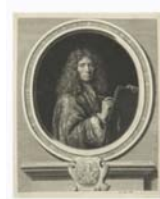
7. Cornelis Vermeulen about 1644 - about 1708 Portrait of Pierre Mignard, 1690 prints, reproductive prints, engravings, portraits 1 Object: H: 43.8 cm, W: 35.7 cm The Getty Research Institute 2004.PR.44