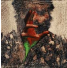
42. Lucas Samaras American, born Greece, 1936 Photo-Transformation , November 22, 1973 Polaroid SX-70 print Image: 7.6 x 7.6 cm (3 x 3 in.) The J. Paul Getty Museum, Los Angeles © Lucas Samaras 98.XM.20.12