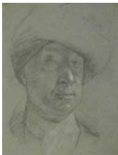
8. Jonathan Richardson the Elder British, 1667 - 1745 Self-Portrait Wearing a Cloth Hat , about 1730 - 1735 Black chalk heightened with white chalk on blue paper 30.3 x 23.2 cm (11 15/16 x 9 1/8 in. ) The J. Paul Getty Museum, Los Angeles 85.GB.210