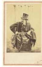
25. Nadar [Gaspard Félix Tournachon] French, 1820 - 1910 Self-Portraits as an Aeronaut , about 1863 Albumen silver Image: 7.8 x 5.6 cm (3 1/16 x 2 3/16 in.) The J. Paul Getty Museum, Los Angeles 84.XM.343.1