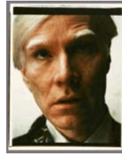
43. Andy Warhol (Andrew Warhola) American, 1928 - 1987 Self-Portrait , 1979 Polaroid polacolor print Sheet: 81.9 x 55.9 cm (32 1/4 x 22 in.) The J. Paul Getty Museum, Los Angeles © The Andy Warhol Foundation for the Visual Arts, Inc. 98.XM.5.1