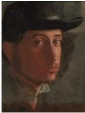
24. Edgar Degas French, 1834 - 1917 Self-Portrait , about 1857 - 1858 Oil on paper, laid down on canvas Unframed: 21 x 16.2 cm (8 1/4 x 6 3/8 in.) The J. Paul Getty Museum, Los Angeles 95.GG.43