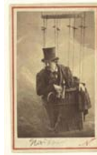
27. Nadar [Gaspard Félix Tournachon] French, 1820 - 1910 Self-Portraits as an Aeronaut , about 1863 Albumen silver Image: 8.8 x 5.6 cm (3 7/16 x 2 3/16 in.) The J. Paul Getty Museum, Los Angeles 84.XC.873.5906