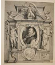
6. Pieter Jansz. Saenredam Dutch, 1597 - 1665 Portrait of Hans von Aachen, 1605 The Getty Research Institute 2000.PR.45