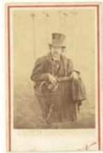
26. Nadar [Gaspard Félix Tournachon] French, 1820 - 1910 Self-Portraits as an Aeronaut , about 1863 Albumen silver Image: 7.9 x 5.6 cm (3 1/8 x 2 3/16 in.) The J. Paul Getty Museum, Los Angeles 84.XM.436.394