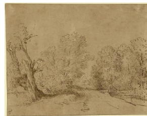
12. Rembrandt Harmensz. van Rijn Dutch, 1606 - 1669 A Wooded Road , About 1650 Pen and brown ink and brown wash on paper toned with brown wash 15.9 x 20.2 cm (6 1/4 x 7 15/16 in.) 85.GA.95