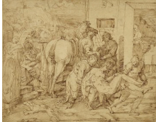
9. Master of the Egmont Albums Netherlandish ?, active about 1580 - 1590 The Good Samaritan , About 1580-90 Pen and brown ink 27.3 x 34.9 cm (10 3/4 x 13 3/4 in.) 87.GG.29