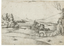
7. Monogrammist MS German, active 1557 A Falconer in a Landscape , 1557 Pen and black ink 15.1 x 21 cm (5 15/16 x 8 1/4 in.) 89.GA.13