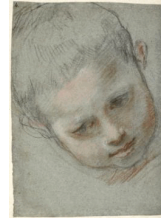
10. Federico Barocci Italian, about 1535 - 1612 Head of a Boy , About 1586-89 Colored chalks 24.9 x 17.6 cm (9 13/16 x 6 15/16 in.) 94.GB.35