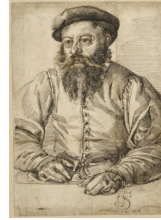
8. Tobias Stimmer Swiss, 1539 - 1584 Portrait of a Bearded Man , 1576 Pen and black and brown ink over black chalk 29.8 x 20.8 cm (11 3/4 x 8 3/16 in.) 92.GA.102