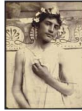
20. Baron Wilhelm von Gloeden German, 1856 - 1931 L'Offerta (The Offering) , 1902

Platinum print Image: 32.5 x 23.7 cm (12 13/16 x 9 5/16 in.) The J. Paul Getty Museum, Los Angeles 84.XM.160.1