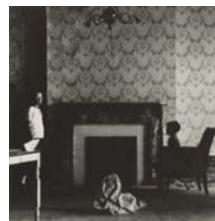
28. Ralph Eugene Meatyard American, 1925 - 1972, active Kentucky Life of Aspersorium , 1960

Gelatin silver print The J. Paul Getty Museum, Los Angeles 84.XP.727.39