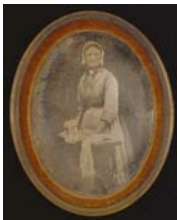
9. Unknown maker, French Portrait of a Laundress, 1848 - 1850

Salt print (from Calotype negative) Image: 20.6 x 15.7 cm (8 1/8 x 6 3/16 in.) The J. Paul Getty Museum, Los Angeles 88.XM.57.21