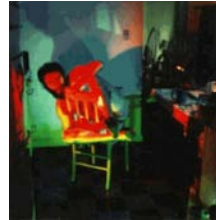
30. Lucas Samaras American, born Greece, 1936 Photo-Transformation , about 1970s

Gelatin silver print Image: 16.8 x 17.5 cm (6 5/8 x 6 7/8 in.) Gift of Christopher Meatyard and Jonathan Greene. The J. Paul Getty Museum, Los Angeles © Estate of Ralph Eugene Meatyard 2007.49.4