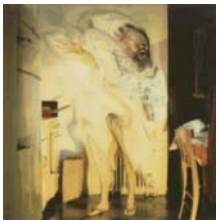
33. Lucas Samaras American, born Greece, 1936 Photo-Transformation , June 13, 1974

Polaroid SX-70 print Image: 7.6 x 7.6 cm (3 x 3 in.) The J. Paul Getty Museum, Los Angeles © Lucas Samaras 98.XM.20.12