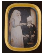
10. Unknown maker, French A Sister of Charity Serving a Patient at the Hospice de Beaune, about 1848

Daguerreotype, hand-colored Image: 13.5 x 10 cm (5 5/16 x 3 15/16 in.) The J. Paul Getty Museum, Los Angeles 84.XT.403.21