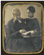
7. Unknown maker, French Woman Reading to a Girl, about 1845

Salted paper, from Calotype negative print Image: 20.2 x 14.6 cm (7 15/16 x 5 3/4 in.) The J. Paul Getty Museum, Los Angeles 88.XM.57.27