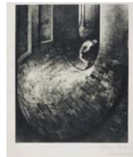
26. Dora Maar French, 1907 - 1997 Le Simulateur (The Pretender) , 1936

Gelatin silver print Image: 22.9 x 29.8 cm (9 x 11 3/4 in.) The J. Paul Getty Museum, Los Angeles 84.XM.230.2