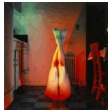
34. Lucas Samaras American, born Greece, 1936 Photo-Transformation , February 5, 1974

Polaroid SX-70 print Image: 7.6 x 7.6 cm (3 x 3 in.) The J. Paul Getty Museum, Los Angeles © Lucas Samaras 98.XM.20.3