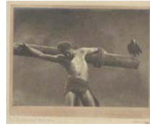
24. William Mortensen American, 1897 - 1965 The Bad Thief , 1926

Gelatin silver print Image: 22.1 x 17.6 cm (8 11/16 x 6 15/16 in.) The J. Paul Getty Museum, Los Angeles © Man Ray Trust ARS-ADAGP 84.XM.1000.80