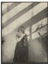
27. Clarence John Laughlin American, 1905 - 1985 Figure with Phantasmal Fan , 1941

Gelatin silver print Image: 26.6 x 21.7 cm (10 1/2 x 8 1/2 in.) The J. Paul Getty Museum, Los Angeles © ADAGP, Paris 84.XP.780.2