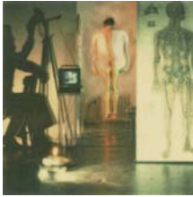
35. Lucas Samaras American, born Greece, 1936 Photo-Transformation , July 6, 1975

Polaroid SX-70 print Image: 7.6 x 7.6 cm (3 x 3 in.) The J. Paul Getty Museum, Los Angeles © Lucas Samaras 98.XM.20.5