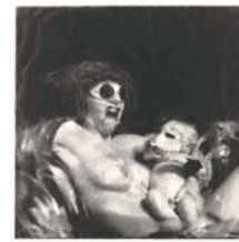
38. Joel-Peter Witkin American, born 1939 Mother and Child (With Retractor, Screaming) , 1979

Polaroid SX-70 print Image: 7.6 x 7.6 cm (3 x 3 in.) The J. Paul Getty Museum, Los Angeles © Lucas Samaras 99.XM.53