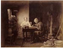
17. Henry Peach Robinson British, 1830 - 1901 When the Day's Work Is Done , 1877

Albumen silver print Image: 56 x 74.5 cm (22 1/16 x 29 5/16 in.) The J. Paul Getty Museum, Los Angeles 84.XM.898