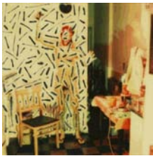
31. Lucas Samaras American, born Greece, 1936 Photo-Transformation , September 11, 1973

Polaroid SX-70 print Image: 7.6 x 7.6 cm (3 x 3 in.) The J. Paul Getty Museum, Los Angeles © Lucas Samaras 98.XM.20.4