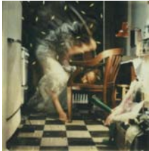
37. Lucas Samaras American, born Greece, 1936 Photo-Transformation , 1976

Polaroid SX-70 print Image: 7.6 x 7.6 cm (3 x 3 in.) The J. Paul Getty Museum, Los Angeles © Lucas Samaras 98.XM.20.2