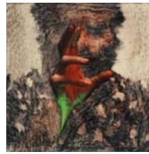
32. Lucas Samaras American, born Greece, 1936 Photo-Transformation , November 22, 1973

Polaroid SX-70 print Image: 7.6 x 7.6 cm (3 x 3 in.) The J. Paul Getty Museum, Los Angeles © Lucas Samaras 98.XM.20.8