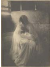
19. Gertrude Käsebier American, 1852 - 1934 The Manger (Ideal Motherhood) , 1899

Albumen silver print Image: 23.3 x 17.5 cm (9 3/16 x 6 7/8 in.) The J. Paul Getty Museum, Los Angeles 84.XM.631.5