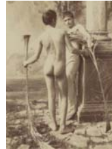
18. Baron Wilhelm von Gloeden German, 1856 - 1931 Two Youths Holding Palm Fronds , about 1885 - 1905

Albumen silver print Image: 56 x 74.5 cm (22 1/16 x 29 5/16 in.) The J. Paul Getty Museum, Los Angeles 84.XM.898