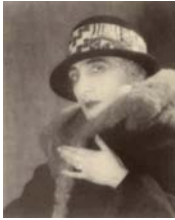
23. Man Ray (Emmanuel Radnitsky) American, 1890 - 1976 Rose Sélavy (Marcel Duchamp) , 1923

Gelatin silver print Image: 22.1 x 17.6 cm (8 11/16 x 6 15/16 in.) The J. Paul Getty Museum, Los Angeles 84.XM.1000.80