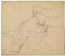
7. Roelandt Savery Flemish, 1576 - 1639 Seated Woman , About 1606-9 Pen and brown ink over metalpoint underdrawing 14.9 × 17.6 cm (5 7/8 × 6 15/16 in.) The J. Paul Getty Museum, Los Angeles 83.GA.383