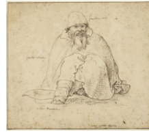
6. Roelandt Savery Flemish, 1576 - 1639 Seated Man , About 1606-9 Pen and brown ink over metalpoint underdrawing 15.4 × 17.6 cm (6 1/16 × 6 15/16 in.) The J. Paul Getty Museum, Los Angeles 83.GA.382