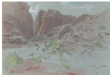
27. Edward Lear British, 1812 - 1888 Petra, April 14, 1858 , 1858 Pen and brown ink with watercolor and gouache over black chalk on blue paper 36.2 × 54 cm (14 1/4 × 21 1/4 in.) The J. Paul Getty Museum, Los Angeles 2008.45