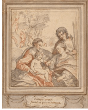
25. Federico Zuccaro Italian, about 1541 - 1609 The Mystic Marriage of Saint Catherine , About 1595 Black and red chalk 14.8 × 13.1 cm (5 13/16 × 5 3/16 in.) The J. Paul Getty Museum, Los Angeles 2004.82