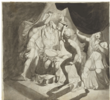
9. Henry Fuseli (Johann Heinrich Füssli) Swiss, 1741 - 1825 An Old Man Murdered by Three Younger Men , Early 1770s Pen and black ink and gray wash 42.2 × 47.6 cm (16 5/8 × 18 3/4 in.) The J. Paul Getty Museum, Los Angeles 84.GG.711