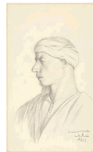
28. Jean-Léon Gérôme French, 1824 - 1904 Portrait of an Egyptian Fellah , 1856 Black chalk 26.7 × 16.2 cm (10 1/2 × 6 3/8 in.) The J. Paul Getty Museum, Los Angeles 2010.16