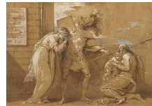
10. Benjamin West American, 1738 - 1820 Hector Bidding Farewell to Andromache , 1797 Pen and brown ink, brown wash, and blue and white gouache on brown prepared paper 31.8 × 46 cm (12 1/2 × 18 1/8 in.) The J. Paul Getty Museum, Los Angeles 84.GG.722