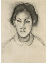
23. Paul Gauguin French, 1848 - 1903 Head of a Tahitian Woman , About 1892 Charcoal 41.9 × 31.1 cm (16 1/2 × 12 1/4 in.) The J. Paul Getty Museum, Los Angeles 2001.57