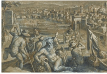
5. Stradanus Flemish, 1523 - 1605 The Arno with Fishermen , 1580-96 Pen and brown ink and brown and blue wash with white gouache heightening; irregular section cut out and replaced at bottom center by the artist 20.3 × 30 cm (8 × 11 13/16 in.) The J. Paul Getty Museum, Los Angeles 83.GG.380