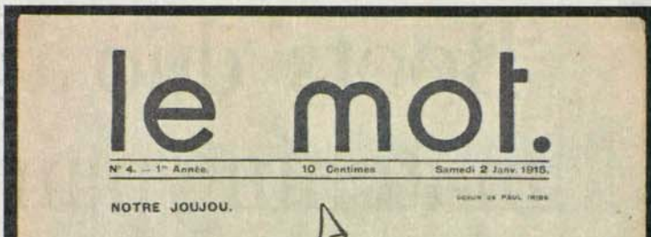
PAUL IRIBE illustration titled "I Have You My Captain, You Won't Fall" is in a Getty exhibition marking the WWI centennial.