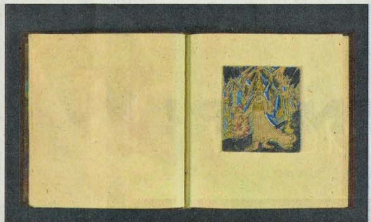
“SAINT JOHN’S Vision of the Seven Candlesticks” is among the pieces in the “Images of War” exhibition at Getty Center.