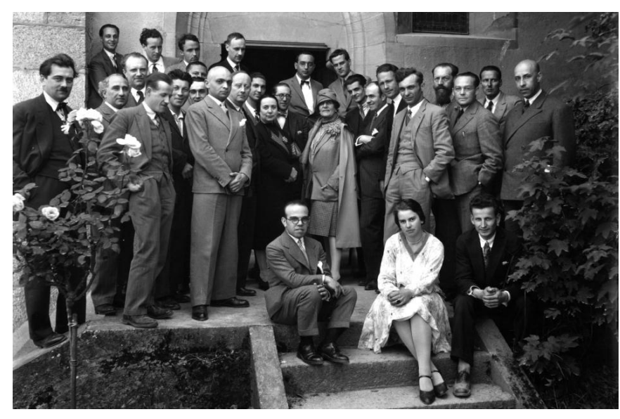
CIAM as a driving factor of modernist architecture and our content of choice for the current project