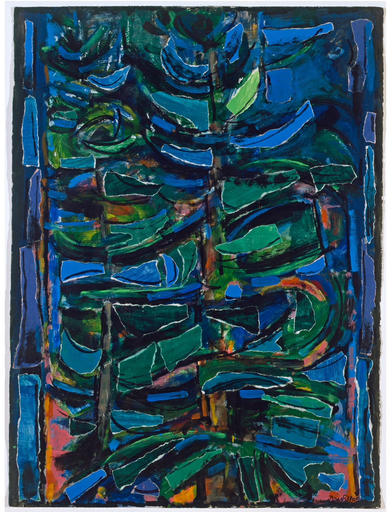
David C. Driskell, Pine Trees at Night , 2005, collage and mixed media on paper