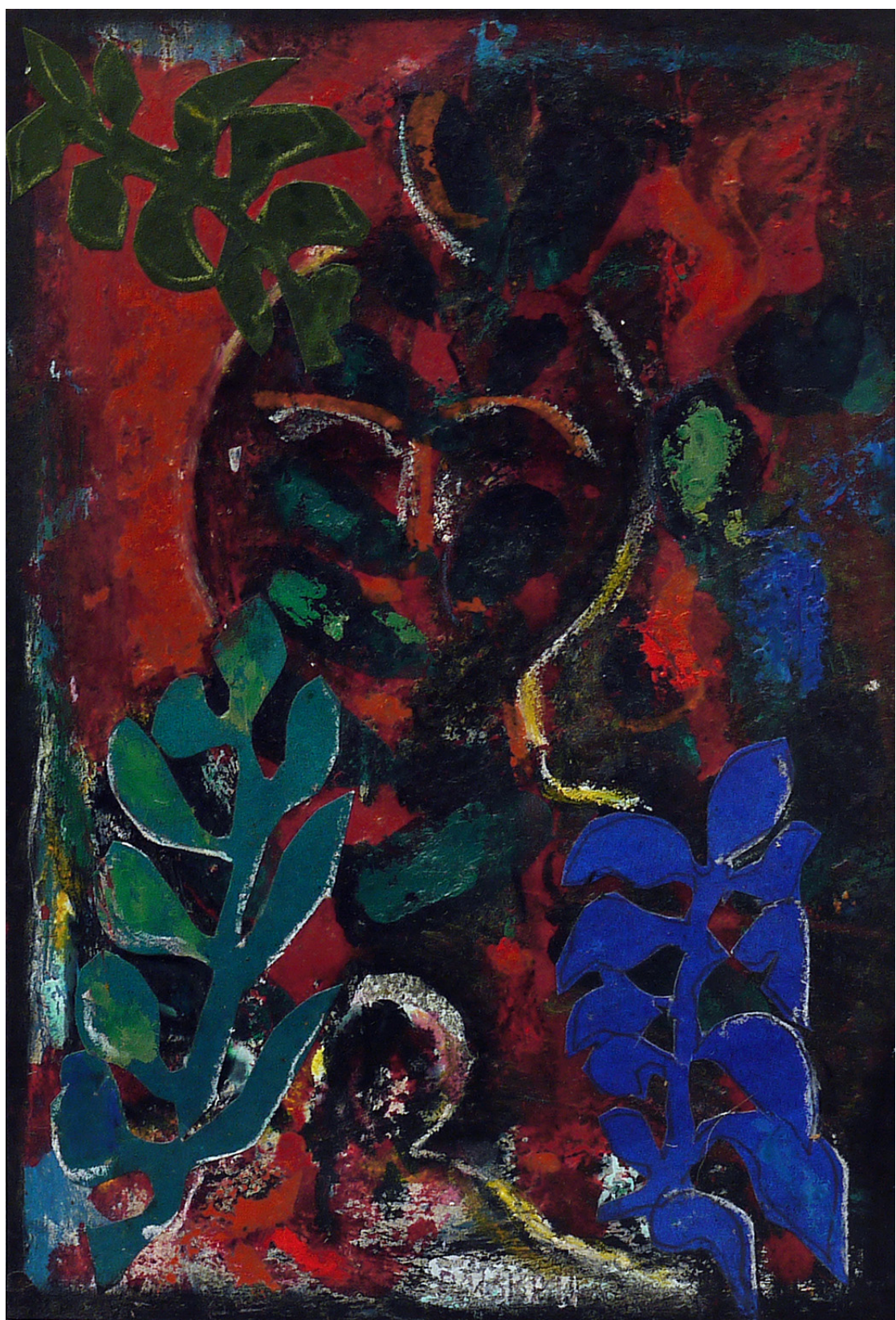
David C. Driskell, Mask Watch , 2005, collage and oil on paper