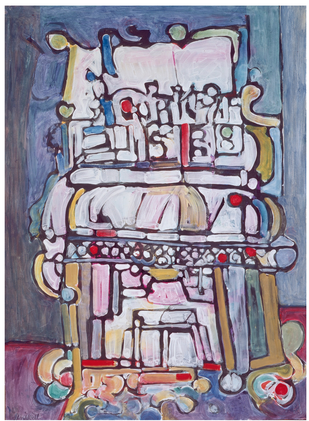
David C. Driskell, The Organ #2 , 2005, gouache on paper