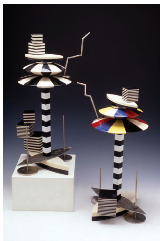
Peter Shire, Surprise Pot 1 and 2 , 2004.