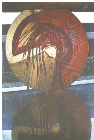
Sheila Hicks, L'épouse préférée occupe ses nuits , 1972.