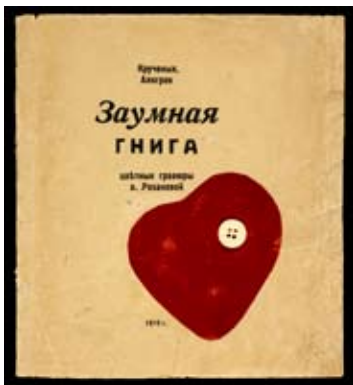
9. Transrational Boog ( Zaumnaia gniga ) Moscow, 1916 Olga Rozanova (Russian, 1886–1918), imagery, cover Aleksei Kruchenykh (Russian, 1886–1969?), poetry Aliagrov (Roman Jakobson) (Russian, 1896–1982), poetry Collage and letterpress Research Library, The Getty Research Institute (88-B27991)