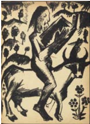
7. Hermit Natalia Goncharova (Russian, 1881–1962) Lithography Alexei Kruchenykh, Pustynnikii; Pustynnitsa: Dve poemy (Moscow, 1913) Research Library, The Getty Research Institute (88-B26127)