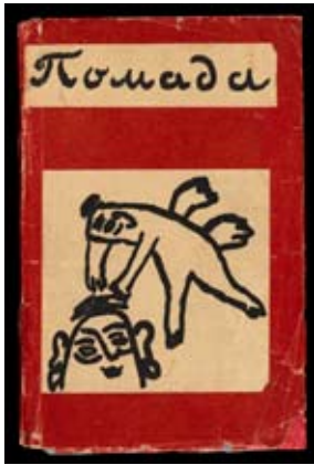
5. Pomade ( Pomada ) Moscow, 1913 Mikhail Larionov (Russian, 1881–1964), imagery, cover Alexei Kruchenykh (Russian poet, 1886–1969?), poetry Collage and lithography Research Library, The Getty Research Institute (88-B26240)