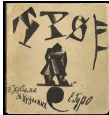
8. Threesome ( Troe ) St. Petersburg, 1913 Kazimir Malevich (Russian, 1878–1935), imagery, cover Velimir Khlebnikov (Russian, 1885–1922), poetry, prose Alexei Kruchenykh (Russian 1886–1969?), poetry, prose Lithography Research Library, The Getty Research Institute (88-B29825)