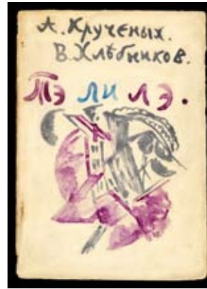
6. Te li le St. Petersburg, 1914 Olga Rozanova (Russian, 1886–1918), imagery, cover Velimir Khlebnikov (Russian, 1885–1922), poetry Alexei Kruchenykh (Russian, 1886–1969?), poetry Hectography in three colors Research Library, The Getty Research Institute (88-B28007)