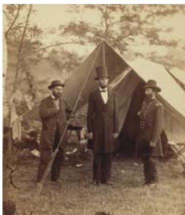
3. Alexander Gardner American, born Scotland, 1821–1882 President Lincoln, United States Headquarters, Army of the Potomac, near Antietam. , October 4, 1862 Albumen silver print Image: 21.9 x 19.7 cm (8 5/8 x 7 3/4 in.) The J. Paul Getty Museum, Los Angeles 84.XM.482.1