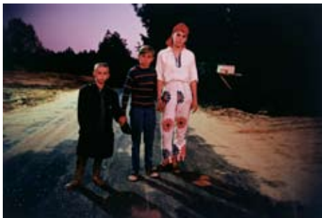
9. William Eggleston American, born 1939 Morton, Mississippi , 1971 Dye transfer print Image: 30.2 x 45.1 cm (11 7/8 x 17 3/4 in.) Gift of Caldecot Chubb, The J. Paul Getty Museum, Los Angeles 98.XM.232.3