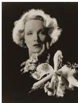
4. Cecil Beaton British, 1904–1980 Marlene Dietrich. , 1932 Gelatin silver print Image: 25.4 x 20.3 cm (10 x 8 in.) The J. Paul Getty Museum, Los Angeles © The Cecil Beaton Studio Archive at Sotheby's 84.XP.460.10