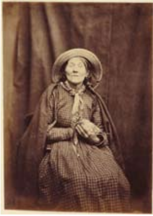
5. Dr. Hugh Welch Diamond British, 1809–1886 Seated Woman with Bird , about 1855 Albumen silver print Image: 19.1 x 14.4 cm (7 1/2 x 5 11/16 in.) The J. Paul Getty Museum, Los Angeles 84.XP.927.3