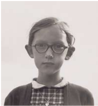
7. Dorothea Lange American, 1895–1965 A Young Girl in Ennis, Ireland, 1954 Gelatin silver print Image: 24.1 x 22.9 cm (9 1/2 x 9 in.) The J. Paul Getty Museum, Los Angeles 2000.43.11