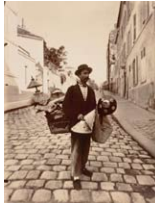
6. Eugène Atget French, 1857–1927 Lampshade Vendor, Rue Lepic, Paris 1901 Albumen silver print Image: 22.2 x 17.8 cm (8 3/4 x 7 in.) Anonymous gift, The J. Paul Getty Museum, Los Angeles 94.XM.108.4