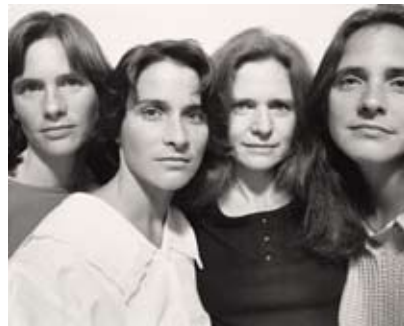
10. Nicholas Nixon American, born 1947 The Brown Sisters, Cambridge, 1986 Gelatin silver print Image 19.7 x 24.6 cm (7 3/4 x 9 11/16 in.) The J. Paul Getty Museum, Los Angeles 2000.28.9