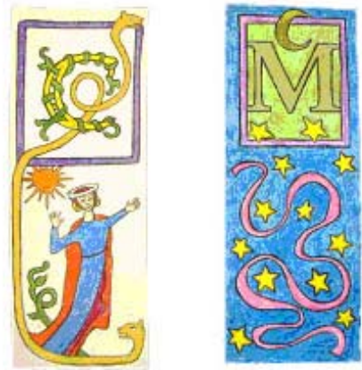
Make your own bookmarks like these!

Hundreds of years ago books were made entirely by hand! An artist would paint the decorations on each page. Sometimes, they would paint fanciful designs or even entire stories in individual letters, like the ones you see above.