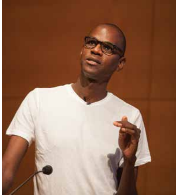
Artist Mark Bradford (1994 Getty intern at Side Street Projects) speaking at the Arts Summit of 2013.

each intern participates in “Arts Summit”—a daylong event organized by the Foundation where interns meet with professionals from arts organizations across the county and gain broad exposure to various careers. Finally, interns meet several times throughout the program in small “learning hubs,” where they come together outside of their home institutions for behind-the-scenes tours of museums, mentoring opportunities, and group discussions.