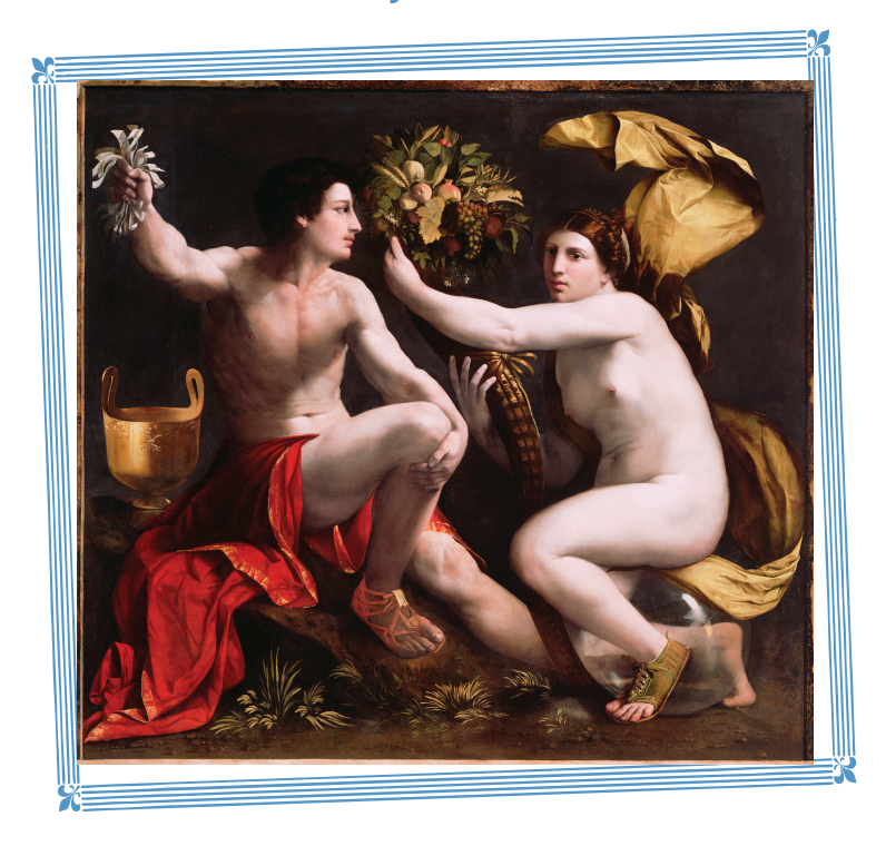
This was painted by Italian artist Dosso Dossi in about 1530.