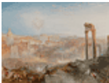
Description: Joseph Mallord William Turner, Modern Rome-Campo Vaccino , 1839 Location: W202 Upper Level Book reference: page 73