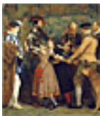
Description: John Everett Millais, The Ransom , 1860-62 Location: W202 Upper Level Book reference: page 90