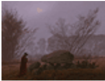
Description: Caspar David Friedrich, A Walk at Dusk , about 1830-35 Location: W201 Upper Level Book reference: page 27