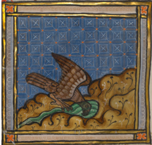
Unknown artist An Eagle, about 1270 The J. Paul Getty Museum, Los Angeles

Build your knowledge of proportion. Choose an object and use the chart below to experiment with proportion.