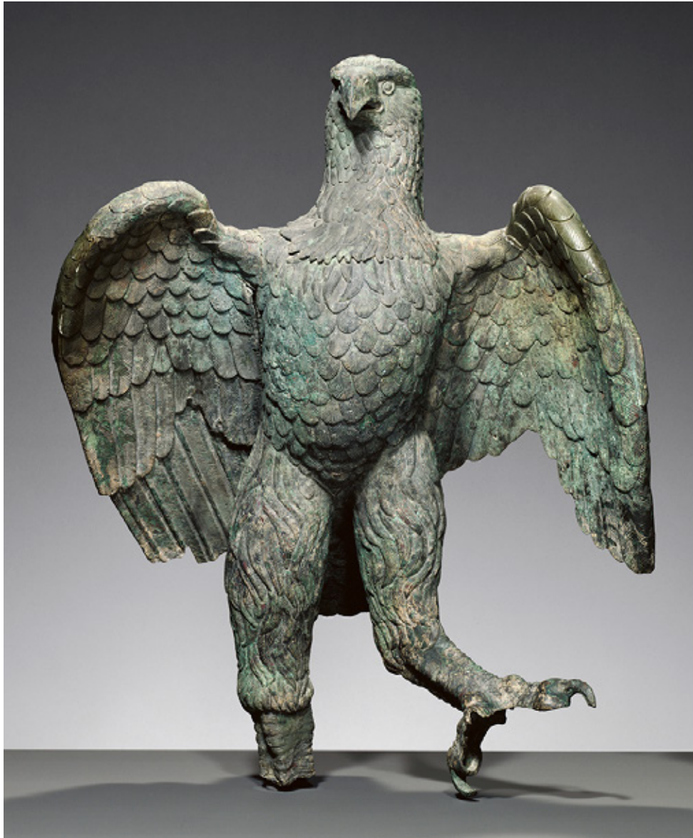
Unknown artist Eagle, 100–300 The J. Paul Getty Museum, Los Angeles

Learning about the principles of design? Continue by noticing proportion in works of art. Proportion is created when the size, amount, or number of all parts of the art relate well to each other. Look at the sculpture of the eagle below. Notice the size of its different body parts. Do certain body parts seem exaggerated to be too large or small?