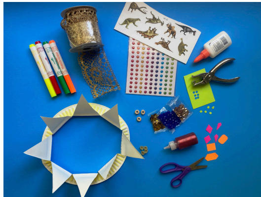
Materials for crown