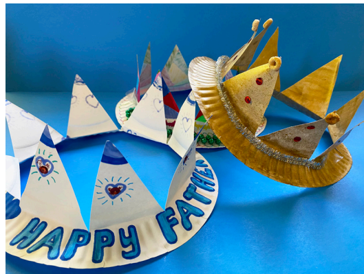
Completed radiant crowns

The “radiant crown” or “sun crown” is distinguished by its ray-like pattern that symbolizes the power of the sun. It is an ancient crown shape that you might recognize from the Statue of Liberty.