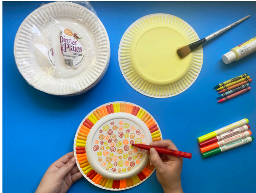
Decorating paper plates