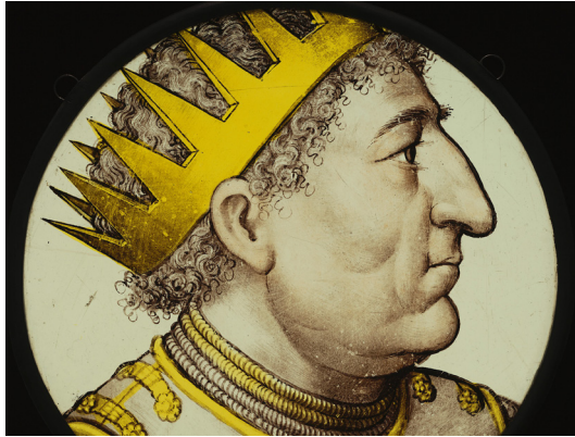
An Emperor or a King (detail), Unknown, about 1550.