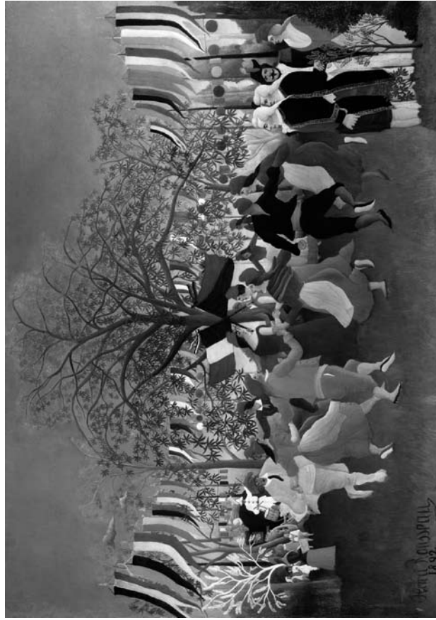
Henri Rousseau (French, 1844–1910), A Centennial of Independence , 1892. Oil on canvas, 44 x 61 7/8 in. 88.PA.58