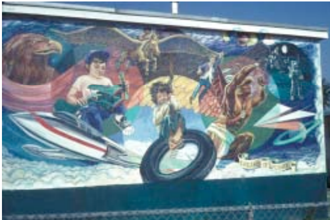
Figure 1 David Botello, Dreams of Flight , 1973–78, in its original state. Approx. 24 x 32 ft. Estrada Courts, Los Angeles.