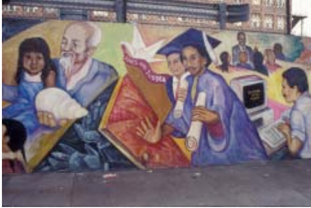
Figure 9 Haight-Ashbury Muralists, Educate to Liberate (detail), 1988. Approx. 2–12 ft. x 390 ft. Hayes Street and Masonic Avenue, San Francisco. Reproduced courtesy of the artists.