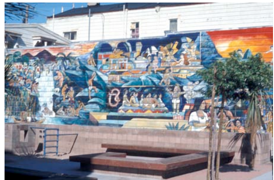
Figure 6 Quetzalcoatl , after it was revised by Michael Rios soon after its completion.