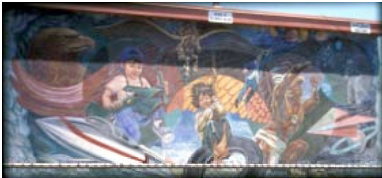
Figure 2 Dreams of Flight , after revision of 1996.