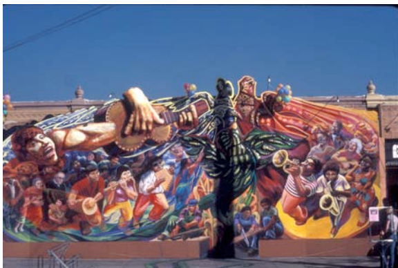
Figure 4 Song of Unity , after revision of 1998 by Commonarts with Joanna Cooke. Reproduced courtesy of Commonarts. Photo: Tim Drescher.