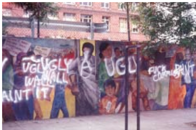
Figure 8 Haight-Ashbury Muralists, Our History Is No Mystery (detail), 1976. Approx. 2–12 ft. x 390 ft. Hayes Street and Masonic Avenue, San Francisco. Reproduced courtesy of the artists. Photo : Tim Drescher.

The question raised by all these examples is this: How is it to be decided which changes are acceptable and which are not? All that is clear, to me at least, is that a mechanism must be established that permits community members to stop unacceptable changes but that allows acceptable ones. Acceptable means simply what they like or don't like, for their reasons. That is what is meant by dynamic . That is what is meant by community .