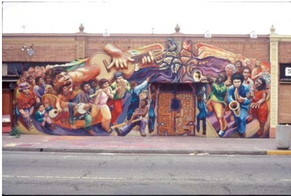
Figure 3 Commonarts (R. Patlán, B. Thiele, O. Neumann, A. DeLeon), Song of Unity , 1978, in its original state. Approx. 15 x 40 ft. La Peña Cultural Center, Berkeley, California. Reproduced courtesy of Commonarts, San Francisco. Photo: Tim Drescher.