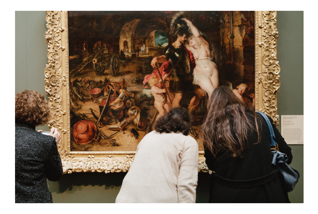
Participants looking at a gilded frame at the Getty Center, Museum East Pavilion, Gallery E202. The Return from War: Mars Disarmed by Venus by Peter Paul Rubens.

discuss the ethical considerations of conservation treatments and dialogue between different stakeholders involved in the decision-making process. This was followed by a tour in the museum's galleries to look at gilded surfaces as a group. In the afternoon, a half-day discussion focused on specific cleaning methods available to treat the sensitive gilded wooden surfaces. The last day of the meeting began with presentations by conservation scientists and group discussions on the scientific methods used to study gilded wooden surfaces and control the effects of cleaning systems. The meeting concluded in the afternoon with group discussions on the next steps to be taken, including strategies to answer identified training needs in the form of workshops and reference materials.