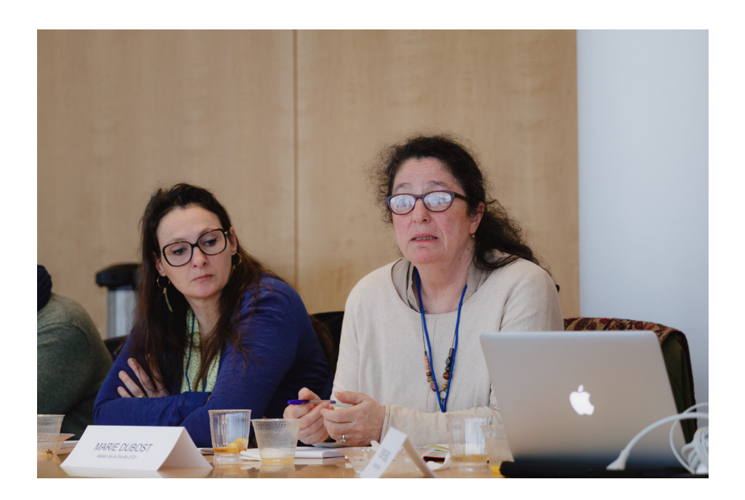
FIGURE 3 Participants engaged in a conversation during the meeting.

In France, traditional gilding techniques can still be learned through apprenticeships, but there is no formal training in the conservation of gilded surfaces in graduate programs. As seen in other countries like the United States, any form of gilding specialization would be offered on an individual basis at a student's request, with limited opportunities available. French participants described the current educational offerings available in France.