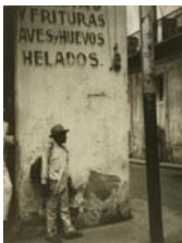
39. Walker Evans American, 1903 - 1975 Havana Corner, 1933 Gelatin silver print Image: 20 x 15.2 cm (7 7/8 x 6 in.) The J. Paul Getty Museum, Los Angeles 84.XM.956.262