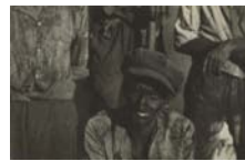
34. Walker Evans American, 1903 - 1975 [Coal Stevedore, Havana], 1933 Gelatin silver print Image: 9.7 x 13.7 cm (3 13/16 x 5 3/8 in.) The J. Paul Getty Museum, Los Angeles 84.XM.956.256