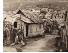
48. Walker Evans American, 1903 - 1975 [Village of Havana Poor], 1933 Gelatin silver print Image: 20.2 x 24.6 cm (7 15/16 x 9 11/16 in.) The J. Paul Getty Museum, Los Angeles 84.XM.956.277