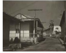
12. Walker Evans American, 1903 - 1975 Small Village, Regla, 1933 Gelatin silver print Image: 15 x 19.4 cm (5 7/8 x 7 5/8 in.) The J. Paul Getty Museum, Los Angeles 84.XM.956.164