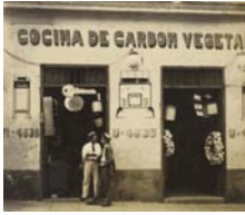
5. Walker Evans American, 1903 - 1975 Havana, 1933 Gelatin silver print Image: 15.4 x 17.9 cm (6 1/16 x 7 1/16 in.) The J. Paul Getty Museum, Los Angeles 84.XM.956.146