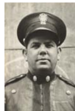
50. Walker Evans American, 1903 - 1975 Havana Policeman, 1933 Gelatin silver print Image: 19.5 x 13.3 cm (7 11/16 x 5 1/4 in.) The J. Paul Getty Museum, Los Angeles 84.XM.956.465