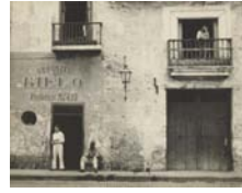
36. Walker Evans American, 1903 - 1975 Old Havana Housefronts, 1933 Gelatin silver print Image: 17.6 x 22.7 cm (6 15/16 x 8 15/16 in.) The J. Paul Getty Museum, Los Angeles 84.XM.956.258