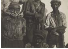
35. Walker Evans American, 1903 - 1975 [Coal Stevedores, Havana], 1933 Gelatin silver print Image: 12.7 x 17.7 cm (5 x 6 15/16 in.) The J. Paul Getty Museum, Los Angeles 84.XM.956.257