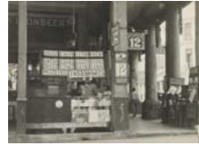
42. Walker Evans American, 1903 - 1975 Colonnade Shop, Havana, 1933 Gelatin silver print Image: 17 x 23.7 cm (6 11/16 x 9 5/16 in.) The J. Paul Getty Museum, Los Angeles 84.XM.956.266