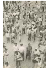
8. Walker Evans American, 1903 - 1975 Havana Street, 1933 Gelatin silver print Image: 23.5 x 15.9 cm (9 1/4 x 6 1/4 in.) The J. Paul Getty Museum, Los Angeles 84.XM.956.152