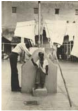
43. Walker Evans American, 1903 - 1975 Havana Courtyard, 1933 Gelatin silver print Image: 24.3 x 17.1 cm (9 9/16 x 6 3/4 in.) The J. Paul Getty Museum, Los Angeles 84.XM.956.268