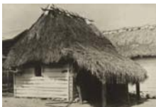
15. Walker Evans American, 1903 - 1975 Cuban Bohío, 1933 Gelatin silver print Image: 13.5 x 20 cm (5 5/16 x 7 7/8 in.) The J. Paul Getty Museum, Los Angeles 84.XM.956.173