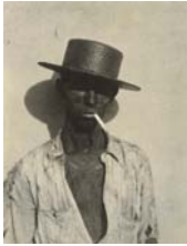
29. Walker Evans American, 1903 - 1975 Coal Stevedore, Havana, 1933 Gelatin silver print Image: 20.2 x 15.2 cm (7 15/16 x 6 in.) The J. Paul Getty Museum, Los Angeles 84.XM.956.242