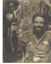
54. Alberto Korda Cuban, 1928 - 2001 [Camilo Cienfuegos on Break in a Sierra Maestra Village, Cuba], 1958 Gelatin silver print Image: 59.4 x 47.5 cm (23 3/8 x 18 11/16 in.) The J. Paul Getty Museum, Los Angeles 2010.87.3