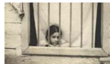
16. Walker Evans American, 1903 - 1975 [Cuban Girl Looking through Window Bars], 1933 Gelatin silver print Image: 13.7 x 24.9 cm (5 3/8 x 9 13/16 in.) The J. Paul Getty Museum, Los Angeles 84.XM.956.175