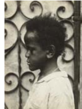
6. Walker Evans American, 1903 - 1975 Negro Child, Havana, 1933 Gelatin silver print Image: 19.5 x 14.8 cm (7 11/16 x 5 13/16 in.) The J. Paul Getty Museum, Los Angeles 84.XM.956.147