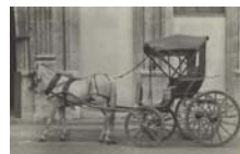
28. Walker Evans American, 1903 - 1975 Horse Carriage, Havana, 1933 Gelatin silver print Image: 13.3 x 21.4 cm (5 1/4 x 8 7/16 in.) The J. Paul Getty Museum, Los Angeles 84.XM.956.240