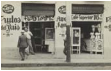
19. Walker Evans American, 1903 - 1975 Havana Shopfront, 1933 Gelatin silver print Image: 14.8 x 23.3 cm (5 13/16 x 9 3/16 in.) The J. Paul Getty Museum, Los Angeles 84.XM.956.189