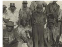
14. Walker Evans American, 1903 - 1975 [Coal Stevedores, Havana], 1933 Gelatin silver print Image: 15.6 x 21.1 cm (6 1/8 x 8 5/16 in.) The J. Paul Getty Museum, Los Angeles 84.XM.956.167