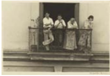
11. Walker Evans American, 1903 - 1975 [Balcony Spectators, Detail], 1933 Gelatin silver print Image: 10.2 x 15.4 cm (4 x 6 1/16 in.) The J. Paul Getty Museum, Los Angeles 84.XM.956.160