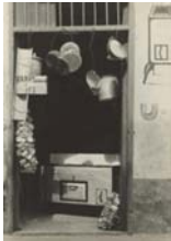
7. Walker Evans American, 1903 - 1975 [Doorway with Hanging Pots, Kitchenware Shop, Havana], 1933 Gelatin silver print Image: 23.5 x 16.5 cm (9 1/4 x 6 1/2 in.) The J. Paul Getty Museum, Los Angeles 84.XM.956.148