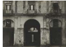
26. Walker Evans American, 1903 - 1975 [Building Facade, Havana], 1933 Gelatin silver print Image: 12.2 x 17.1 cm (4 13/16 x 6 3/4 in.) The J. Paul Getty Museum, Los Angeles 84.XM.956.236