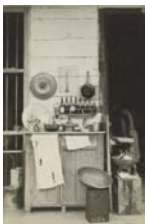
45. Walker Evans American, 1903 - 1975 [Cuban Courtyard Kitchen], 1933 Gelatin silver print Image: 23 x 14.9 cm (9 1/16 x 5 7/8 in.) The J. Paul Getty Museum, Los Angeles 84.XM.956.270