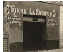
38. Walker Evans American, 1903 - 1975 Small Restaurant, Havana, 1933 Gelatin silver print Image: 15.3 x 18.7 cm (6 x 7 3/8 in.) The J. Paul Getty Museum, Los Angeles 84.XM.956.261