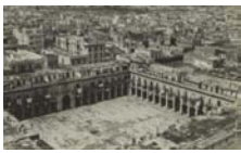
49. Walker Evans American, 1903 - 1975 View of Havana [Plaza del Vapor, Market Area, Havana], 1933 Gelatin silver print Image: 14.3 x 23.6 cm (5 5/8 x 9 5/16 in.) The J. Paul Getty Museum, Los Angeles 84.XM.956.278