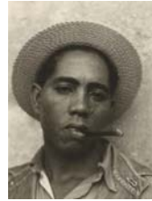
30. Walker Evans American, 1903 - 1975 [Stevedore], 1933 Gelatin silver print Image: 20.1 x 15.1 cm (7 15/16 x 5 15/16 in.) The J. Paul Getty Museum, Los Angeles 84.XM.956.243