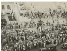
9. Walker Evans American, 1903 - 1975 Public Spectacle, 1933 Gelatin silver print Image: 17.5 x 23.3 cm (6 7/8 x 9 3/16 in.) The J. Paul Getty Museum, Los Angeles 84.XM.956.156