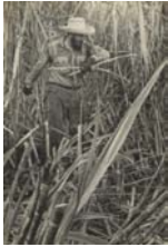
83. Alberto Korda Cuban, 1928 - 2001 [Fidel Castro during a Sugar Harvest, Camagüey, Cuba], late 1960s Gelatin silver print Image: 35.2 x 23.8 cm (13 7/8 x 9 3/8 in.) The J. Paul Getty Museum, Los Angeles 2010.87.2