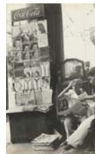
22. Walker Evans American, 1903 - 1975 Havana Shopping District, 1933 Gelatin silver print Image: 24.4 x 15.5 cm (9 5/8 x 6 1/8 in.) The J. Paul Getty Museum, Los Angeles 84.XM.956.215