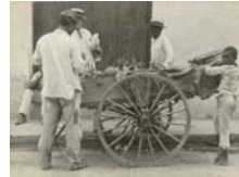
24. Walker Evans American, 1903 - 1975 Havana Street Vendors, 1933 Gelatin silver print Image: 17.5 x 23.6 cm (6 7/8 x 9 5/16 in.) The J. Paul Getty Museum, Los Angeles 84.XM.956.230