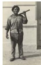
40. Walker Evans American, 1903 - 1975 Havana Stevedore, 1933 Gelatin silver print Image: 23.8 x 15.4 cm (9 3/8 x 6 1/16 in.) The J. Paul Getty Museum, Los Angeles 84.XM.956.263