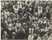
25. Walker Evans American, 1903 - 1975 [Spectacle, Capital Steps, Possibly Independence Day, May 20], 1933 Gelatin silver print Image: 19.7 x 25.3 cm (7 3/4 x 9 15/16 in.) The J. Paul Getty Museum, Los Angeles 84.XM.956.231