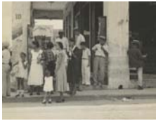
31. Walker Evans American, 1903 - 1975 City People, 1933 Gelatin silver print Image: 17.7 x 22.9 cm (6 15/16 x 9 in.) The J. Paul Getty Museum, Los Angeles 84.XM.956.244