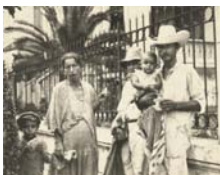
27. Walker Evans American, 1903 - 1975 Havana: Country Family, 1933 Gelatin silver print Image: 17.8 x 22.5 cm (7 x 8 7/8 in.) The J. Paul Getty Museum, Los Angeles 84.XM.956.239