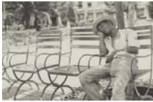
13. Walker Evans American, 1903 - 1975 [Parque Central II], 1933 Gelatin silver print Image: 15.1 x 23 cm (5 15/16 x 9 1/16 in.) The J. Paul Getty Museum, Los Angeles 84.XM.956.166