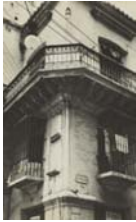
47. Walker Evans American, 1903 - 1975 [Corner of Havana Building with Decorative Iron Grillwork], 1933 Gelatin silver print Image: 24 x 14.9 cm (9 7/16 x 5 7/8 in.) The J. Paul Getty Museum, Los Angeles 84.XM.956.275