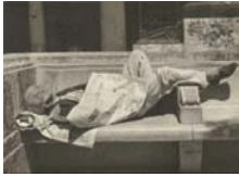
23. Walker Evans American, 1903 - 1975 Vagrant in the Pardo of Havana, 1933 Gelatin silver print Image: 17.1 x 23.6 cm (6 3/4 x 9 5/16 in.) The J. Paul Getty Museum, Los Angeles 84.XM.956.222