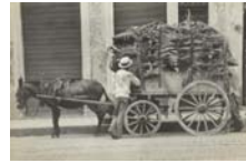
32. Walker Evans American, 1903 - 1975 [Mule, Wagon and Two Men, Havana], 1933 Gelatin silver print Image: 13.8 x 21 cm (5 7/16 x 8 1/4 in.) The J. Paul Getty Museum, Los Angeles 84.XM.956.247