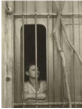
41. Walker Evans American, 1903 - 1975 Courtyard in Havana, 1933 Gelatin silver print Image: 19.7 x 14.8 cm (7 3/4 x 5 13/16 in.) The J. Paul Getty Museum, Los Angeles 84.XM.956.265