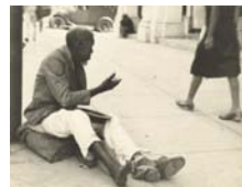
46. Walker Evans American, 1903 - 1975 Beggar, 1933 Gelatin silver print Image: 18.3 x 23.9 cm (7 3/16 x 9 3/8 in.) The J. Paul Getty Museum, Los Angeles 84.XM.956.273