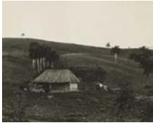
17. Walker Evans American, 1903 - 1975 Bohío, 1933 Gelatin silver print Image: 15.1 x 18.6 cm (5 15/16 x 7 5/16 in.) The J. Paul Getty Museum, Los Angeles 84.XM.956.176