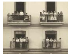
10. Walker Evans American, 1903 - 1975 Balcony Spectators, 1933 Gelatin silver print Image: 19.8 x 25.2 cm (7 13/16 x 9 15/16 in.) The J. Paul Getty Museum, Los Angeles 84.XM.956.159