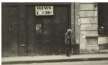
21. Walker Evans American, 1903 - 1975 Havana, 1933 Gelatin silver print Image: 10.7 x 18.1 cm (4 3/16 x 7 1/8 in.) The J. Paul Getty Museum, Los Angeles 84.XM.956.205