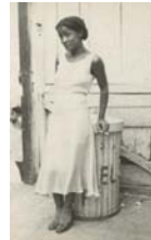
20. Walker Evans American, 1903 - 1975 [Woman in a Courtyard], 1933 Gelatin silver print Image: 25.3 x 16.2 cm (9 15/16 x 6 3/8 in.) The J. Paul Getty Museum, Los Angeles 84.XM.956.196