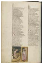
9. German David and Bathsheba, about 1400 - 1410 with addition in 1487 from World Chronicle Tempera colors, gold, silver paint, and ink on parchment Leaf: 33.5 x 23.5 cm (13 3/16 x 9 1/4 in.) The J. Paul Getty Museum, Los Angeles Ms. 33, fol. 191v (88.MP.70.191v)