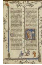
6. French Initial C: Clerics Singing from a Choir Book, about 1320 - 1325 from Breviary Tempera colors, gold leaf, and ink on parchment Leaf (trimmed): 16.7 x 11.1 cm (6 9/16 x 4 3/8 in.) The J. Paul Getty Museum, Los Angeles Ms. Ludwig IX 2, fol. 58v (83.ML.98.58v)