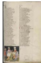
10. German Uriah at David's Table, about 1400 - 1410 with addition in 1487 from World Chronicle Tempera colors, gold, silver paint, and ink on parchment Leaf: 33.5 x 23.5 cm (13 3/16 x 9 1/4 in.) The J. Paul Getty Museum, Los Angeles Ms. 33, fol. 192 (88.MP.70.192)