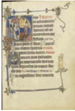
5. French Initial D: Christ before Caiaphas; Initial D: The Virgin Mary with Apostles, Beginning of 14th century from Ruskin Hours Tempera colors, gold leaf, and ink on parchment Leaf: 26.4 x 18.3 cm (10 3/8 x 7 3/16 in.) The J. Paul Getty Museum, Los Angeles Ms. Ludwig IX 3, fol. 29 (83.ML.99.29)