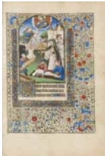
13. Workshop of the Bedford Master French, active first half of 15th century A Burial, about 1440 - 1450 from Book of Hours Tempera colors, gold leaf, gold paint, and ink on parchment Leaf: 23.5 x 16.4 cm (9 1/4 x 6 7/16 in.) The J. Paul Getty Museum, Los Angeles Ms. Ludwig IX 6, fol. 133 (83.ML.102.133)