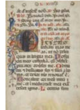
12. Italian Initial D: A Monk with His Finger to His Lips , about 1420 Leaf from a Noted Breviary (Fol. 73) Tempera colors, gold leaf, and ink on parchment Leaf (approx.): 46.5 x 34.6 cm (18 5/16 x 13 5/8 in.) The J. Paul Getty Museum, Los Angeles Ms. 24, leaf 1 (86.ML.674.1.recto)