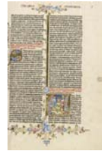
14. Circle of Stefan Lochner German, died 1451 Initial A: The Coronation of David , about 1450 from Bible Gold leaf, tempera, and black ink on parchment Leaf: 36.7 x 26 cm (14 7/16 x 10 1/4 in.) The J. Paul Getty Museum, Los Angeles Ms. Ludwig I 13, fol. 126 (83.MA.62.126)