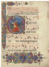
15. Attributed to Franco dei Russi Italian, active about 1453 - 1482 Initial E: David Lifting up His Soul to God , about 1455 - 1460/1463 Leaf from the Antiphonal of Cardinal Bessarion Tempera colors, gold leaf, and ink on parchment Image: 20.3 x 19.1 cm (8 x 7 1/2 in.) The J. Paul Getty Museum, Los Angeles Ms. 99, recto (2007.30.recto)