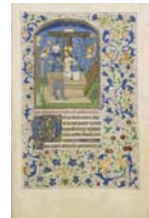
16. Willem Vrelant or workshop Flemish, died 1481, active 1454 - 1481 The Man of Sorrows , Early 1460s from Arenberg Hours Tempera colors, gold leaf, and ink on parchment Leaf: 25.6 x 17.3 cm (10 1/16 x 6 13/16 in.) The J. Paul Getty Museum, Los Angeles Ms. Ludwig IX 8, fol. 234 (83.ML.104.234)