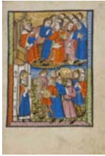
11. British David Bringing the Ark of the Covenant to Jerusalem, 15th century from Life of Christ with added devotional texts and illuminations Tempera colors and gold leaf on parchment Leaf: 11.9 x 17 cm (4 11/16 x 6 11/16 in.) The J. Paul Getty Museum, Los Angeles Ms. 101, fol. 14 (2008.3.14)