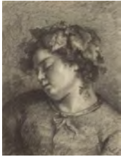
36. Gustave Courbet French, 1819 - 1877 Sleeping Bacchante , 1847 Charcoal 50.2 x 38.7 cm (19 3/4 x 15 1/4 in.) 99.GE.43