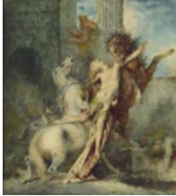
38. Gustave Moreau French, 1826 - 1898 Diomedes Being Devoured by His Horses , 1866 Watercolor over graphite 21.4 x 19.7 cm (8 7/16 x 7 3/4 in.) 98.GC.153