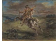
37. Eugène Delacroix French, 1798 - 1863 The Education of Achilles , 1862 Pastel 30.6 x 41.9 cm (12 1/16 x 16 1/2 in.) 86.GG.728