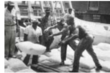
38. Henri Cartier-Bresson French, 1908 - 2004, active France, Mexico and Far East 1930s - 1940s Loading Flour in Houston's Port, 1957 Gelatin silver print Image: 16.8 x 25.2 cm (6 5/8 x 9 15/16 in.) The J. Paul Getty Museum, Los Angeles 2004.74.35