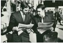
41. Garry Winogrand American, 1928 - 1984 [New York City], May 8, 1968 Gelatin silver print Image: 23 x 34.1 cm (9 1/16 x 13 7/16 in.) The J. Paul Getty Museum, Los Angeles 84.XM.1023.1