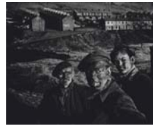
32. W. Eugene Smith American, 1918 - 1978 [Welsh Miners], 1950 Gelatin silver print Image: 33 x 40.8 cm (13 x 16 1/16 in.) The J. Paul Getty Museum, Los Angeles 84.XM.1014.2