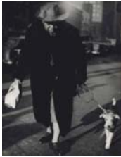
25. Lisette Model American, born Austria 1901 - 1983 [Lower East Side, New York], 1939 - 1946 Gelatin silver print Image: 34.6 x 26.8 cm (13 5/8 x 10 9/16 in.) The J. Paul Getty Museum, Los Angeles 84.XM.153.19