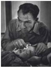
31. W. Eugene Smith American, 1918 - 1978 [Country Doctor], 1948 Gelatin silver print Image: 19.7 x 14.8 cm (7 3/4 x 5 13/16 in.) The J. Paul Getty Museum, Los Angeles 84.XP.904.10