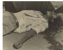
22. Manuel Álvarez Bravo Mexican, 1902 - 2002 Striking Worker Murdered, 1934 Gelatin silver print Image: 19.1 x 24.1 cm (7 1/2 x 9 1/2 in.) The J. Paul Getty Museum, Los Angeles © Asociación Manuel Álvarez Bravo AC 92.XM.23.27