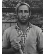
34. Paul Strand American, 1890 - 1976 River Man, Luzzara, Italy, 1953 Gelatin silver print Image (trimmed to mount): 14.9 x 11.7 cm (5 7/8 x 4 5/8 in.) The J. Paul Getty Museum, Los Angeles 86.XM.683.29