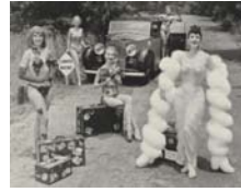
30. Ralph Steiner American, 1899 - 1986 Gypsy Rose Lee and Her Girls , 1944 Gelatin silver print Image: 26.5 x 33.8 cm (10 7/16 x 13 5/16 in.) The J. Paul Getty Museum, Los Angeles 84.XP.453.8