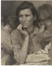
23. Dorothea Lange American, 1895 - 1965 Human Erosion in California (Migrant Mother) , March 1936 Gelatin silver print Image: 34.1 x 26.8 cm (13 7/16 x 10 9/16 in.) The J. Paul Getty Museum, Los Angeles 98.XM.162