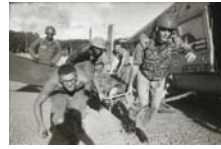
40. Larry Burrows British, 1926 - 1971 [Vietnam], July 12, 1966 Gelatin silver print Image: 34.3 x 24.1 cm (13 1/2 x 9 1/2 in.) The J. Paul Getty Museum, Los Angeles 2005.47.6