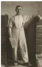
21. August Sander German, 1876 - 1964 [Master Mason (building a Chimney) (Maurermeister (am Kaminbau)), 1932 Gelatin silver print Image: 28.9 x 17.9 cm (11 3/8 x 7 1/16 in.) The J. Paul Getty Museum, Los Angeles 84.XM.498.10