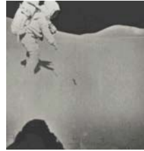
42. James B. Irwin American, 1930 - 1991 NASA Astronaut, Lunar Surface , August 1, 1971 Gelatin silver print The J. Paul Getty Museum, Los Angeles 84.XP.775.12