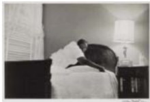
39. William Eggleston American, born 1939 Sumner, Mississippi, about 1965 Gelatin silver print Image: 17.3 x 24 cm (6 13/16 x 9 7/16 in.) The J. Paul Getty Museum, Los Angeles 2000.41.14