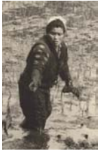
35. Hamaya, Hiroshi Japanese, 1915 - 1999 [Rice Planting No. 1], 1955 Gelatin silver print Image: 30.5 x 20.1 cm (12 x 7 15/16 in.) The J. Paul Getty Museum, Los Angeles 2007.20.1