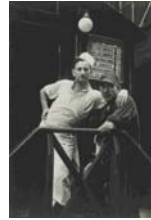
18. Walker Evans American, 1903 - 1975 Second Avenue Lunch, New York, 1931 Gelatin silver print Image: 20.3 x 14 cm (8 x 5 1/2 in.) The J. Paul Getty Museum, Los Angeles 84.XM.956.503