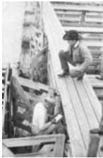
37. Henri Cartier-Bresson French, 1908 - 2004, active France, Mexico and Far East 1930s - 1940s Cattle Stockyards in Houston, Texas, 1957 Gelatin silver print Image: 25.5 x 16.7 cm (10 1/16 x 6 9/16 in.) The J. Paul Getty Museum, Los Angeles 2004.74.28