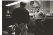
44. Leonard Freed American, 1929 - 2006 [Police Work, New York City], 1978 Gelatin silver print Image: 22.6 x 34.3 cm (8 7/8 x 13 1/2 in.) The J. Paul Getty Museum, Los Angeles 2006.8.12