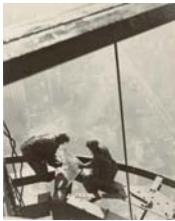
19. Lewis W. Hine American, 1874 - 1940 Empire State Building, New York, 1931 Gelatin silver print Image: 24.1 x 19.2 cm (9 1/2 x 7 9/16 in.) The J. Paul Getty Museum, Los Angeles 84.XM.470.1