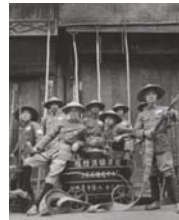
28. Carl Mydans American, 1907 - 2004 China, Village Fire Department Lung Chuan-I, 1941 Gelatin silver print Image: 32.5 x 26.2 cm (12 13/16 x 10 5/16 in.) Gift of the Estate of Carl Mydans. The J. Paul Getty Museum, Los Angeles 2005.49.32