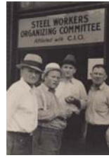
26. Arthur Rothstein American, 1915 - 1985 [Organized], about 1940 Gelatin silver print Image: 23.3 x 16.2 cm (9 3/16 x 6 3/8 in.) The J. Paul Getty Museum, Los Angeles 84.XP.727.16