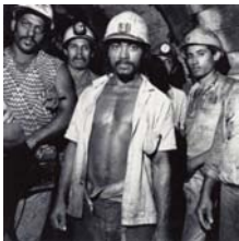
45. Milton Rogovin American, born 1909 Cuba, 1989 Gelatin silver print Image: 18 x 17.7 cm (7 1/16 x 6 15/16 in.) The J. Paul Getty Museum, Los Angeles 2003.80.17.1