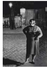
20. Brassai French, born Hungary 1899 - 1984 [Streetwalker near the Place d'Italie, Paris], 1932 Gelatin silver print Image: 29.6 x 21.4 cm (11 5/8 x 8 3/8 in.) The J. Paul Getty Museum, Los Angeles 84.XM.1024.14