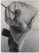
17. Albert Renger-Patzsch German, 1897 - 1966 [Shrimp Fisherwoman], 1927 Gelatin silver print Image: 22.7 x 16.7 cm (8 15/16 x 6 9/16 in.) The J. Paul Getty Museum, Los Angeles 84.XM.173.29