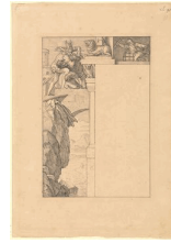
26. Julius Schnorr von Carolsfeld German, 1794 - 1872 Siegfried Battles with the Gatekeeper as Alberich Approaches (from the Nibelungenlied) , 1865 Gray ink on buff-colored paper Image: 20.1 × 13.5 cm (7 15/16 × 5 5/16 in.) The J. Paul Getty Museum, Los Angeles 2009.72