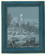
17. Jean-Baptiste Oudry French, 1686 - 1755 The Wolf and the Fox (from the Fables of La Fontaine) , 1733 Brush and black ink and brush and gray wash, heightened with white gouache, on blue paper 31.1 × 26 cm (12 1/4 × 10 1/4 in.) The J. Paul Getty Museum, Los Angeles 2002.52.2