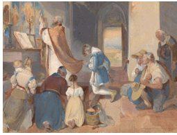
25. Peter Fendi Austrian, 1796 - 1842 Fridolin Assists with the Holy Mass , 1833 Gouache, watercolor and graphite on board 23.4 × 30.9 cm (9 3/16 × 12 3/16 in.) The J. Paul Getty Museum, Los Angeles 2009.61