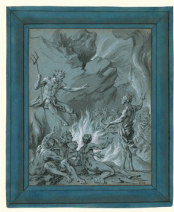
19. Jean-Baptiste Oudry French, 1686 - 1755 Belphagore (from the Contes et Nouvelles of La Fontaine) , 1734 Brush and black ink, gray wash, heightened with white gouache, on blue paper 31.1 × 26 cm (12 1/4 × 10 1/4 in.) The J. Paul Getty Museum, Los Angeles 2002.52.4