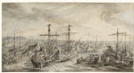
21. Gabriel Jacques de Saint-Aubin French, 1724 - 1780 The Roman Fleet Victorious over the Carthaginians at the Battle of Cape Ecnomus , About 1763 Watercolor, gouache, pen and India and brown ink over black chalk 21.5 × 39.6 cm (8 7/16 × 15 9/16 in.) The J. Paul Getty Museum, Los Angeles 2006.23