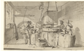
20. Jean-Michel Moreau le jeune French, 1741 - 1814 The Nail Maker's Workshop , About 1763 Pen and black ink and brush with gray wash over traces of black chalk 11.7 × 24.1 cm (4 5/8 × 9 1/2 in.) The J. Paul Getty Museum, Los Angeles 2004.87