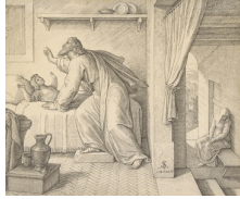
23. Julius Schnorr von Carolsfeld German, 1794 - 1872 Elijah Revives the Son of the Widow of Zarephath (from the Book of Kings) , 1842 Black ink pen and ink with traces of graphite 21.7 × 26.1 cm (8 9/16 × 10 1/4 in.) The J. Paul Getty Museum, Los Angeles 2009.13