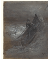
22. Gustave Doré French, 1832 - 1883 After the Shipwrecking (from The Rime of the Ancient Mariner) , About 1875 Gouache and ink 50.8 × 40.5 cm (20 × 15 15/16 in.) The J. Paul Getty Museum, Los Angeles 2008.30