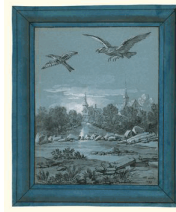
18. Jean-Baptiste Oudry French, 1686 - 1755 The Eagle and the Magpie (from the Fables of La Fontaine) , 1733 Brush and black ink, gray wash, heightened with white gouache, on blue paper 30.6 × 25.6 cm (12 1/16 × 10 1/16 in.) The J. Paul Getty Museum, Los Angeles 2002.52.3