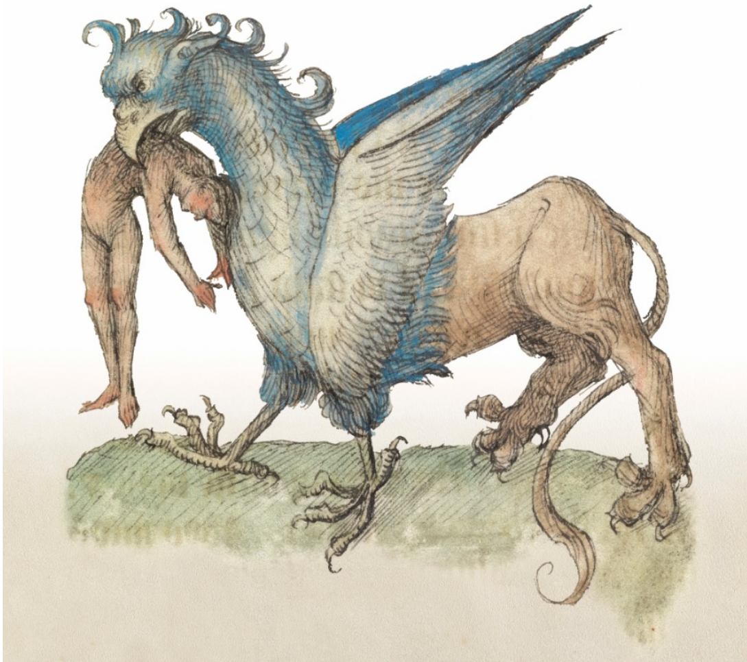
Griffin (detail), from Book of Flowers , France and Belgium, 1460. Tempera colors on parchment, 40.8 × 28.6 cm. Koninklijke Bibliotheek, The Hague, Ms. 72 A 23, fol. 46