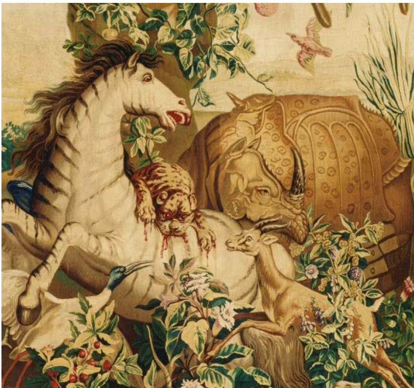
The Striped Horse from The Ancient India Series