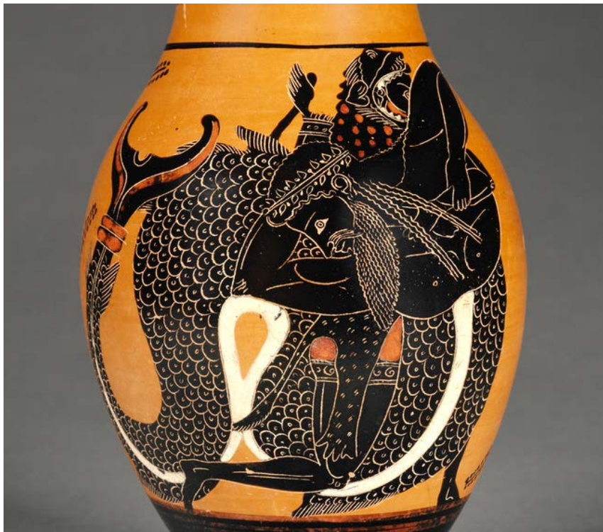
Attic Black-Figure Olpe