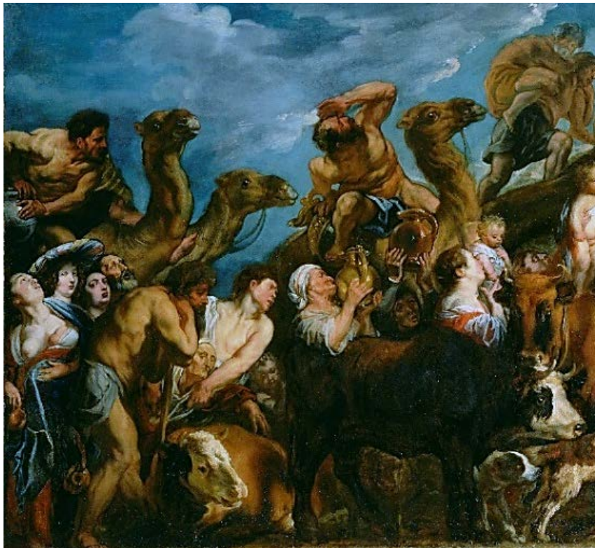
Moses Striking Water from the Rock