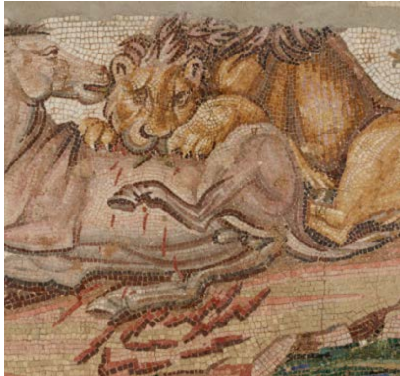
Mosaic of a Lion Attacking an Onager