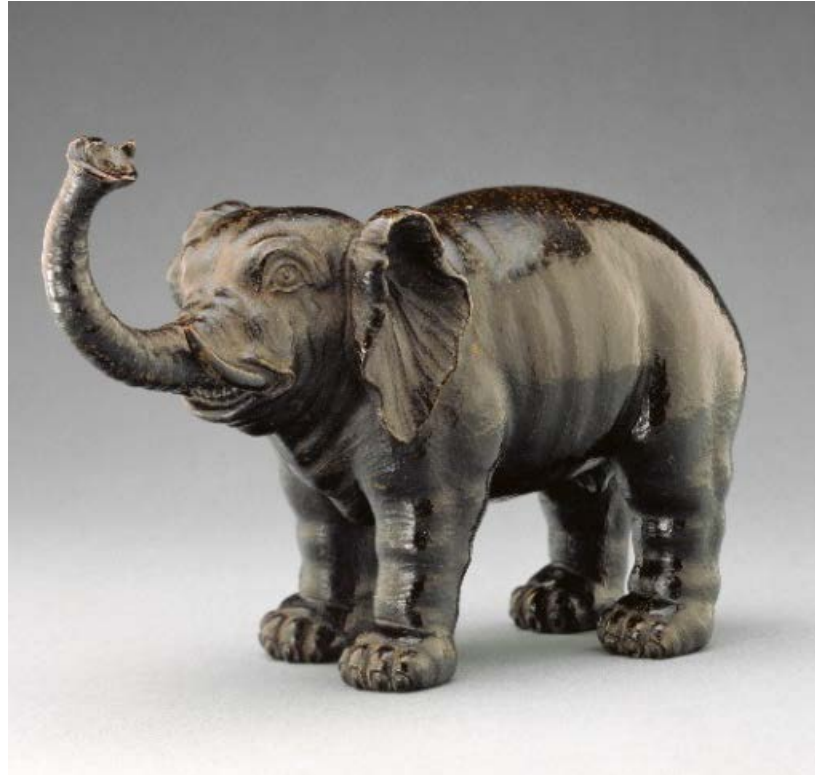
Elephant with Raised Trunk